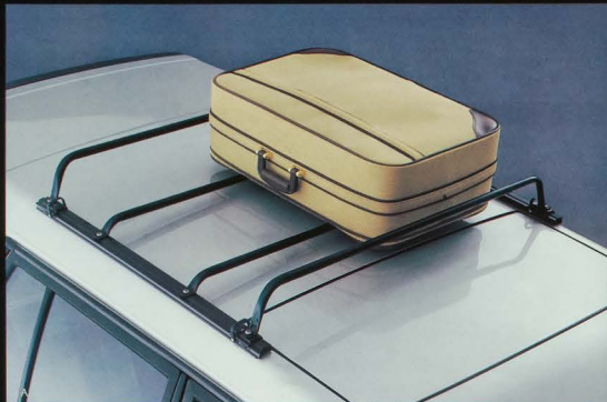
Luggage Rack shown above. Ski rack adapters for this rack shown on opposite page. Bicycle adapters also available.