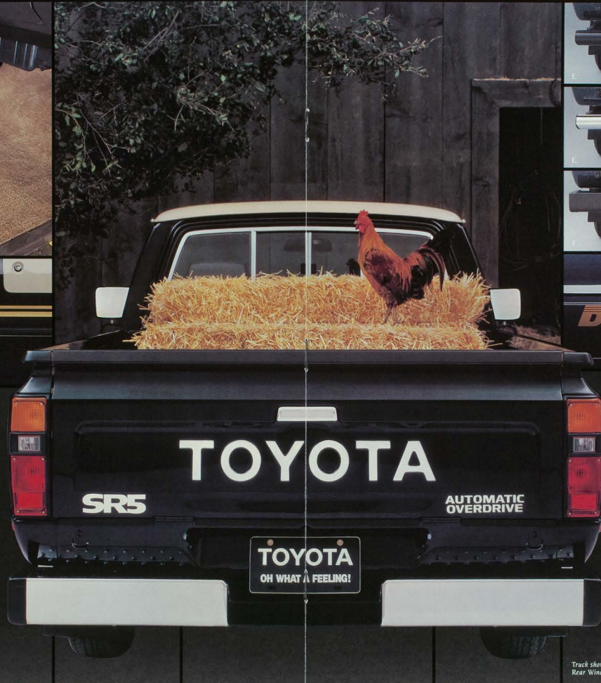
Truck shown with Optional Sliding Rear Window Kit.

D. Body side moldings help keep the side of your truck free of dings and dents. The matte black finish gives any truck a dramatic, contrasting look, and effective protection.