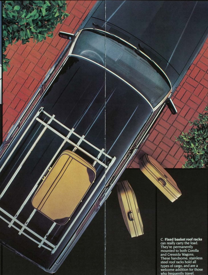
C. Fixed basket roof racks can really carry the load. They're permanently mounted to both Corolla and Cressida Wagons.

provides for more complete combustion. Toyota offers a complete line of replacement parts including Block heaters and Halogen headlamps .