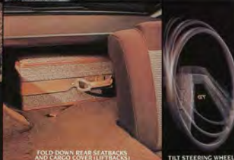
FOLD-DOWN REAR SEAT BACKS AND CARGO COVER LIFTBACK