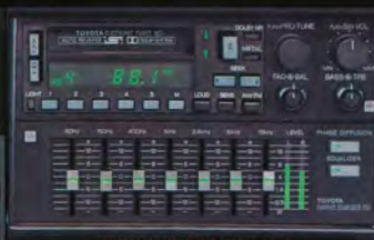
ELECTRONIC AM/FM/MPX STEREO TUNER WITH CASSETTE GRAPHIC EQUALIZER