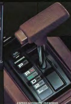
4-SPEED AUTOMATIC OVERDRIVE

Consider optional variable assist power steering, air conditioning, Cruise Control, Toyota's innovative 4-speed automatic overdrive transmission or an electronic AM/FM/MPX tuner with cassette and graphic equalizer.