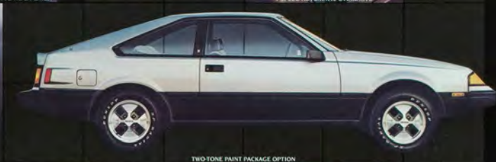
TWO-TONE PAINT PACKAGE OPTION