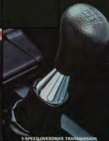
5-SPEED OVERDRIVE TRANSMISSION