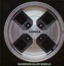
ALUMINUM ALLOY WHEELS