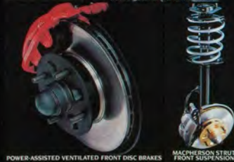
POWER-ASSISTED VENTILATED FRONT DISC BRAKES