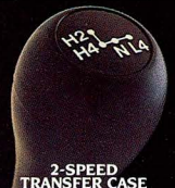
2-SPEED TRANSFER CASE

Both Hardtop and Wagon have the rugged features and heavy-duty equipment needed for serious off-roading.