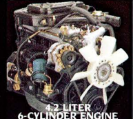
4.2 LITER 6-CYLINDER ENGINE