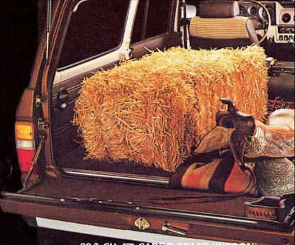
99.3 CU. FT. CARGO SPACE (WAGON)