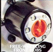
FREE-WHEELING FRONT HUBS