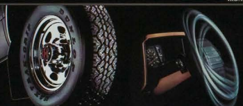
FREE-WHEELING LOCKING FRONT HUBS