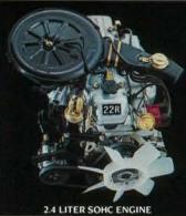
2.4 LITER SOHC ENGINE

Proven Reliable 4Runner's husky 2.4 liter SOHC engine has proven itself in millions of tough Toyotas. Its broad power band makes 4Runner equally at home on the highway and in the high country.