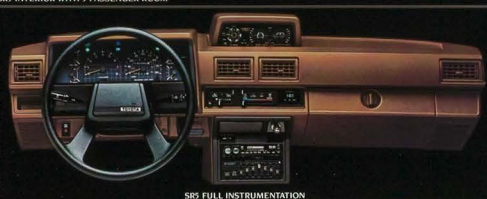
SR5 FULL INSTRUMENTATION