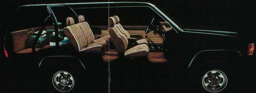
4RUNNER SR5 INTERIOR WITH 5-PASSENGER ROOM