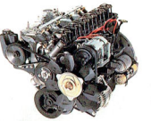
The Cherokee 4 litre high-output multi-point fuel-injected engine produces excellent torque with high fuel efficiency.

at your fingertips, including power windows, power mirrors, power steering and central door locking with keyless entry, high-quality CD-compatible cassette/radio, leather-wrapped tilt-adjustable steering wheel and rear wash/wipe are all standard.