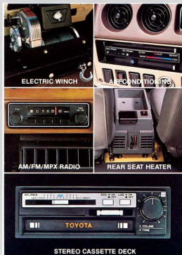
Standard features and options pictured above vary according to models. See Features chart for complete details.

You're never going to get yourself in a spot where you'll need an electric steel cable power winch (Hardtop only) to haul yourself out, but you might want to be able to rescue some fellow off-roader or clear logs and boulders from the trail. Air conditioning is a real comfort plus, on and off the pavement. A radio or stereo tape deck is good company on long trips. Free-wheeling/locking front hubs improve gas mileage on the pavement (they're standard on the Wagon). Power steering makes a big difference when you're picking your way through the rough stuff (also standard on the Wagon). Ask your Toyota dealer for a full list of other Land Cruiser off-roading options.