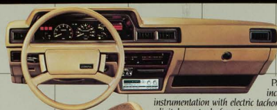
Padded dash includes full instrumentation with electric tachometer and digital quartz clock on Luxury Edition models.

Luxury Edition standard features include 4-speaker AM/FM/MPX stereo receiver, reclining seats, tungsten halogen headlights.