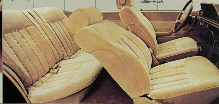
Luxury Edition's lighted entry system invites you into an interior with soft cloth reclining front bucket seats, and deep pile carpeting underfoot.

A select group of options further enhances Corona's luxury. A 4-speed automatic overdrive transmission is standard on LE models, optional on Deluxe Wagon.