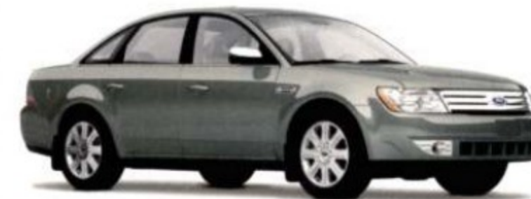
Titanium Green Metallic