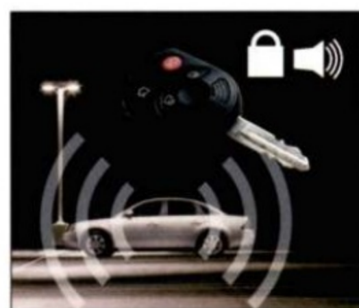
VEHICLE SECURITY SYSTEM