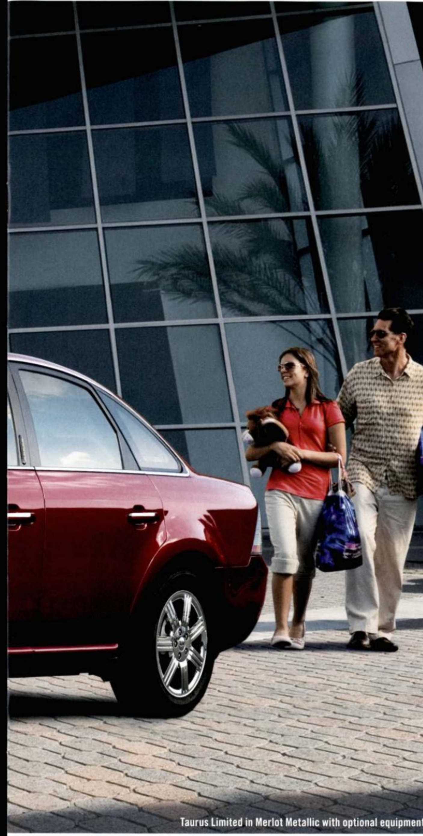
Taurus Limited in Merlot Metallic with optional equipment

Taurus doesn't go unnoticed. The signature tri-bar chrome grille is a focal point, boldly bridging the sculpted hood and shapely front fascia. Fog lamps are surrounded by chrome, a striking chrome side vent dresses up each front fender, and wraparound halogen headlamps have a jewel-like look.