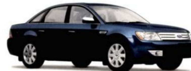
Dark Ink Blue Metallic