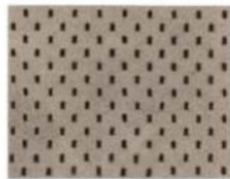
Camel Leather Standard on Limited; Available on SEL