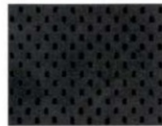
Black Leather Standard on Limited