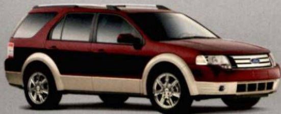
All-New Taurus X

1 Mid-20s mpg hwy, based on preliminary Ford testing.