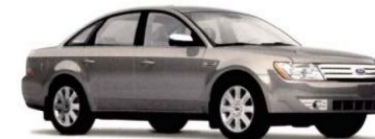
Silver Birch Metallic