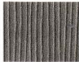
Medium Light Stone Cloth Standard on SEL