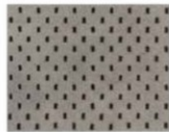
Medium Light Stone Leather Standard on Limited; Available on SEL