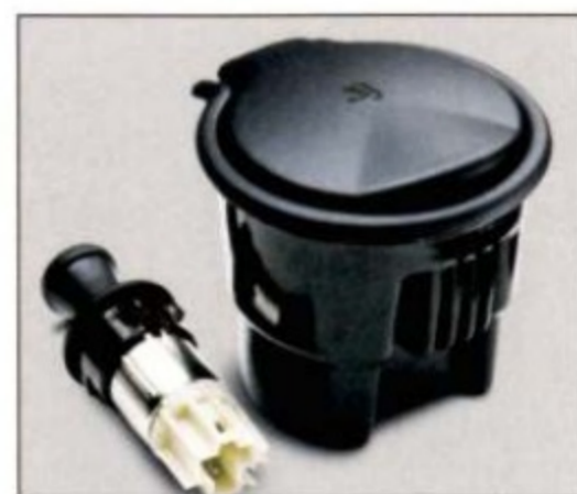
SMOKER'S PACK WITH ASHCUP/COIN HOLDERS