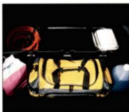
TRUNK CARGO ORGANIZERS