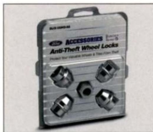
ANTI-THEFT WHEEL LOCKS