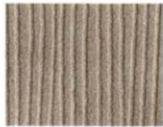
Camel Cloth Standard on SEL