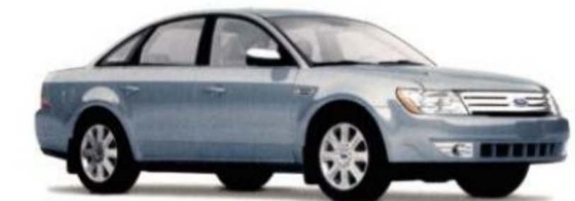
Light Ice Blue Metallic