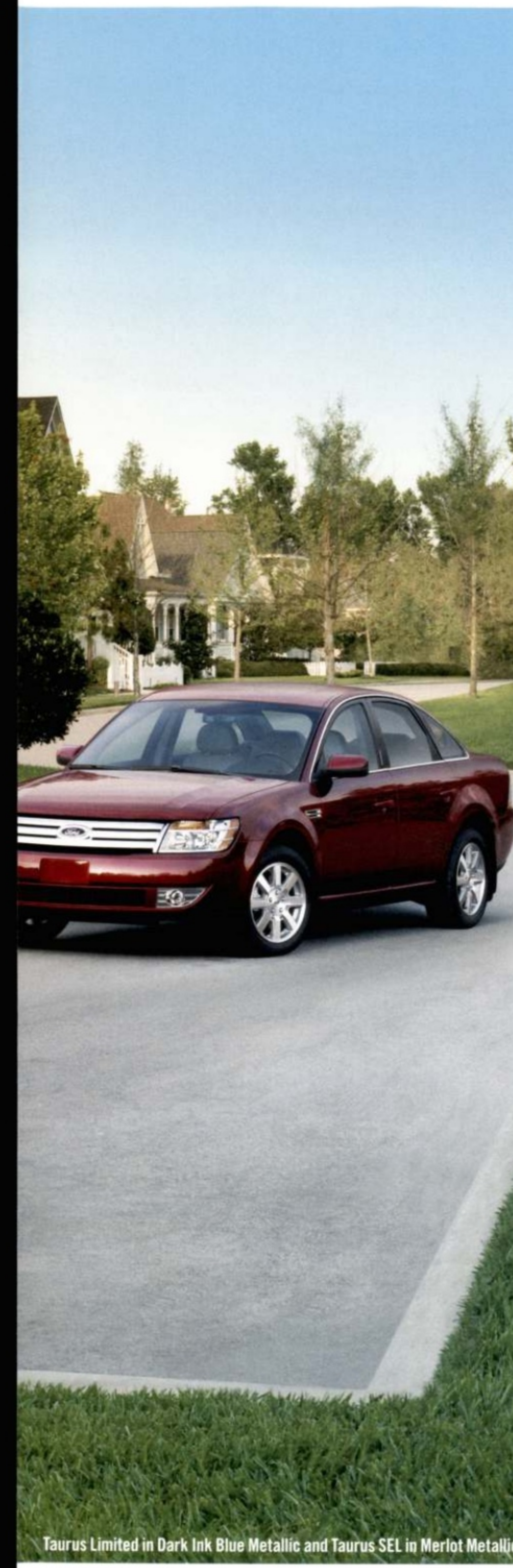
Taurus Limited in Dark Ink Blue Metallic and Taurus SEL in Merlot Metallic