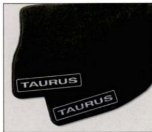
CARPETED FLOOR MATS

Engineered by Ford for excellent fit and long-wearing durability, Genuine Ford Accessories offer you serious style and quality. When installed by your Ford Dealer at the time of purchase or lease, they're backed by a 3-year/36,000-mile limited warranty. 1 And now, Ford's vehicle Accessorizer puts personalization in the fast lane. This exciting new online tool lets you see how Genuine Ford Accessories will look on your Taurus. Take it for a test drive at fordaccessoriesstore.com .