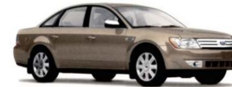
Dune Pearl Metallic