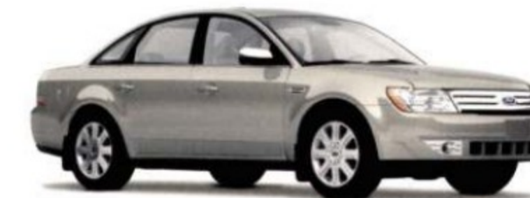
Light Sage Metallic