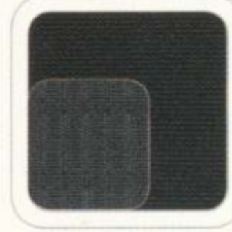
Charcoal Black Cloth Standard on XLT