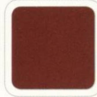
Dark Copper Metallic