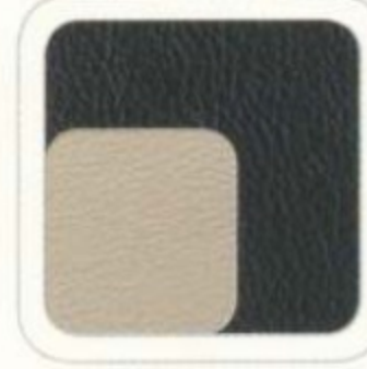
Charcoal Black Leather with Camel Inserts Standard on Eddie Bauer