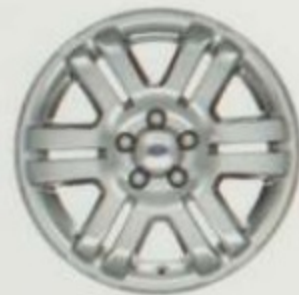
18-in. Chrome-Clad Aluminum Standard on Eddie Bauer