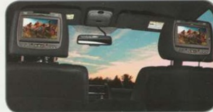
Dual INVISION DVD Headrests¹