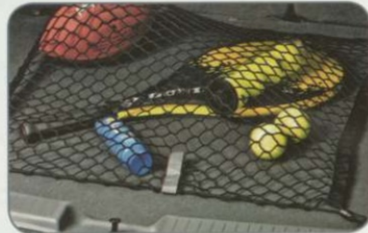
Interior cargo net