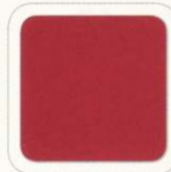
Sangria Red Metallic