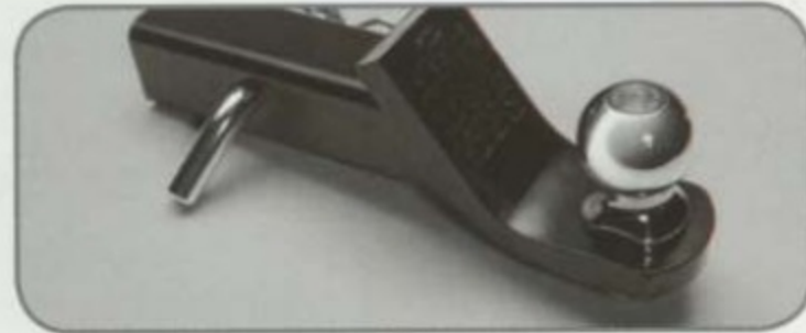
Trailer hitch balls/draw bars