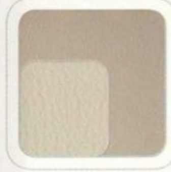
Camel Leather with Sand Inserts Standard on Eddie Bauer and Limited; Optional on XLT