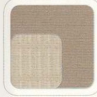
Camel Cloth with Sand Inserts Standard on XLT