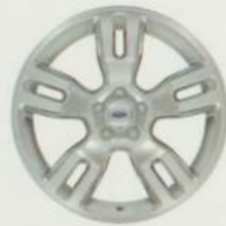
20-in. Polished-Aluminum Standard on Limited