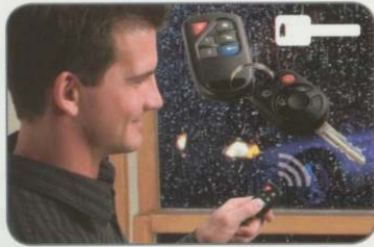
Remote start systems