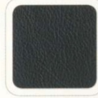
Charcoal Black Leather Standard on Limited; Optional on XLT