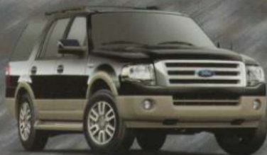
Expedition & Expedition MAX