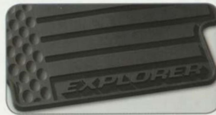
All-weather floor mats