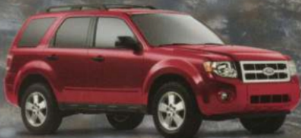
Escape & Escape Hybrid