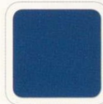
Sport Blue Metallic