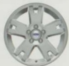
17-in. Machined-Aluminum Standard on XLT