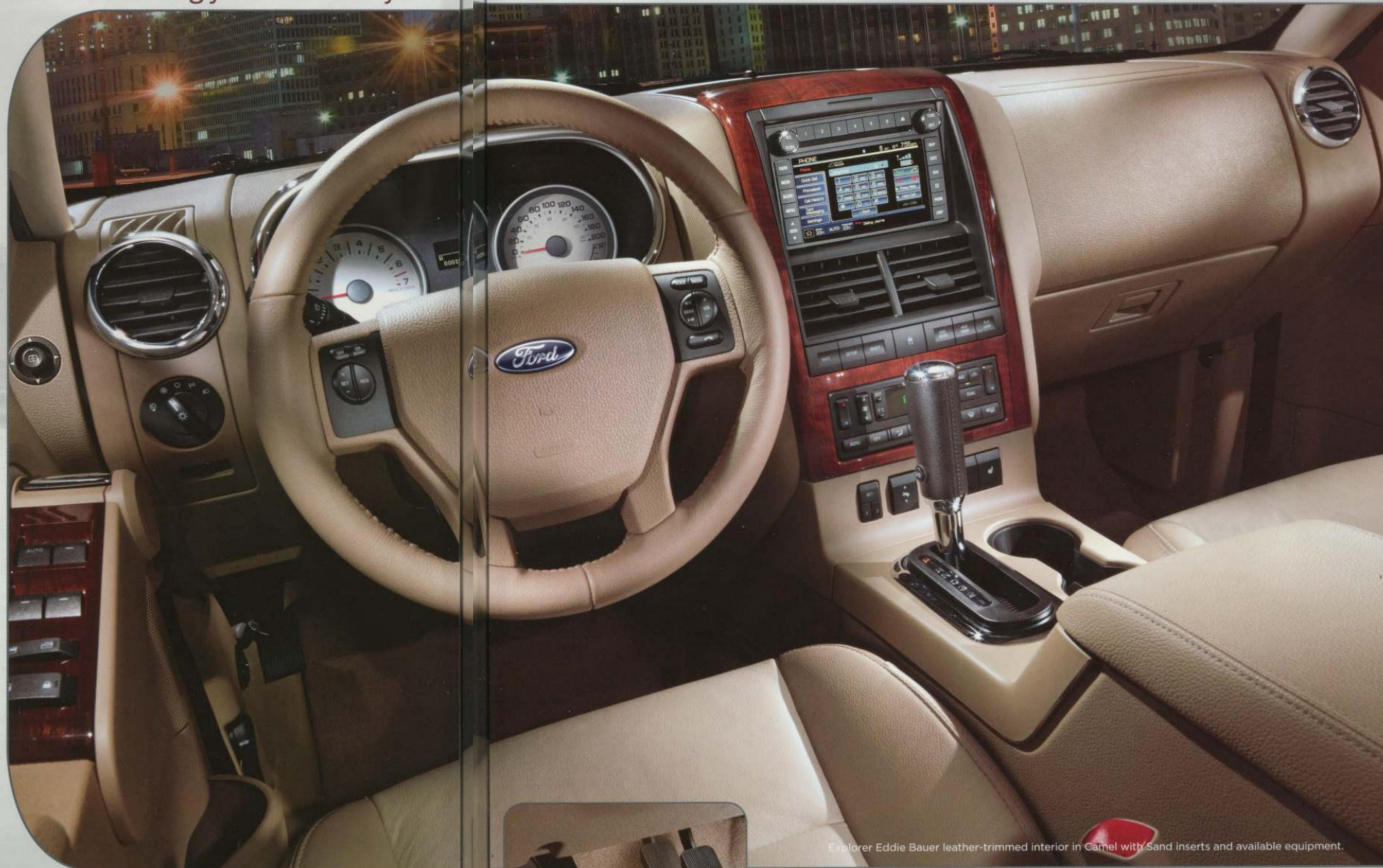
Explorer Eddie Bauer leather-trimmed interior in Camel with Sand inserts and available equipment.

Driving while distracted may result in loss of vehicle control. Only use mobile phones and other devices, even with voice commands, when it is safe to do so. The Bluetooth word mark is a registered trademark owned by the Bluetooth SIG, Inc. Microsoft is a registered trademark of Microsoft Corporation.