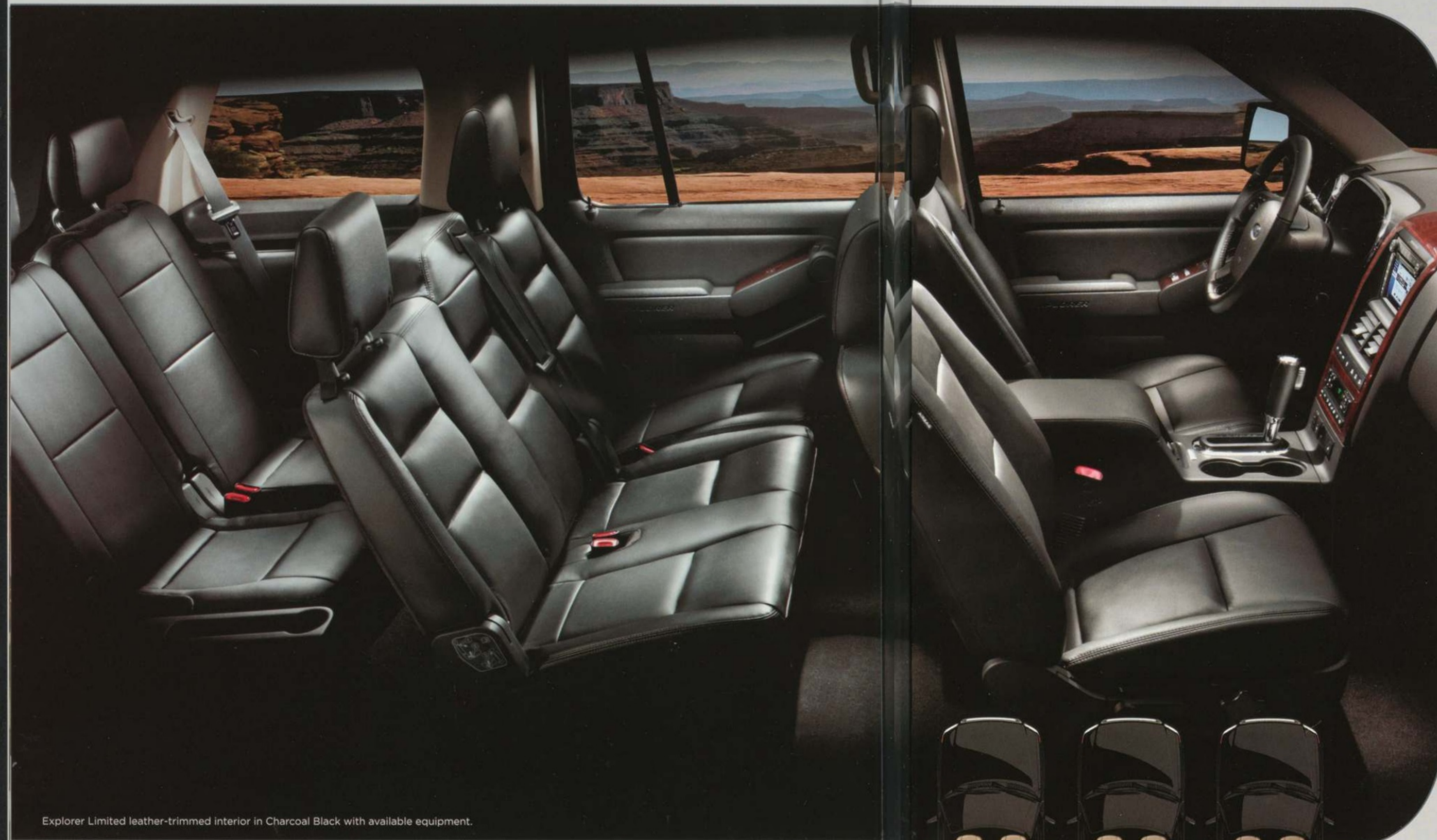
Explorer Limited leather-trimmed interior in Charcoal Black with available equipment.