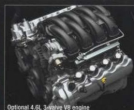
Optional 4.6L 3-valve V8 engine