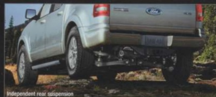
Independent rear suspension