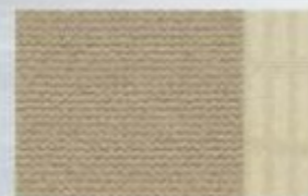
Camel Cloth with Sand Inserts Standard on XLT