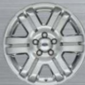
18" Chrome-Clad Aluminum Included in Limited Chrome Package