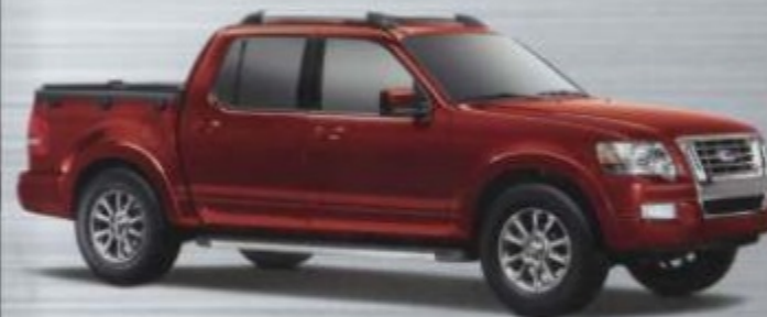
Dark Copper Metallic