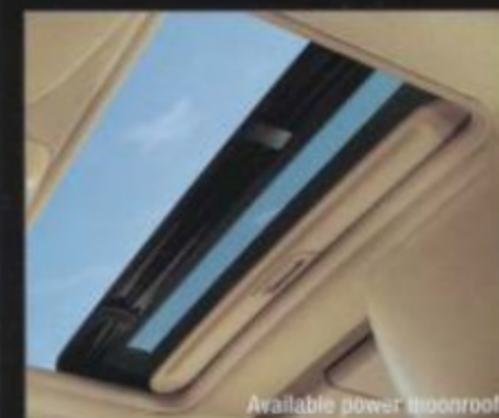
Available power moonroof