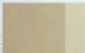
Camel Leather with Sand Inserts Standard on Limited