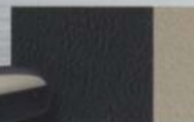
Charcoal Black Leather with Medium Light Stone Inserts (shown) Standard on Limited