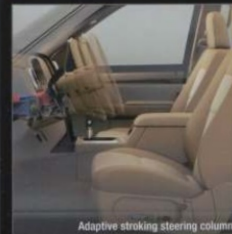
Adaptive stroking steering column