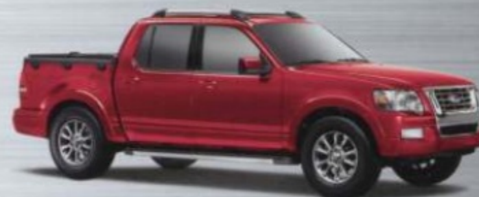
Sangria Red Metallic