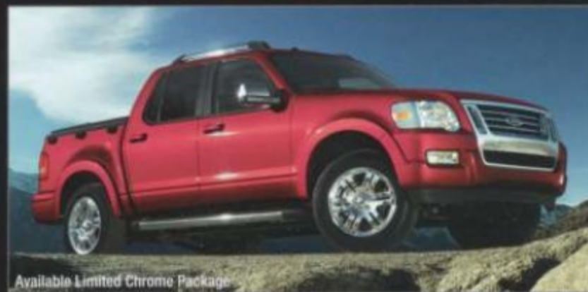
Available Limited Chrome Package