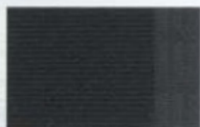
Charcoal Black Cloth Standard on XLT