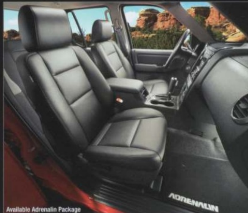
Available Adrenalin Package

20" polished-aluminum wheels with P255/50R20 A/S BSW tires; Black grille; unique front and rear fascias; unique fender vents; unique fog lamps and headlamps; unique running boards; single rear-exit exhaust with dual tip; Adrenalin tailgate badge; Charcoal Black instrument panel, seats, door inserts and console lid; Stone headliner; Charcoal Black leather-trimmed heated front seats with perforated leather inserts; and Adrenalin-branded floor mats (wheel lips and roof side rails are deleted) (Available on Limited; not available with Limited Chrome Package)