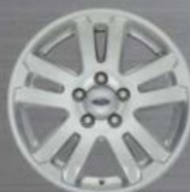
17" Painted Cast-Aluminum Included in XLT Appearance Package