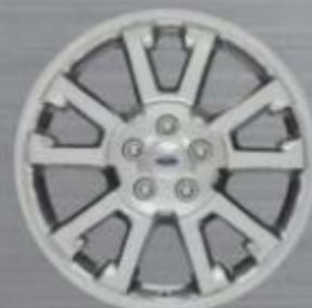
18" Machined-Aluminum Standard on Limited