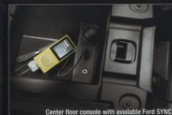
Center floor console with available Ford SYNC