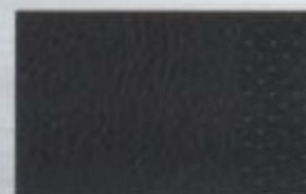
Charcoal Black Leather with Perforated Inserts Standard on Limited with Adrenalin Package