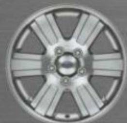
16" Painted Cast-Aluminum Standard on XLT