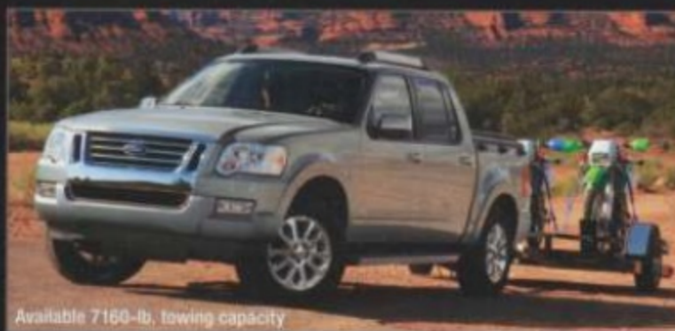
Available 7160-lb. towing capacity