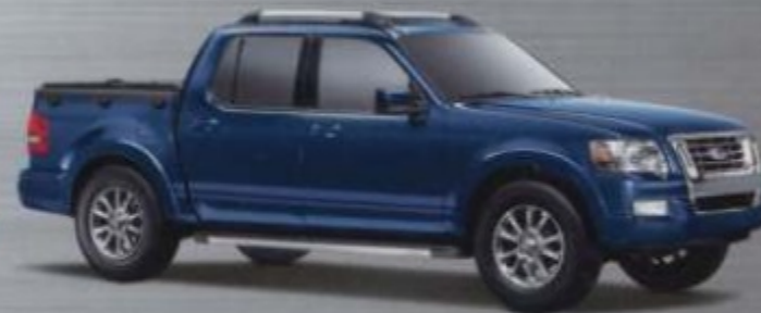
Sport Blue Metallic