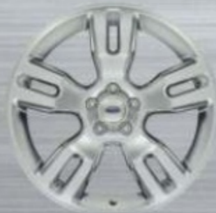
20" Polished-Aluminum Included in Adrenalin Package