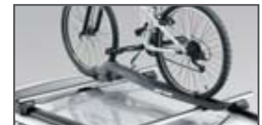
Mont Blanc Bike Module