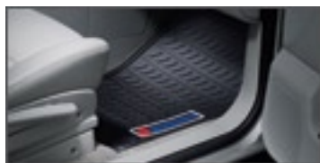
All Weather Floor Mats - 3pc set