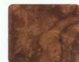
Brown Swirl Walnut Wood