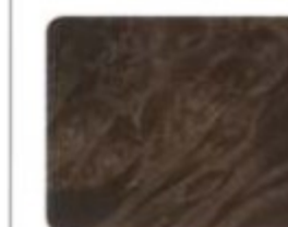
Prussian Burl Wood

Available with exterior colours 1, 3, 4, 5, 6, 8, 9, 10