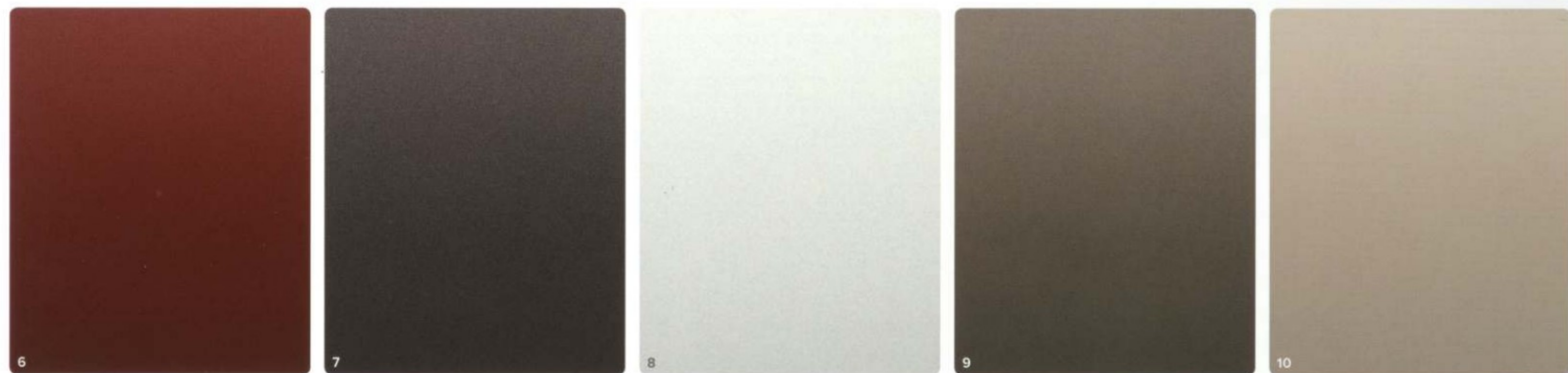
1. Black Velvet 2. Ruby Red Metallic Tinted Clearcoat † 3. Ingot Silver Metallic 4. Guard Metallic 5. Java Metallic 6. Bronze Fire Metallic Tinted Clearcoat † 7. Magnetic Metallic 8. White Platinum Metallic Tri-coat † 9. Luxe Metallic 10. Platinum Dune Metallic Tri-coat †