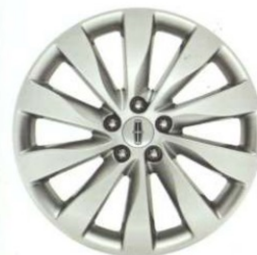
19" Premium Painted Aluminum Standard