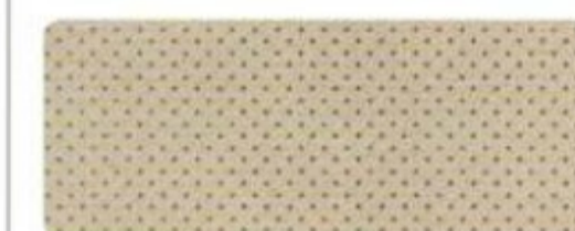
Light Dune Leather