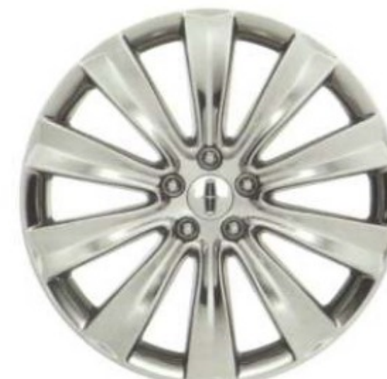
20" Polished Aluminum Standard on EcoBoost