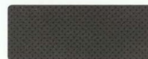
Charcoal Black Leather