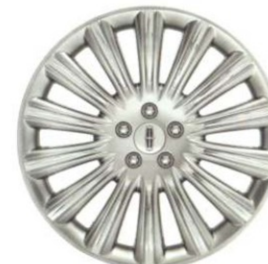
20" Premium Painted Aluminum with Chrome Inserts Available (Not available with EcoBoost)