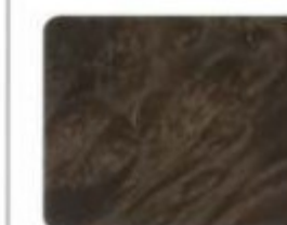
Prussian Burl Wood