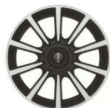
19-inch Polished Aluminum With Premium Ebony-painted Pockets STANDARD ON RESERVE WITH 3.0L