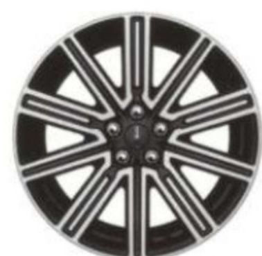
19-inch Polished Aluminum With Premium Ebony-painted Pockets STANDARD ON RESERVE