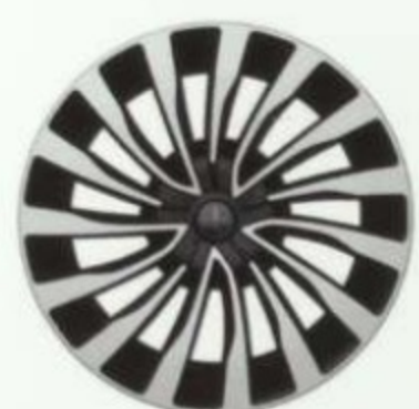
20-inch Polished Aluminum With Premium Ebony-painted Pockets STANDARD UNIQUE LINCOLN BLACK LABEL