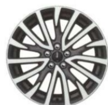
19-inch Premium Dark Stainless-painted Aluminum With Chrome Inserts STANDARD ON SELECT