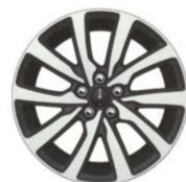
18-inch Premium Magnetic-painted Aluminum STANDARD ON PREMIERE