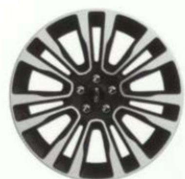
20-inch Polished Aluminum With Dark Tarnish-painted Pockets OPTIONAL ON SELECT AND RESERVE