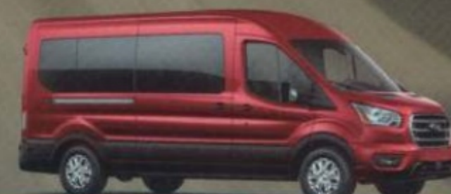
MEDIUM ROOF | LONG LENGTH | SRW