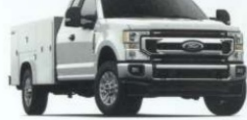
2020 SUPER DUTY CHASSIS CAB

TorqShift ® 10-speed SelectShift automatic with Selectable Drive Modes