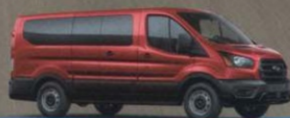
LOW ROOF | REGULAR LENGTH | SRW