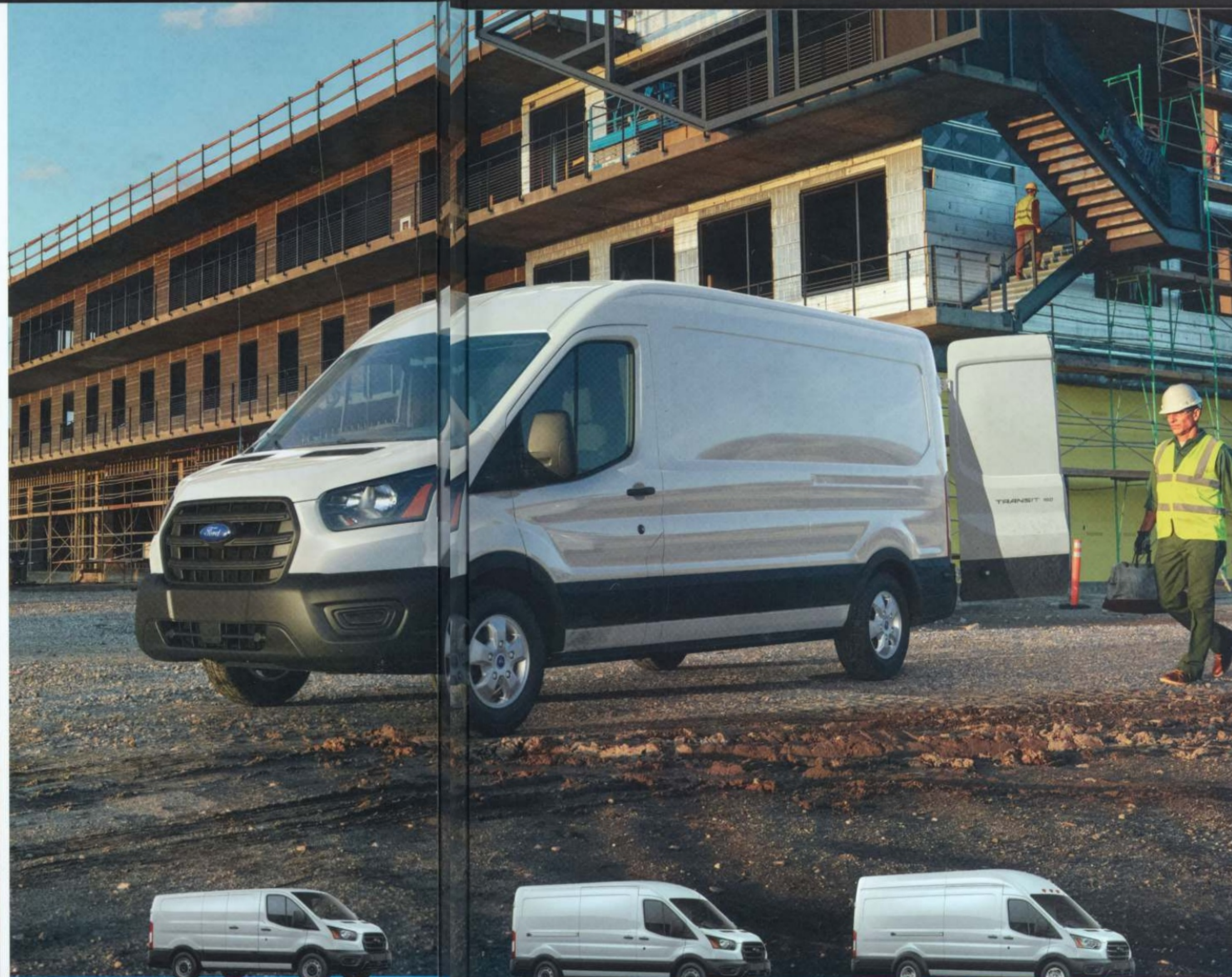
LOW ROOF | REGULAR LENGTH | SRW