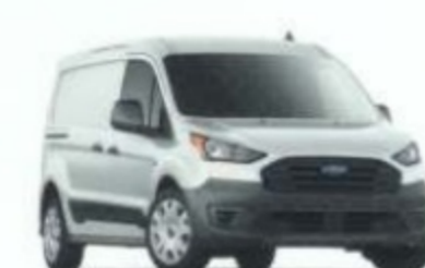
2020 TRANSIT CONNECT