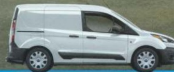
CARGO VAN | SWB