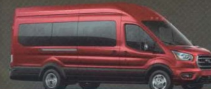
HIGH ROOF | EXTENDED LENGTH | DRW