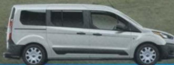
PASSENGER WAGON | LWB