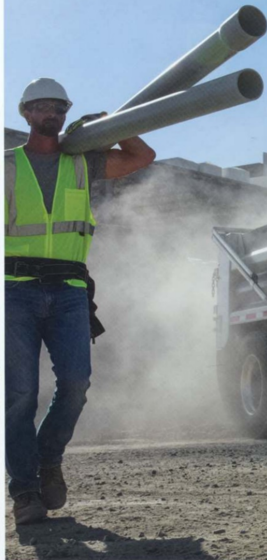
Shown: F-750 SuperCab with 6.7L Power Stroke, and available and aftermarket upfit equipment.