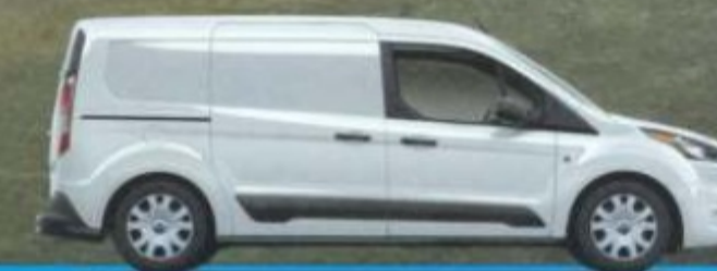
CARGO VAN | LWB