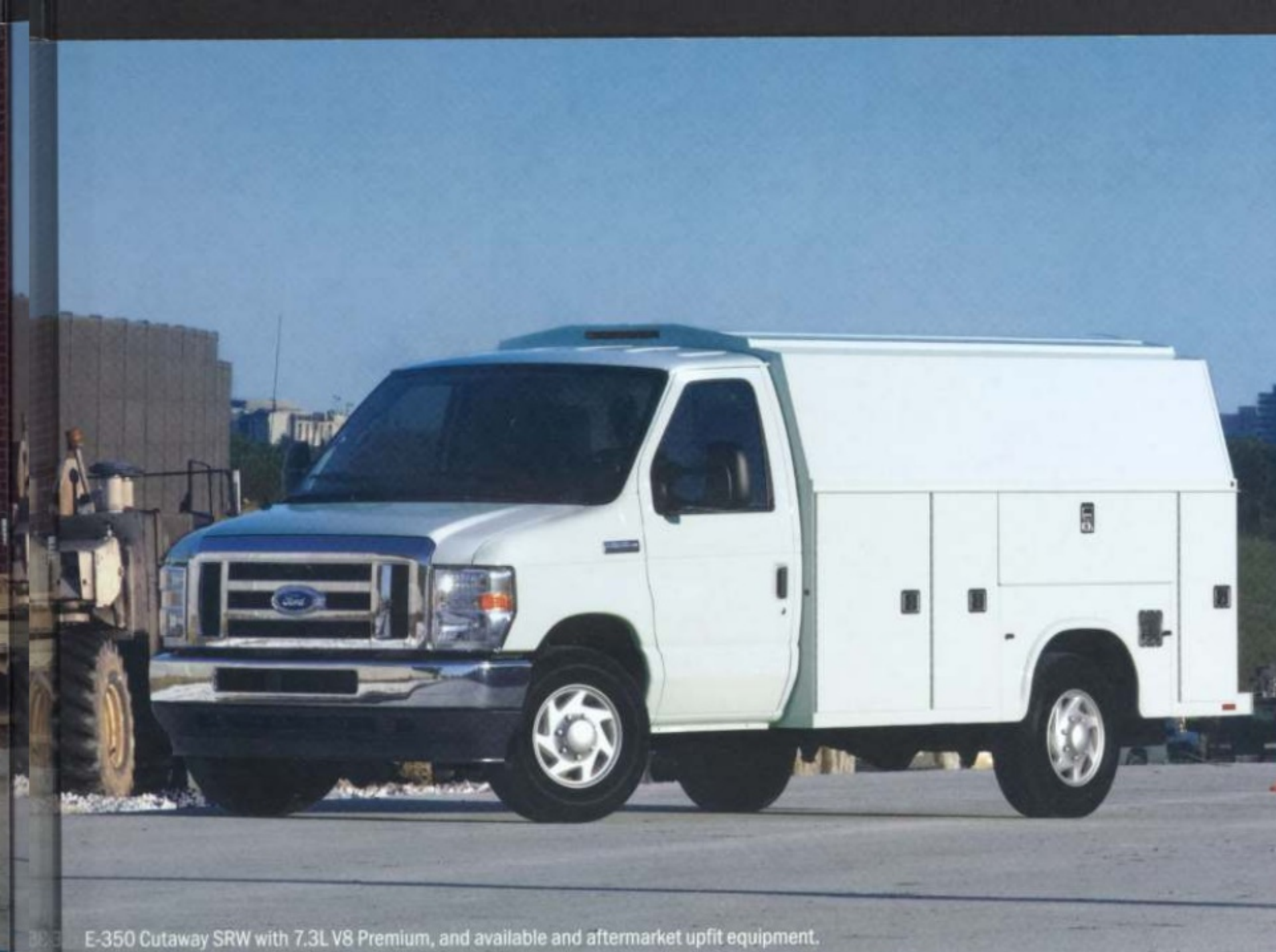
E-350 Cutaway SRW with 7.3L V8 Premium, and available and aftermarket upfit equipment.

SYNC® 3 with Apple CarPlay® and Android Auto™ compatibility 6