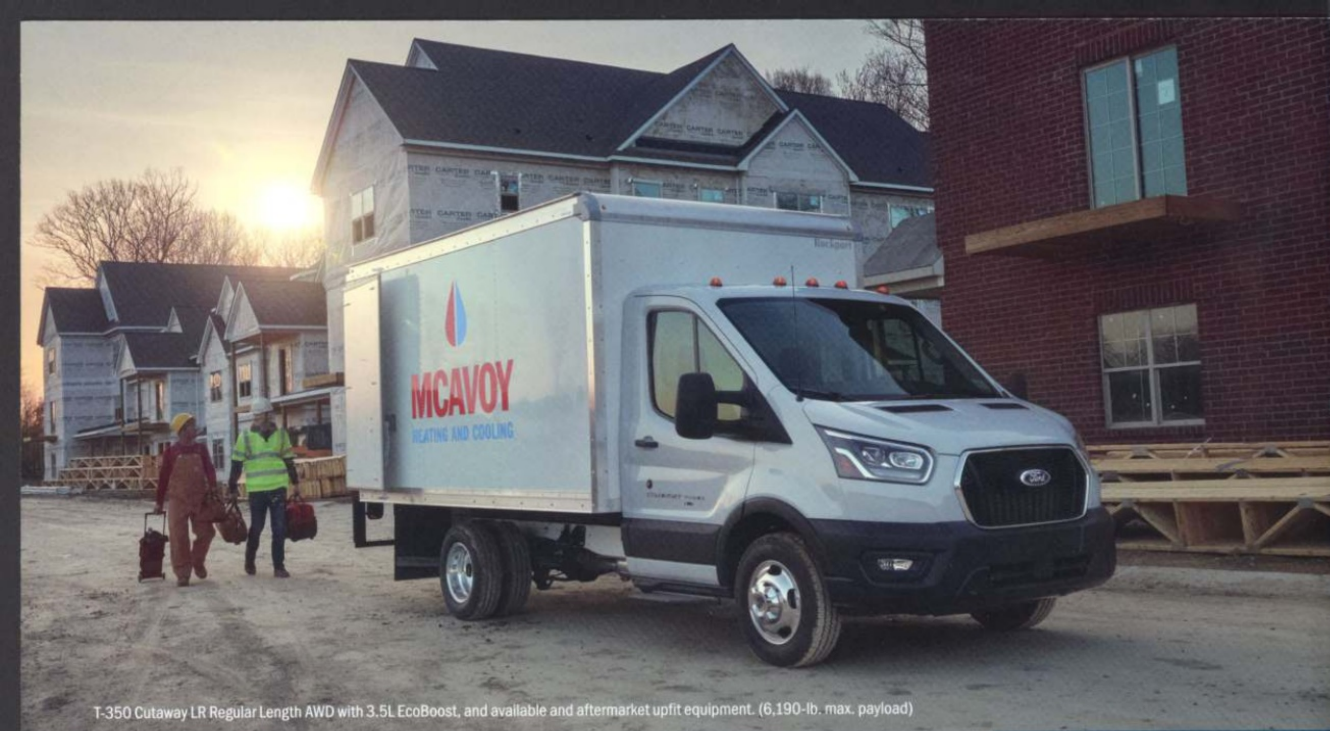
T-350 Cutaway LR Regular Length AWD with 3.5L EcoBoost, and available and aftermarket upfit equipment. (6,190-lb. max. payload)