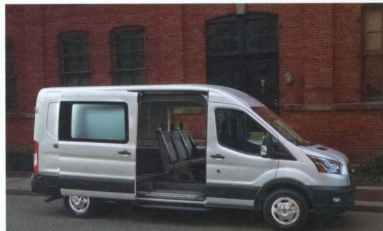
T-250 Crew Van MR Long Length with 3.5L EcoBoost and available equipment.