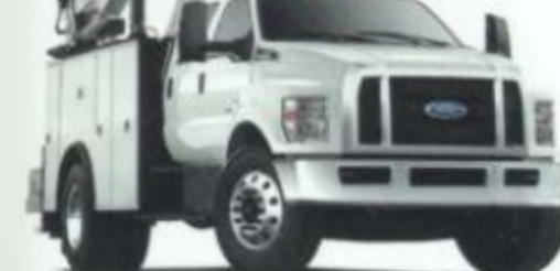
2021 F-650/F-750 SUPER DUTY

TorqShift 10-speed SelectShift automatic with Selectable Drive Modes