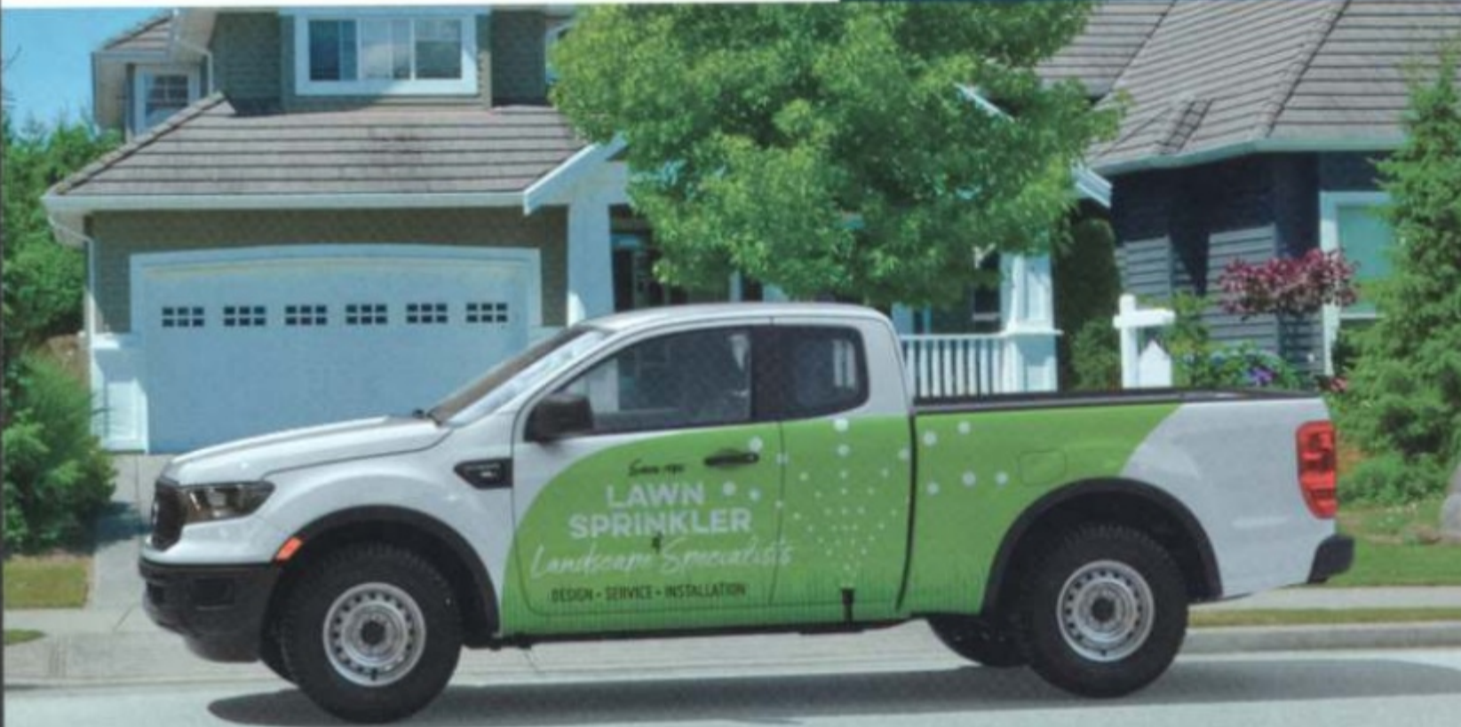
Ranger XL SuperCab 4x2. (1,860-lb. max. payload)

Ford Telematics™ and Data Services Prep (standard; Fleet only) Ford Co-Pilot360™ Technology Pickup box delete (XL 4x2)