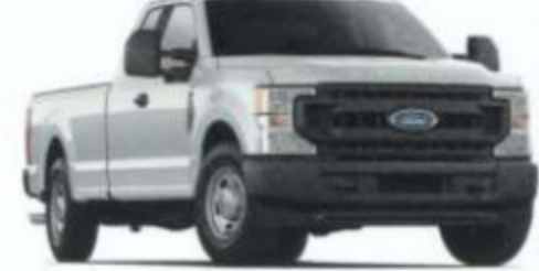
2020 SUPER DUTY ® PICKUP

10-speed SelectShift automatic with progressive range select, and 5 Selectable Drive Modes