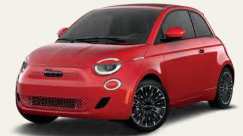
Red by (RED)