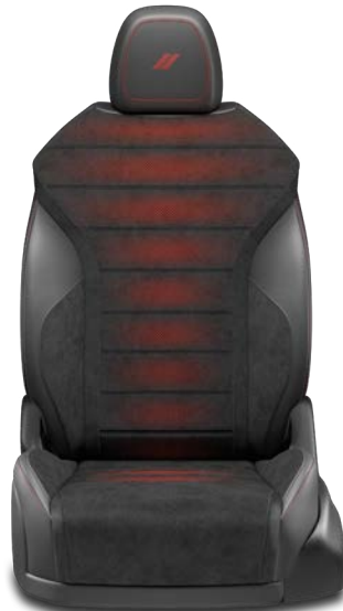
Perforated Alcantara® with Red Backing and Black Scuba Shark Bolsters with Red Accent Stitching (Included with Track Pack in Black)