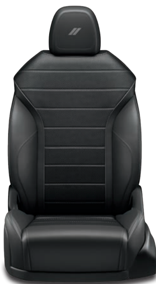
Perforated Leather Trim with Embroidered Dodge Logo and Black Stitching (Standard in Black)