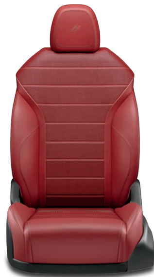
Perforated Leather Trim with Embroidered Dodge Logo and Red Stitching (Available in Red)