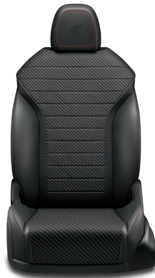
Cloth/Leatherette with Red Accent Stitching (Standard in Black)