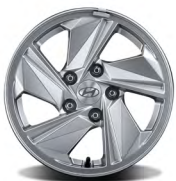
15" aluminum alloy wheels Standard on Essential model