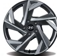
17" aluminum alloy wheels Standard on Preferred with Tech package and Luxury models