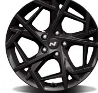
18" aluminum alloy wheels Standard on N Line Ultimate model