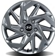
16" aluminum alloy wheels Standard on Preferred model