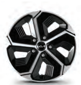
LX & EX 16" alloy wheels