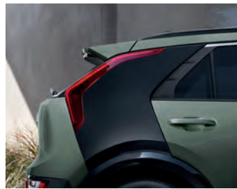
Cityscape Green with Gloss Black C-Pillar**

* Not available on LX models. ** Only available on SX models. Some seating, paint and trim configurations may be limited. Visit kia.ca for full details.