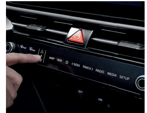
Infotainment/climate switchable controller share the same LCD softkey keyboard*