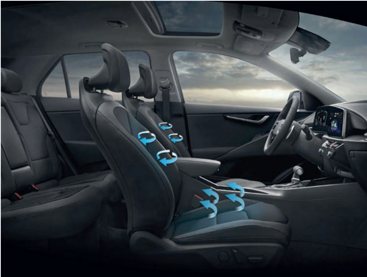
The heated front seats are also available with air cooling and a convenient driver's seat memory function*