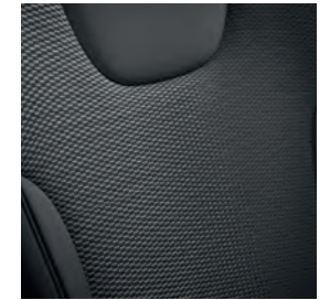
Charcoal cloth and synthetic leather combination