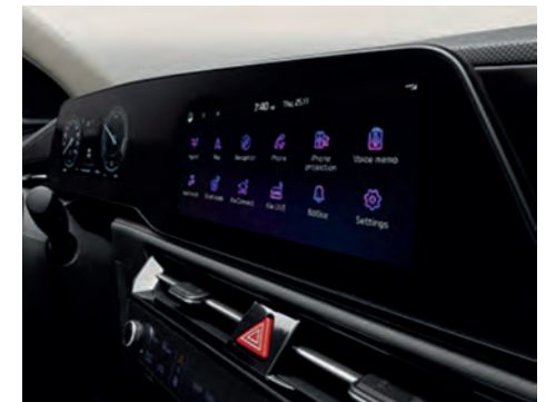
A 10.25" multimedia interface gives you at-a-glance control of navigation, audio and various vehicle system functions*