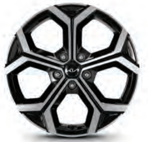
SX 18" alloy wheels