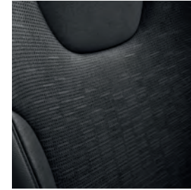
Charcoal synthetic leather