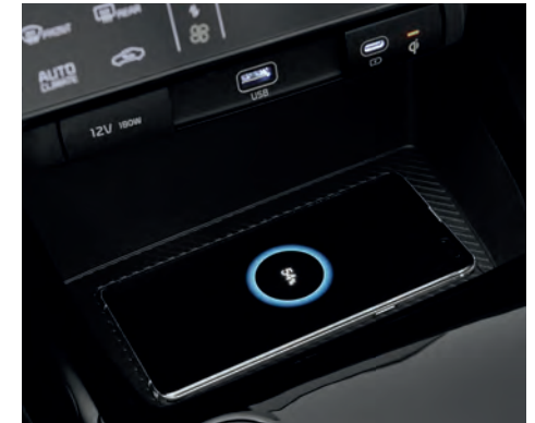
Charge your smartphone by simply placing it on the wireless charging tray*