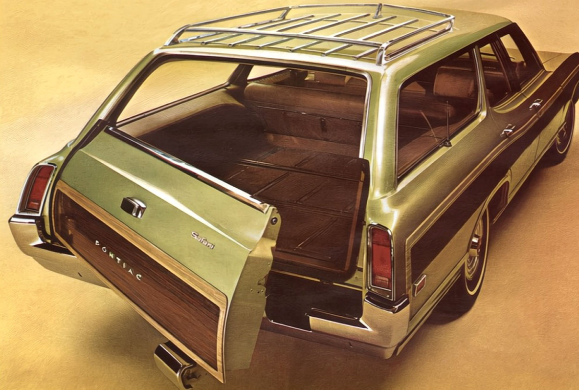
(Power antenna shown is optional, extra-cost equipment.)

THE EXECUTIVE SAFARI. On its 122" wheelbase, this one combines all the utility a station wagon can offer, with all the style and performance you expect in a Pontiac. Standard Equipment includes: 400-cubic-inch V-8 • dual hinged swing gate • built-in, full-width rear step • dark walnut-grain appearance exterior paneling with light-toned, teak-grain molding trim • "Pulse" windshield wiper system • power-operated tailgate window • upper-level ventilation system • vinyl floor covering and concealed locker in cargo area.