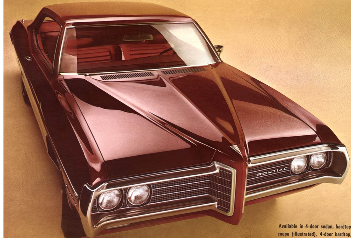
(Power antenna shown is optional, extra-cost equipment.)

THE CATALINA. Know a way to get Pontiac's coveted performance and gracious luxury "on a budget"? You're looking at the answer. This year, on a longer 122" wheelbase and a wider, Wide-Track front tread. Standard Equipment includes: 400-cubic-inch V-8 • full nylon-blend, loop-pile carpeting • synchronized, 3-speed manual transmission, column shift • peripheral front bumper with "Endura" center insert • "Pulse" windshield wiper system with concealed, articulated overlap wipers • foam-padded front seat cushion • upper-level ventilation system.