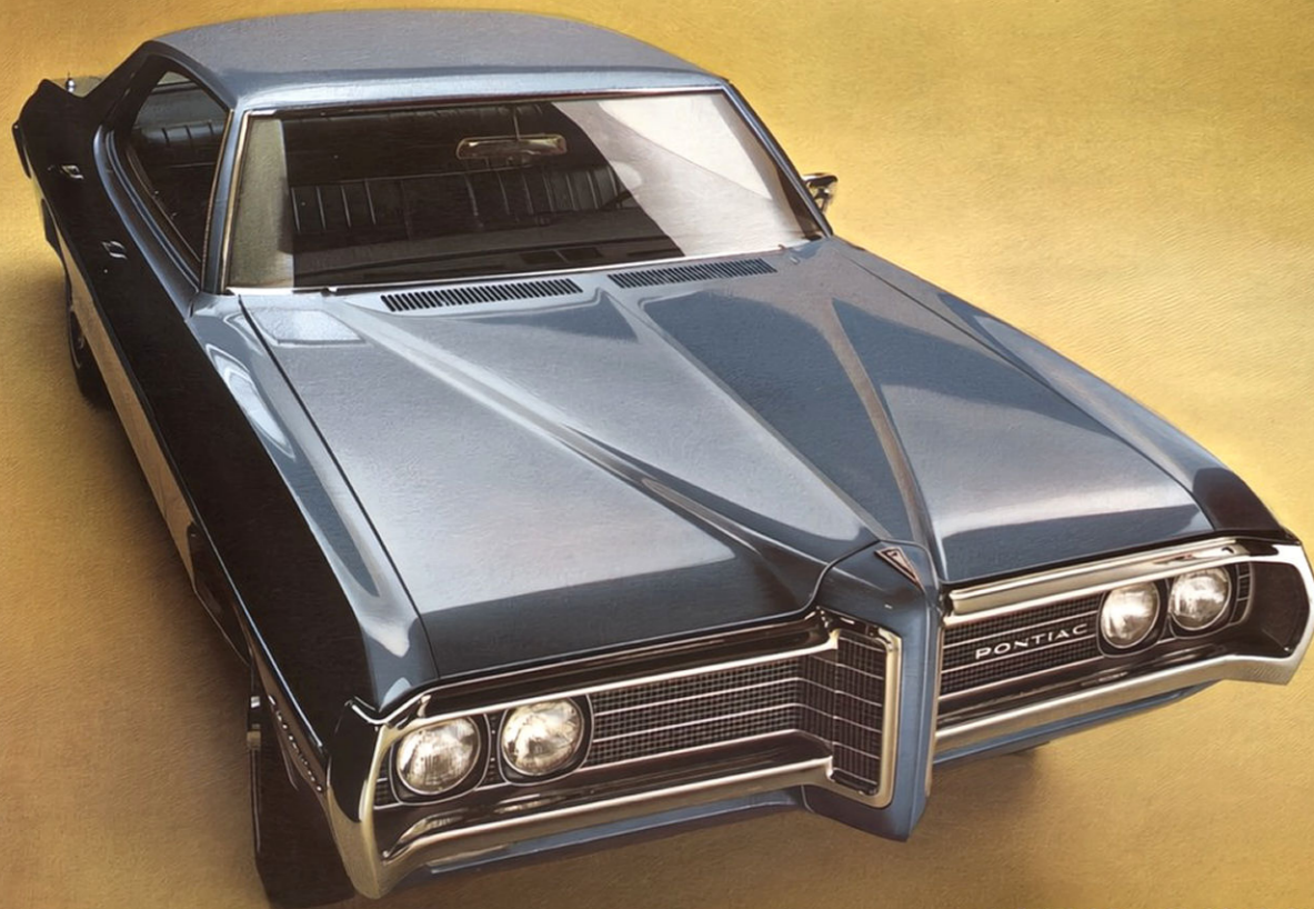
Available in 4-door sedan, 4-door hardtop (illustrated) and hardtop coupe models.

THE EXECUTIVE. This appropriately named member of the Wide-Track family is distinguished by its commanding road manners, its decisive styling and its longer 125" wheelbase. Standard Equipment includes: 400-cubic-inch V-8 • deluxe wheel covers and 3-spoke, vinyl-cushioned rim steering wheel • upper-level ventilation system • elm burl-grain appearance instrument panel • "Pulse" windshield wiper system • all-expanded Morrokide interiors • foam-padded rear seat cushion • "Endura" center insert in peripheral front bumper.