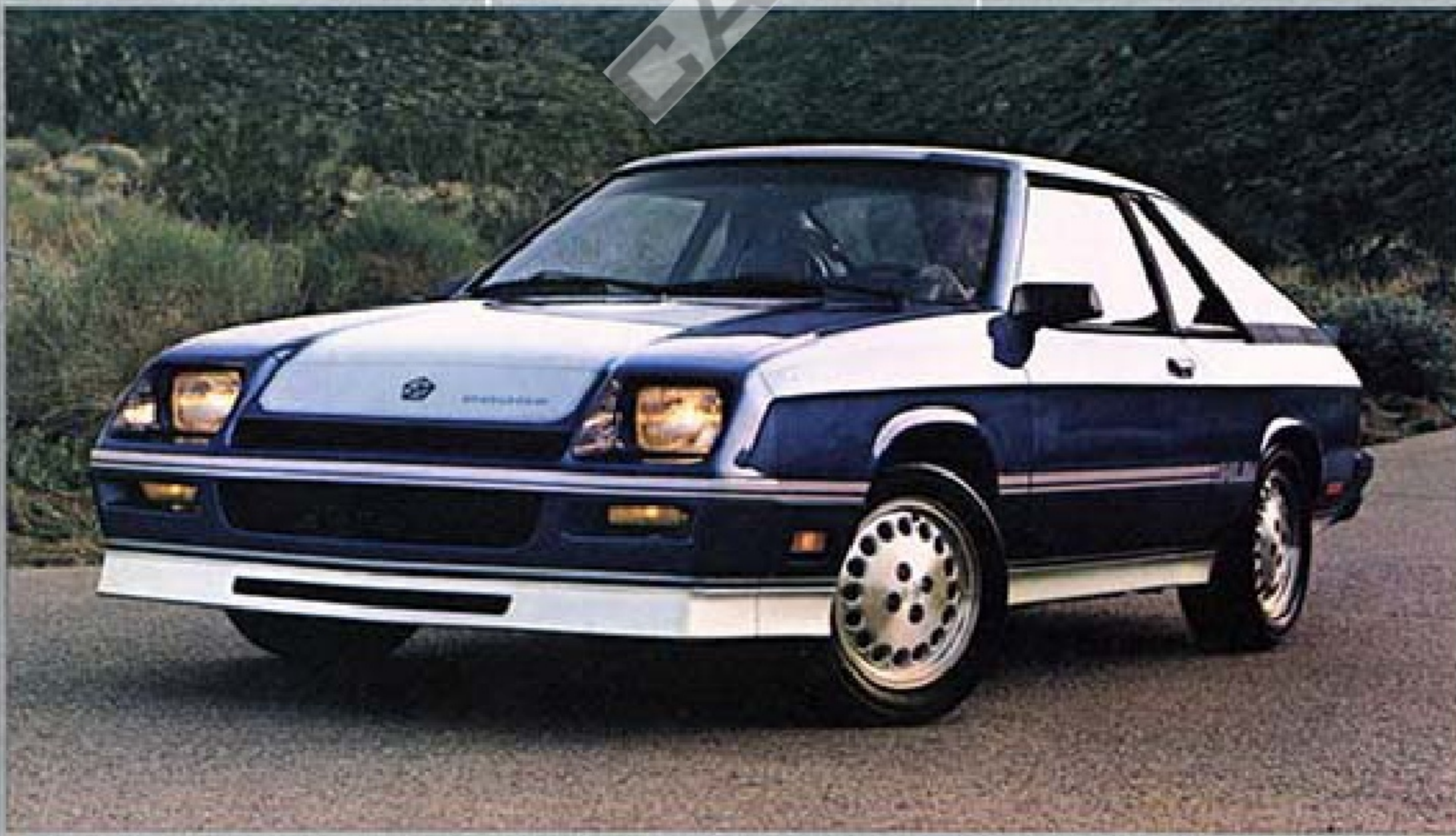
Dodge Shelby Charger, shown in Santa Fe Blue paint/Radiant Silver paint and graphics.

*Use EPA EST MPG numbers for comparison. Your mileage may differ depending upon speed, weather and trip length. Actual highway mileage will probably be lower than highway estimate.