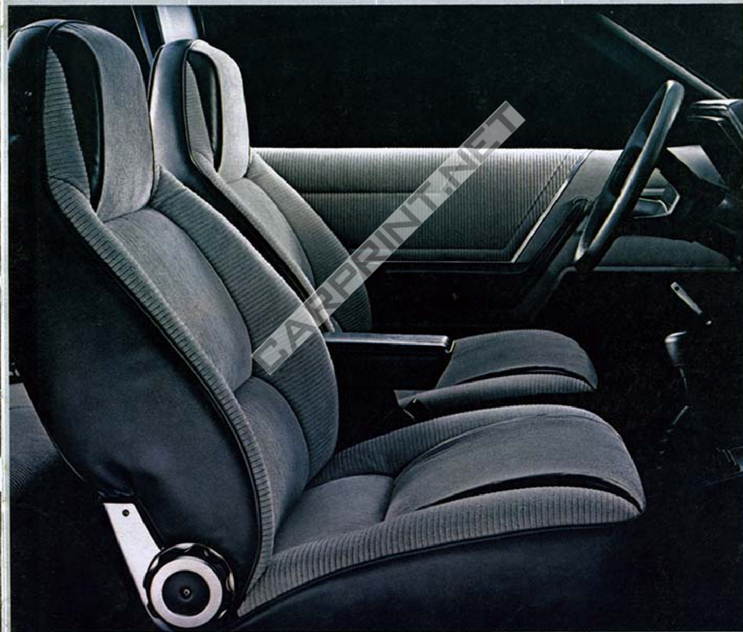
Charger's optional high-back bucket seat interior shown in Charcoal/Silver.

We're talking a driver-oriented interior. And a well-executed one at that.