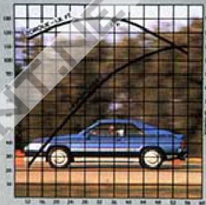
profile and the ability to attack

Finally, he added 15-inch cast aluminum wheels and low profile series 50 Eagle GT speed-rated radial tires that contribute to a 6-inch lower