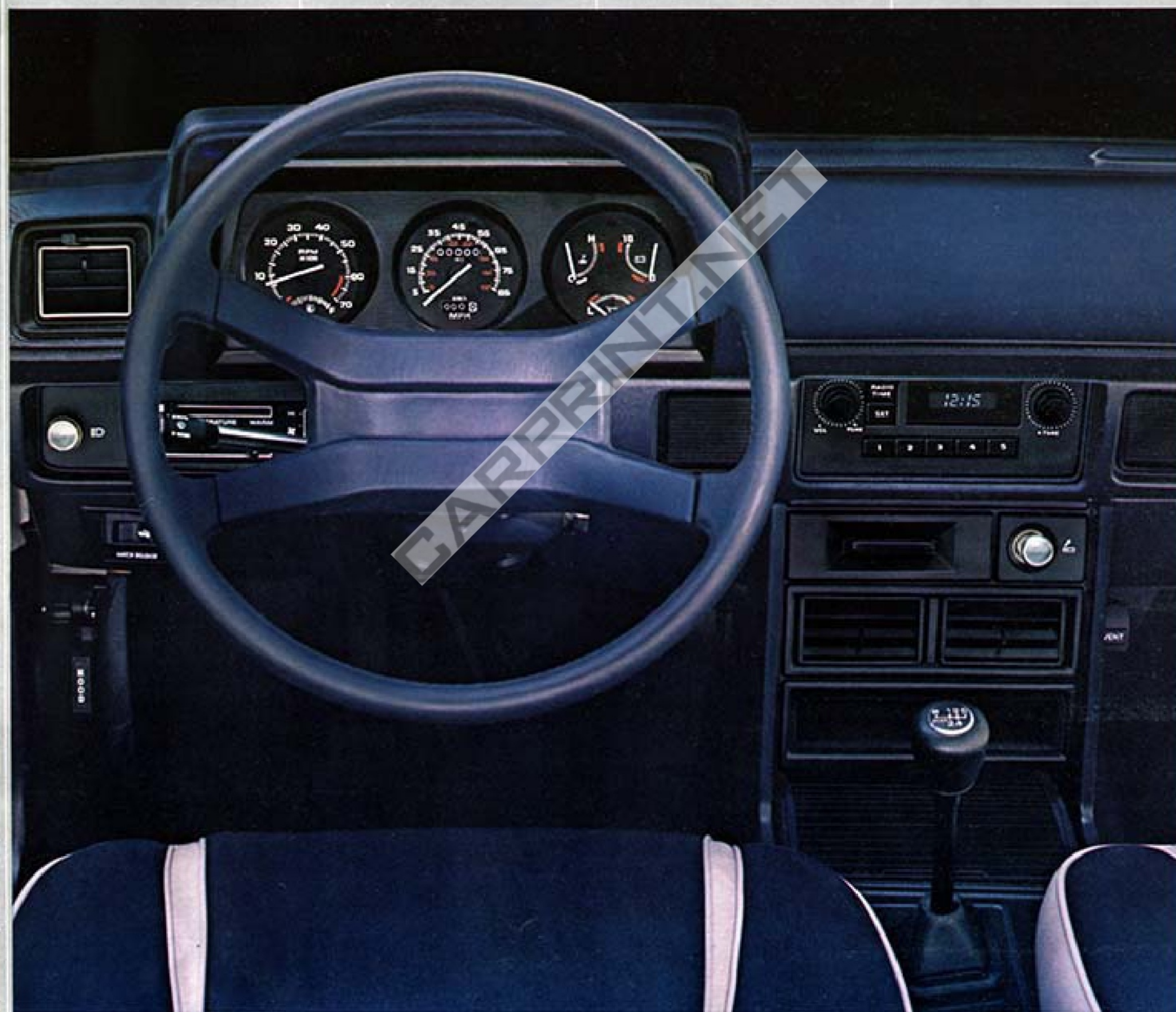
The Shelby Charger's driver-oriented instrument panel, featuring new full gauge Rallye cluster.