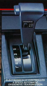
ELECTRONICALLY CONTROLLED 4-SPEED AUTOMATIC OVERRIDE TRANSMISSION

OUTSTANDING OPTIONS Options include two-tone paint and a power sunroof. An Electronically Controlled 4-speed automatic override transmission is standard on the L-Type, optional on the Supra. An easy-to-read Electronic Display Instrument Panel also includes a useful Trip Computer.