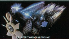
2.8 LITER TWIN CAM ENGINE

All the details add up to excitement. High performance, race-proven drivetrain, and sleek styling make Supra the most exhilarating example of what a true high-excitement GT can be.