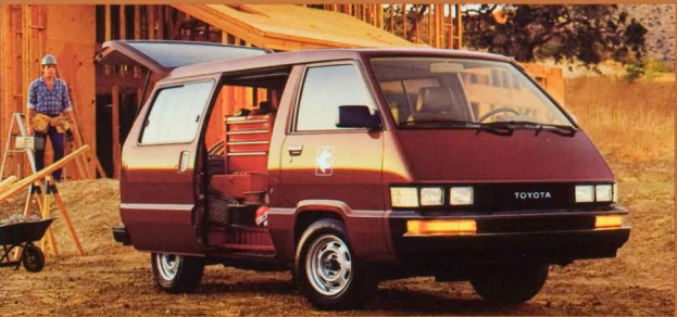
2WD Window Van (Shown in Garnet Red Metallic)