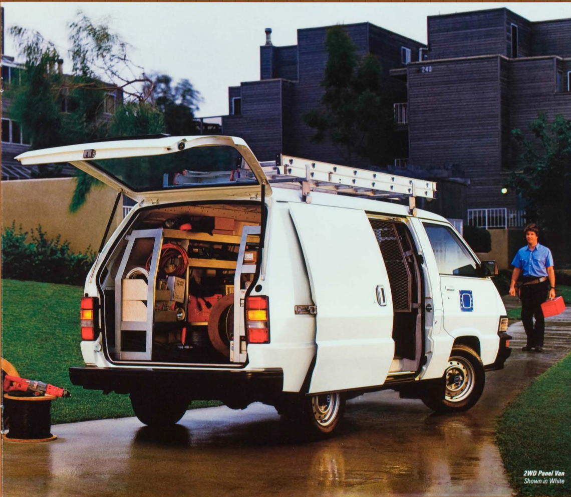
2WD Panel Van Shown in White