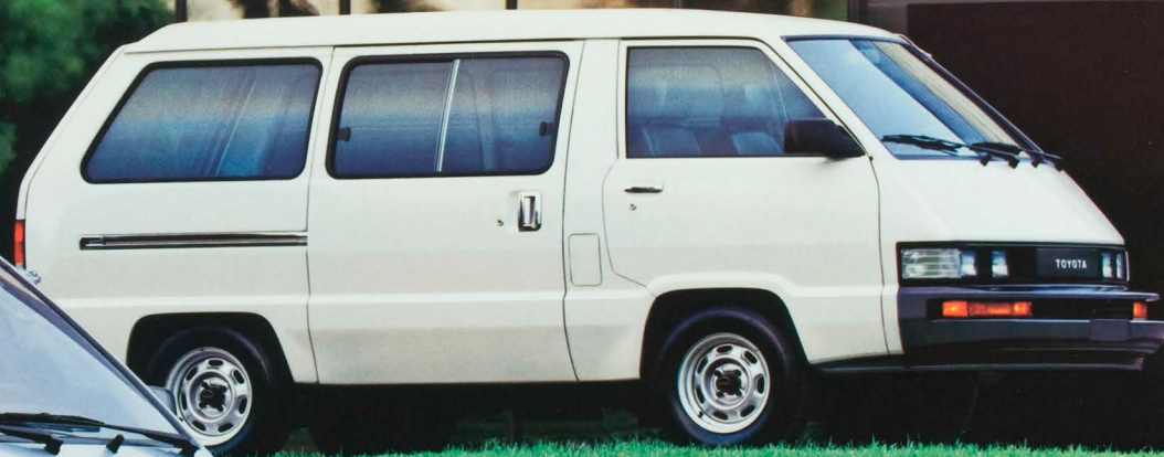
4WD Panel Van and 2WD Window Van Shown in Silver Metallic and in White