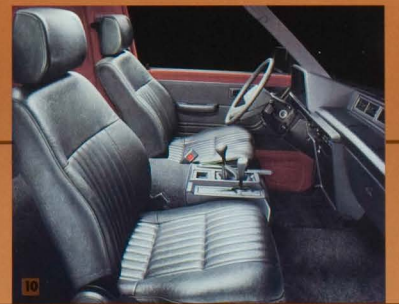
Shown with optional equipment.