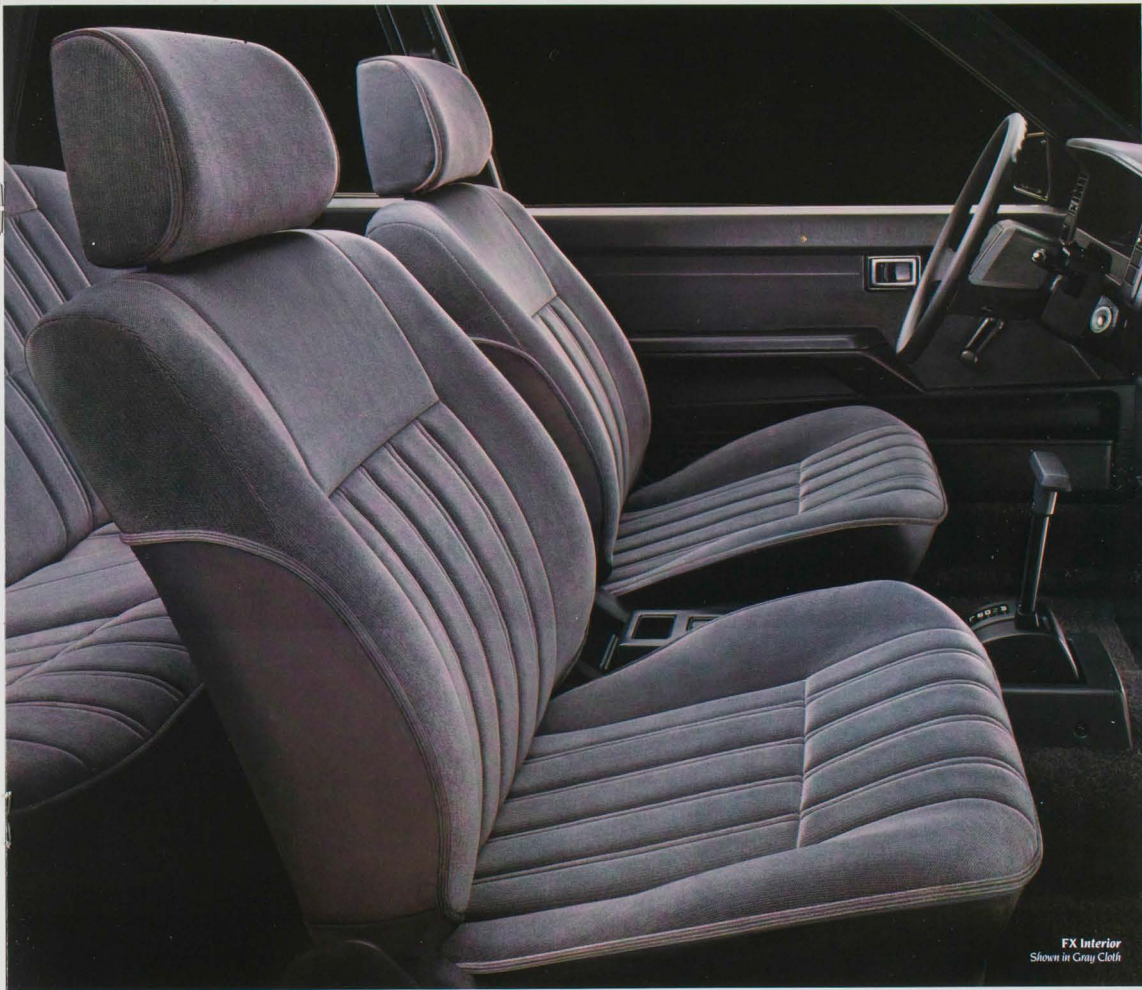
FX Interior Shown in Gray Cloth