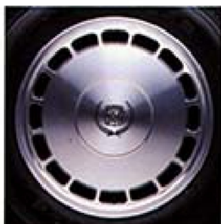
Standard 16" x 7" Cadillac-exclusive diamond-finish forged aluminum alloy wheel.