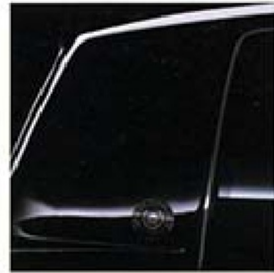
Distinctive sail panel identification.