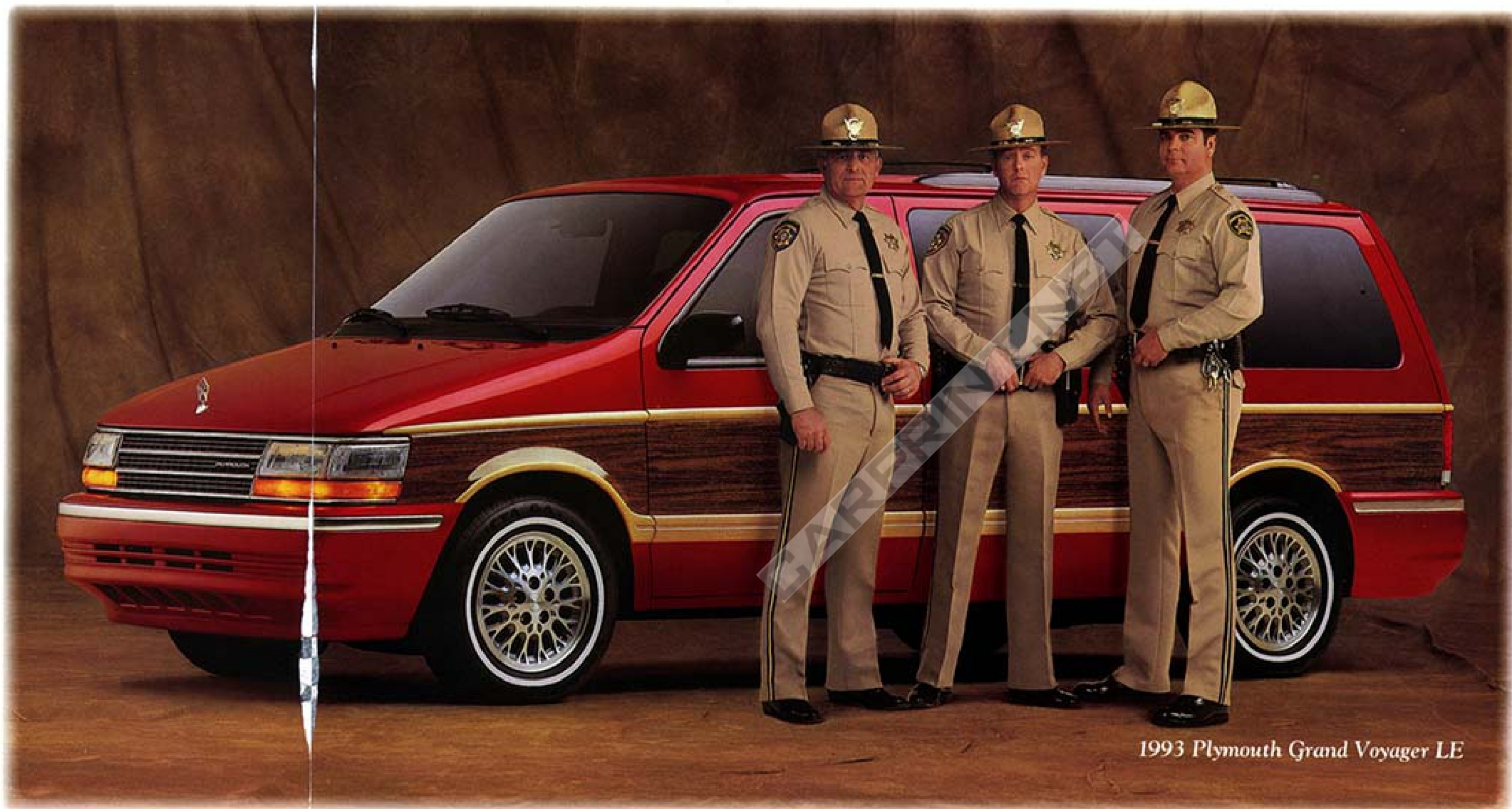
1993 Plymouth Grand Voyager LE