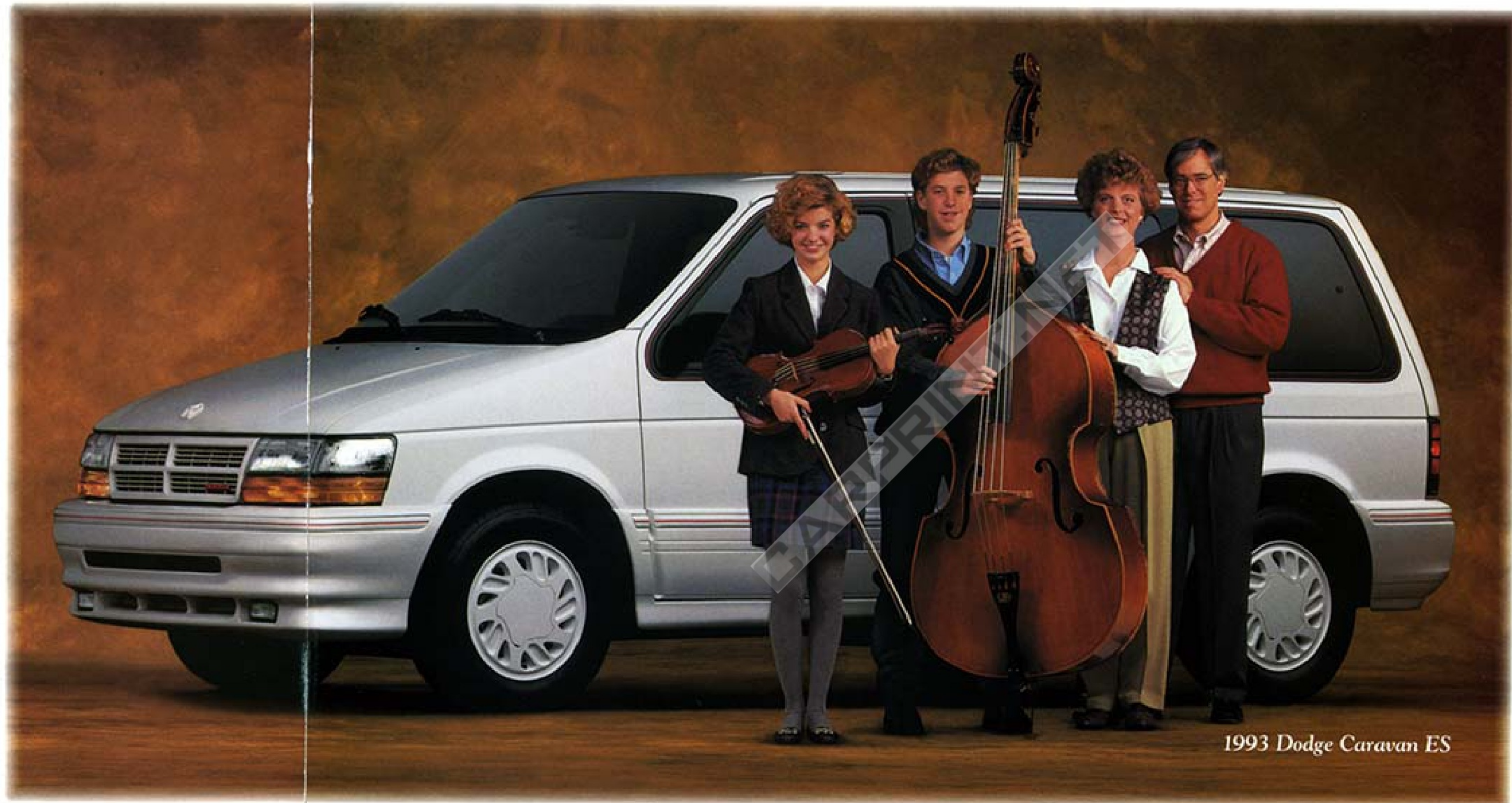
1993 Dodge Caravan ES