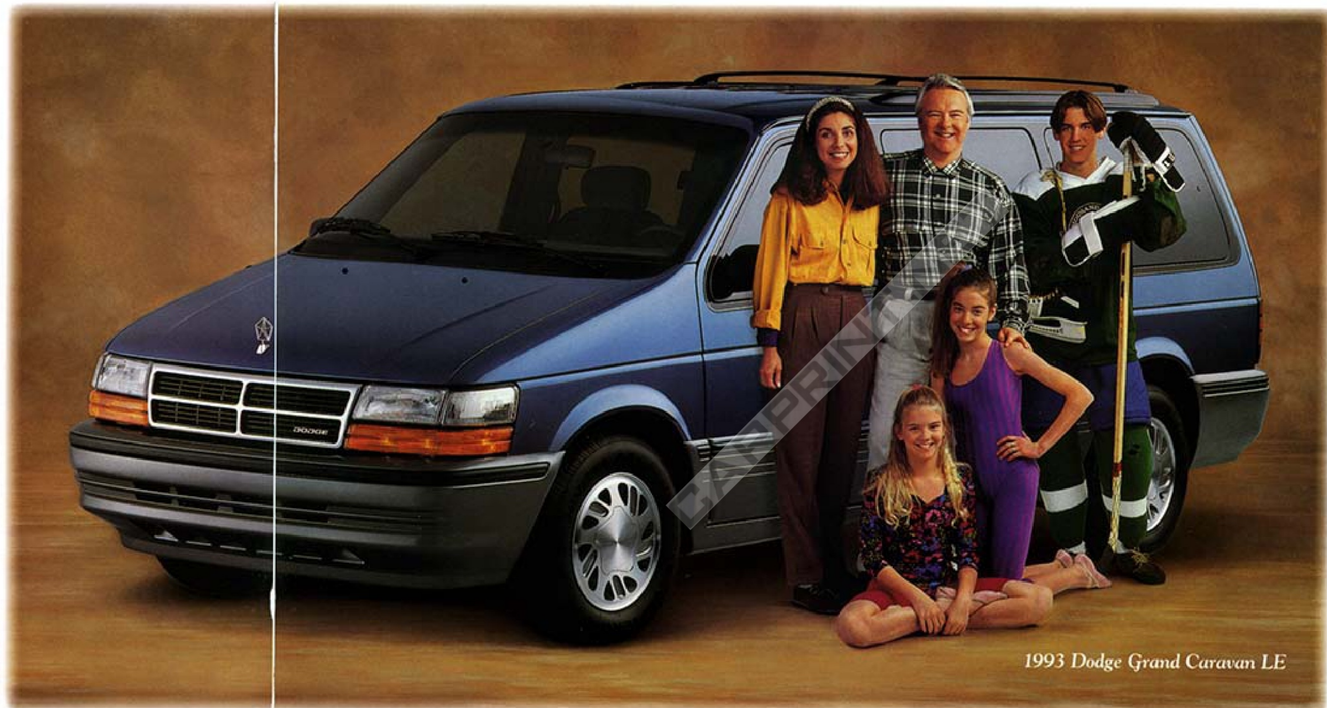
1993 Dodge Grand Caravan LE