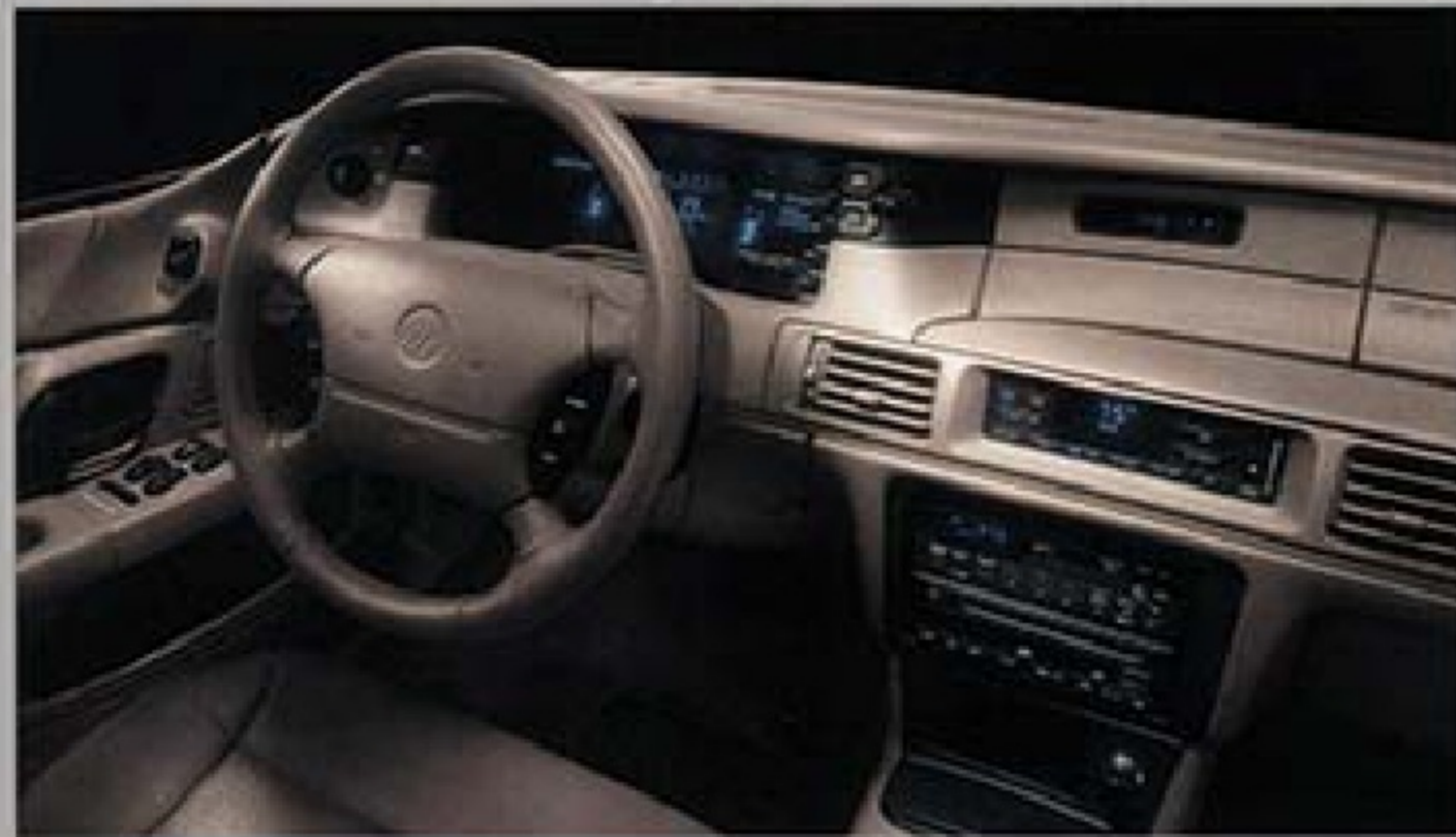
Interior shown in Mocha with leather seating surfaces.