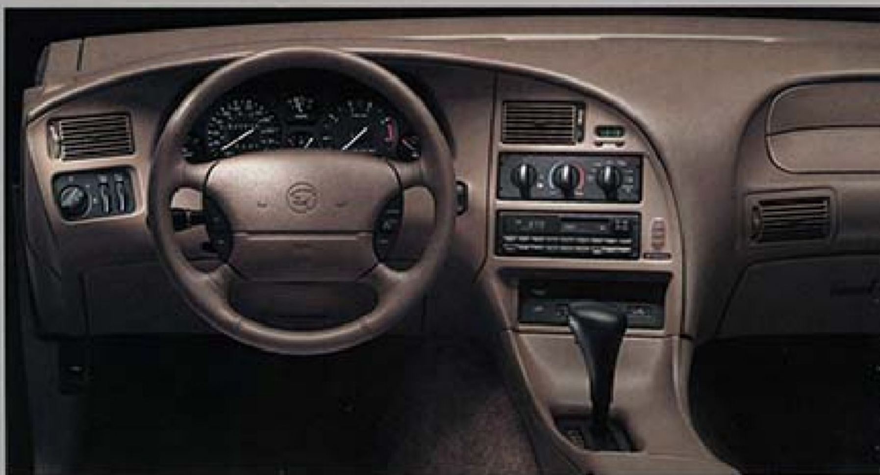
Some features shown may be optional.