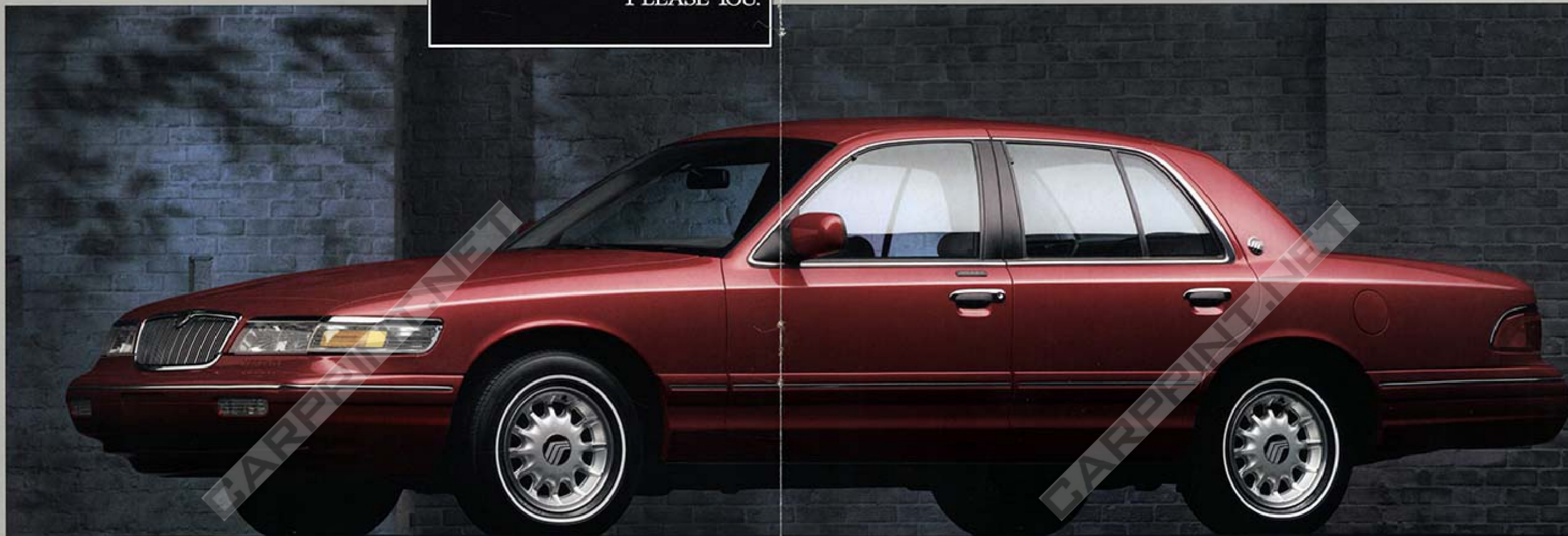
Grand Marquis LS shown in Electric Red Clearcoat Metallic.

body-on-frame construction contribute to its legendary ride. Numerous features such as dual air bags, available anti-lock brakes and speed-sensitive power steering make this a most impressive Grand Marquis.