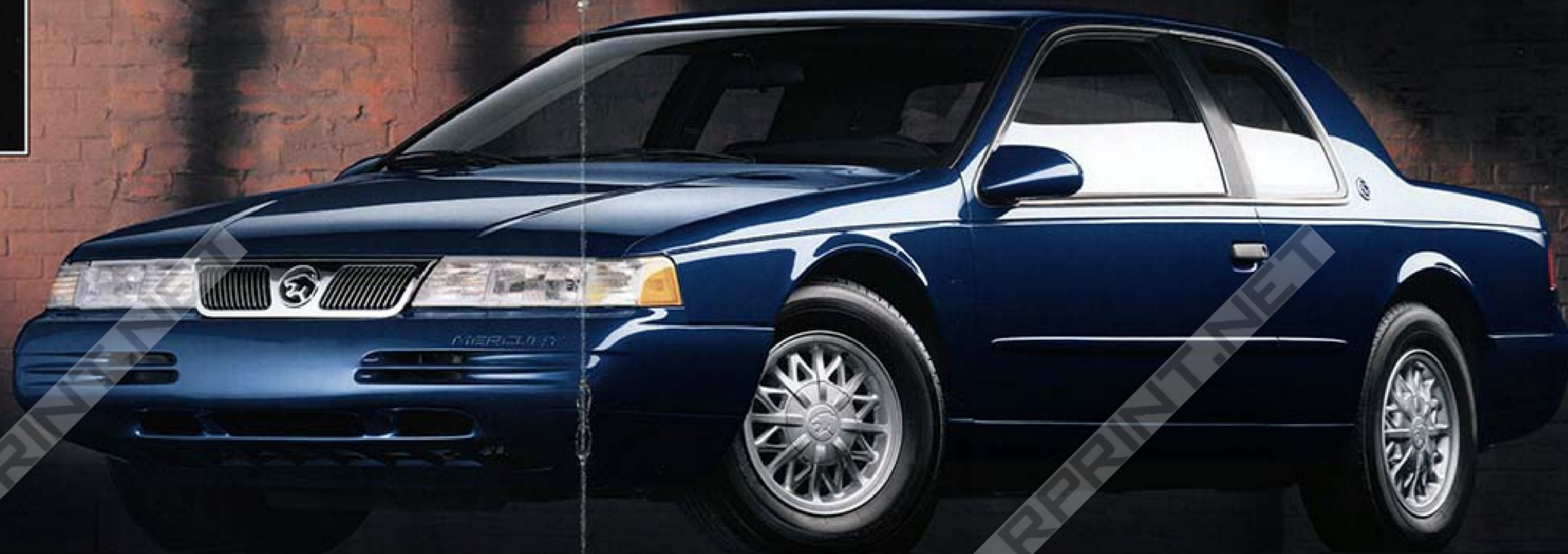
Exterior shown in Moonlight Blue Clearcoat Metallic.

In a world full of look-alike cars, there's one automobile that truly sets itself apart from the rest. Mercury Cougar XR7. Its distinctive profile, driver-focused interior and special emphasis on safety all contribute to its ability to turn heads. Like all Mercurys it comes remarkably well-equipped. And if looking at Cougar XR7 isn't moving enough, just wait until you take it out for a drive.