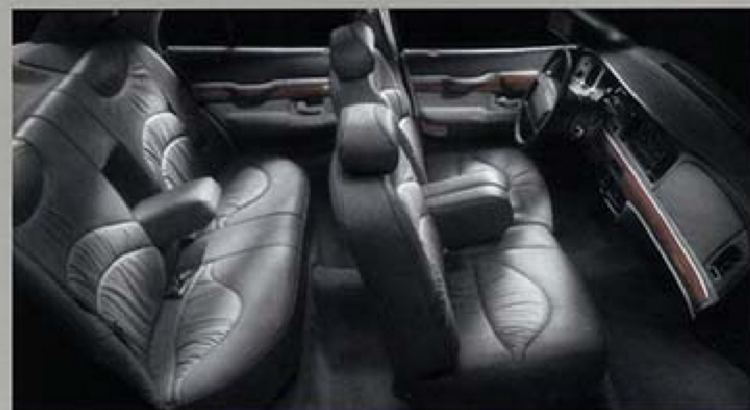
Interior shown in Light Graphite with available leather seating surfaces.