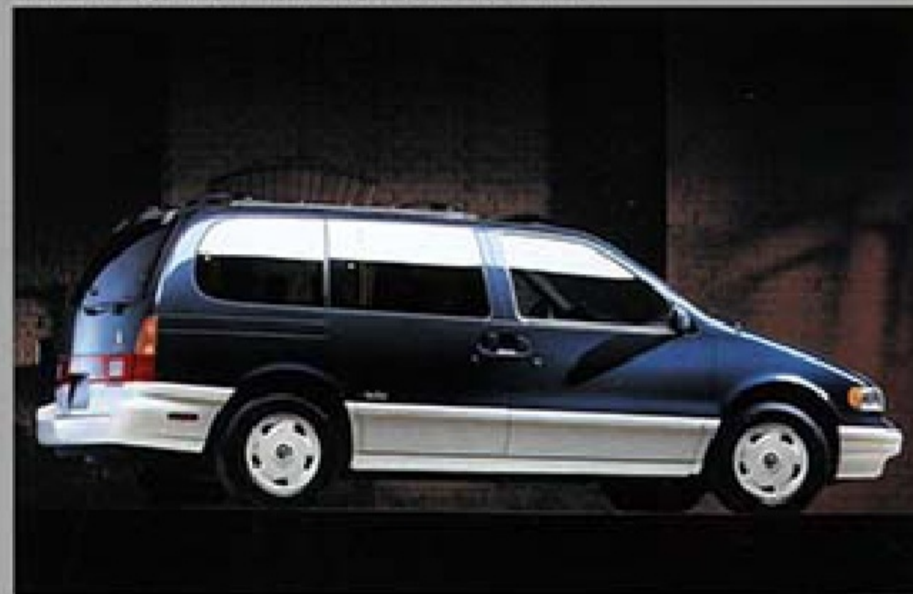
Nautica Villager shown in Eclipse Blue over Glacier White.