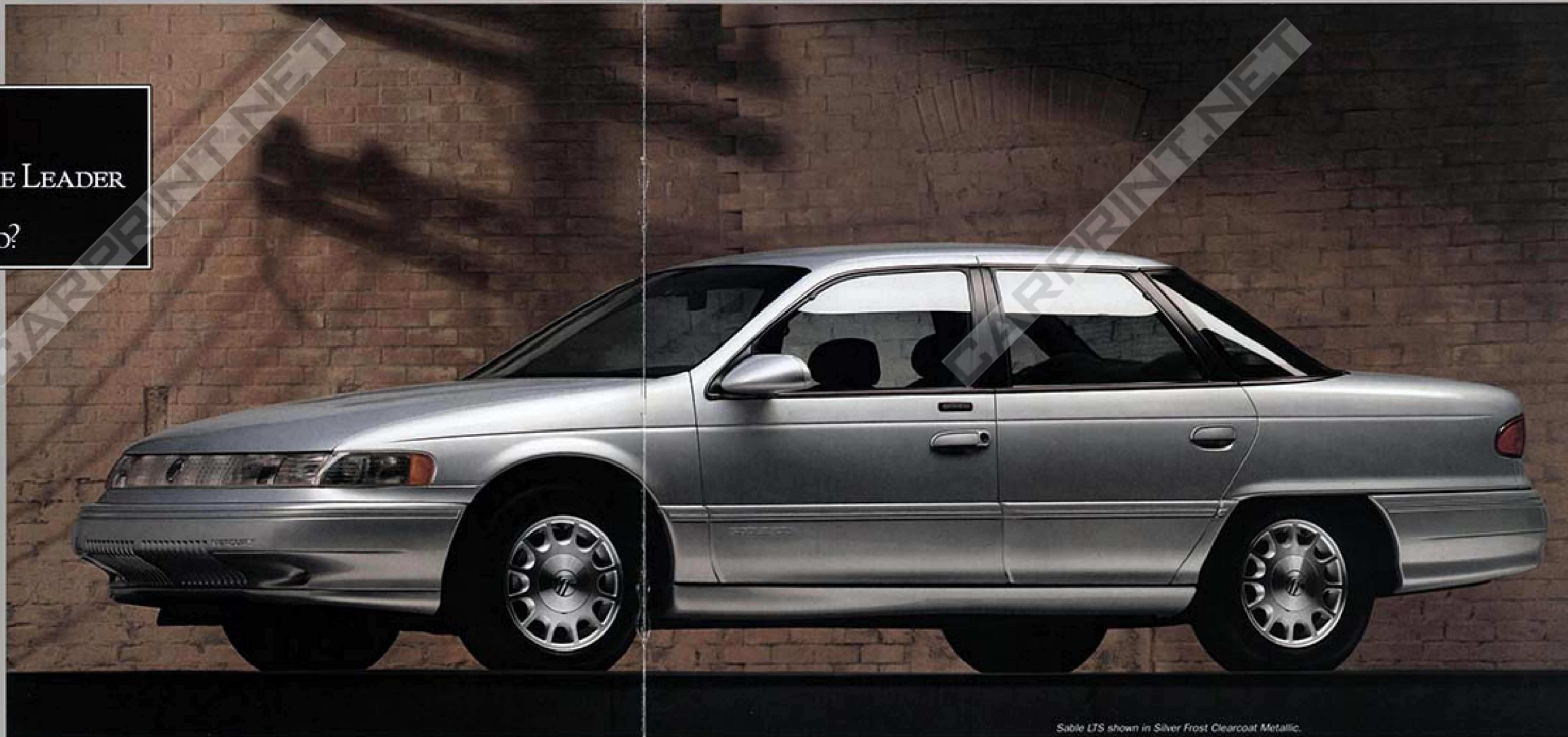
Sable LTS shown in Silver Frost Clearcoat Metallic.

Few cars have enjoyed the success of the Mercury Sable. Its design leadership has set standards for an entire generation of cars. Sable has established a reputation for exceptional value as well. And it's been at the forefront in safety technology, being the first car in its class to offer standard air bags and ABS brakes. In fact, it was the mid-size category winner of Prevention magazine's Safe Car Achievement Award. Furthermore, its powerful V-6 and many thoughtful features keep Sable at the top of its class.