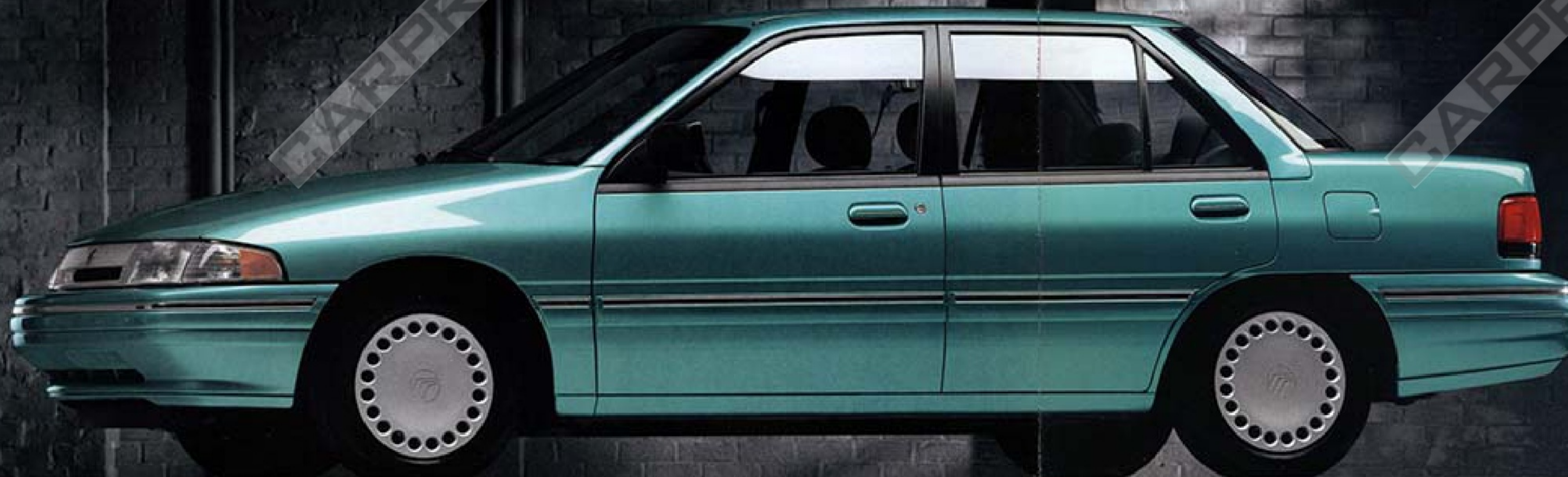
Tracer shown in Bright Calypso Green Clearcoat Metallic.

Tracer has been designed to be a well-equipped yet affordable car to drive. It offers the ride, features and comfort so many of today's small cars seem to be lacking. You'll find it sports one of the roomiest interiors in its class. And with a 60/40 split-fold rear seat, it's versatile enough to handle extra-long cargo. All in all, Mercury Tracer is the perfect solution for those who prefer a small car, but don't want to sacrifice anything to have one.