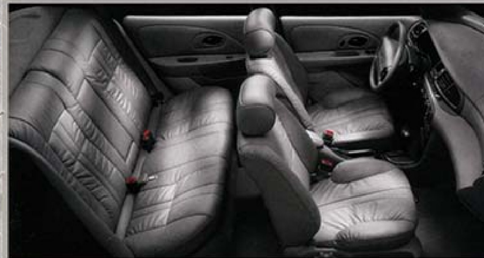
Some features shown may be optional.

MicronAir® is a registered U.S. trademark of Freudenberg Norwovens.