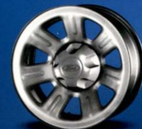
15" 7-Spoke Silver-Painted Steel