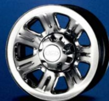
15" 7-Spoke Chrome-Clad Steel