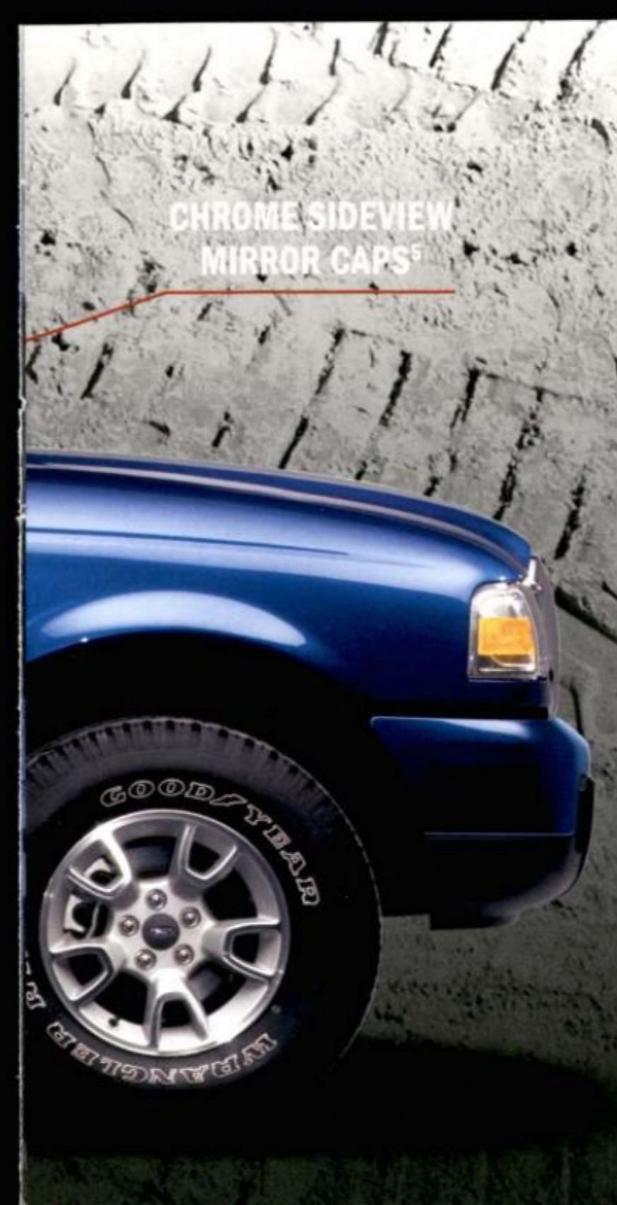
CHROME SIDEVIEW MIRROR CAPS 5

A 4-DOOR SUPERCAB gives rear passengers their own doors and jump seats. This optional cab style provides easy access, plus room to bring along a couple of friends or secure storage for your valuable gear.