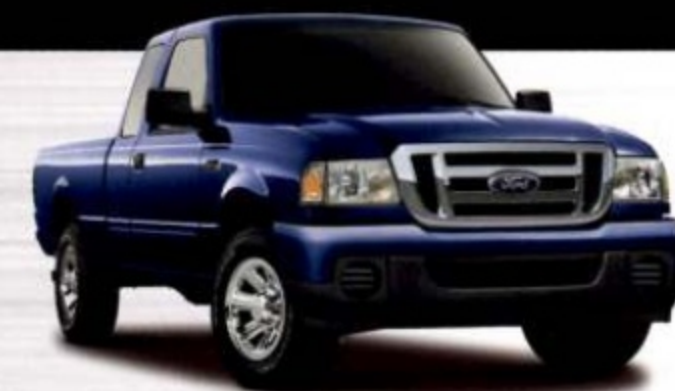
Vista Blue Metallic