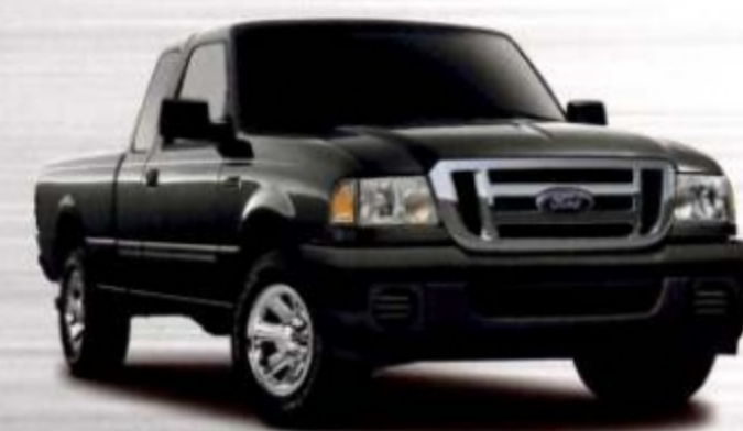
Dark Shadow Grey Metallic