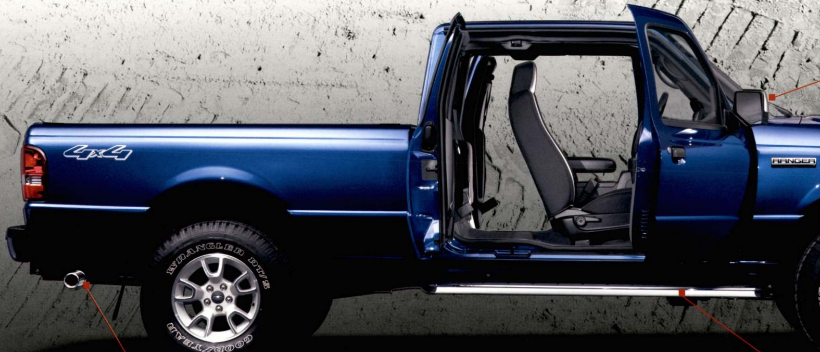
CHROME EXHAUST TIP