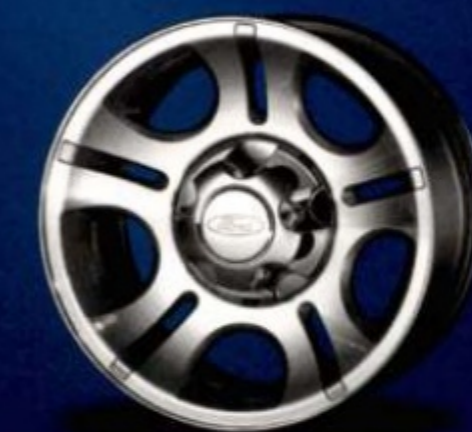
15" Split-Spoke Machined Cast-Aluminum