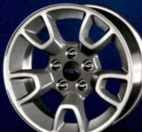
16" Y-Spoke Cast-Aluminum with Silver-Painted Insets