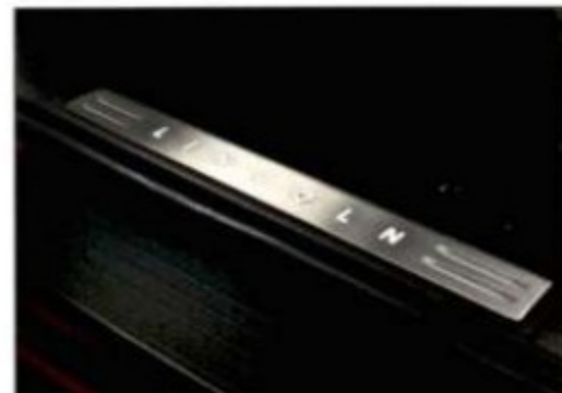
Front illuminated sill plates