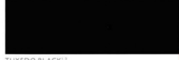
TUXEDO BLACK 1,2