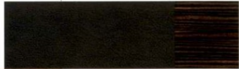
DARK CHARCOAL LEATHER WITH EBONY WOOD