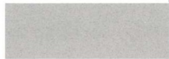
BRILLIANT SILVER 1,2