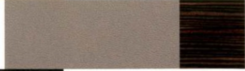
LIGHT STONE LEATHER WITH EBONY WOOD 3