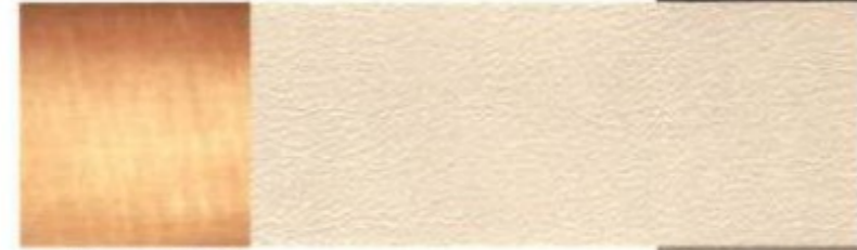
SAND LEATHER WITH FIGURED MAPLE WOOD