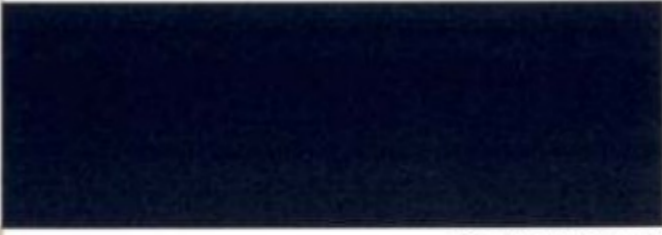
DARK INK BLUE