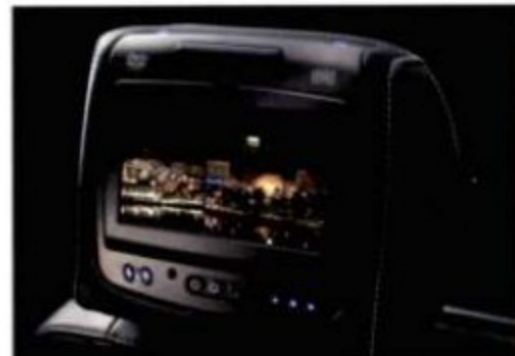
Dual INVISION ® DVD Headrests 2