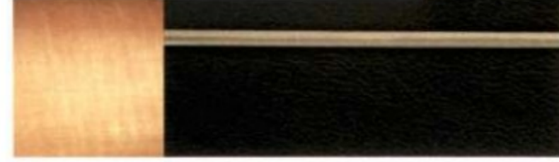
DARK CHARCOAL LEATHER WITH SAND PIPING AND FIGURED MAPLE WOOD 3