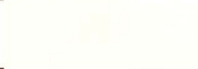
VIBRANT WHITE 1