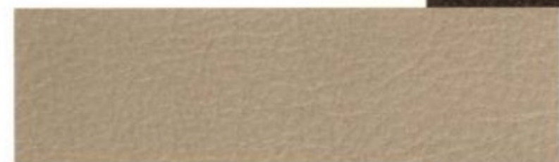
LIGHT CAMEL LEATHER