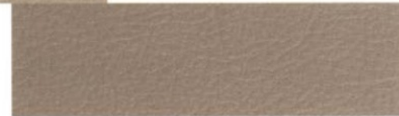
MEDIUM LIGHT STONE LEATHER