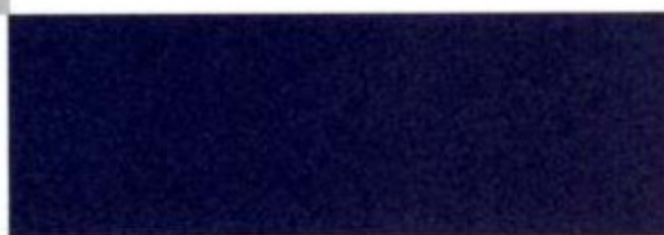
DARK BLUE PEARL