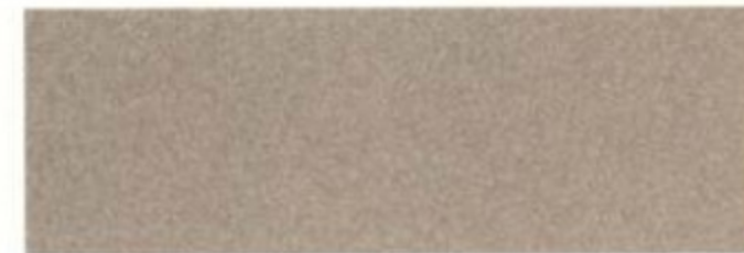
LIGHT FRENCH SILK