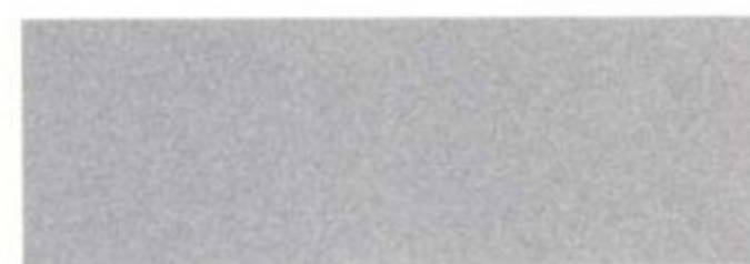
LIGHT ICE BLUE 1