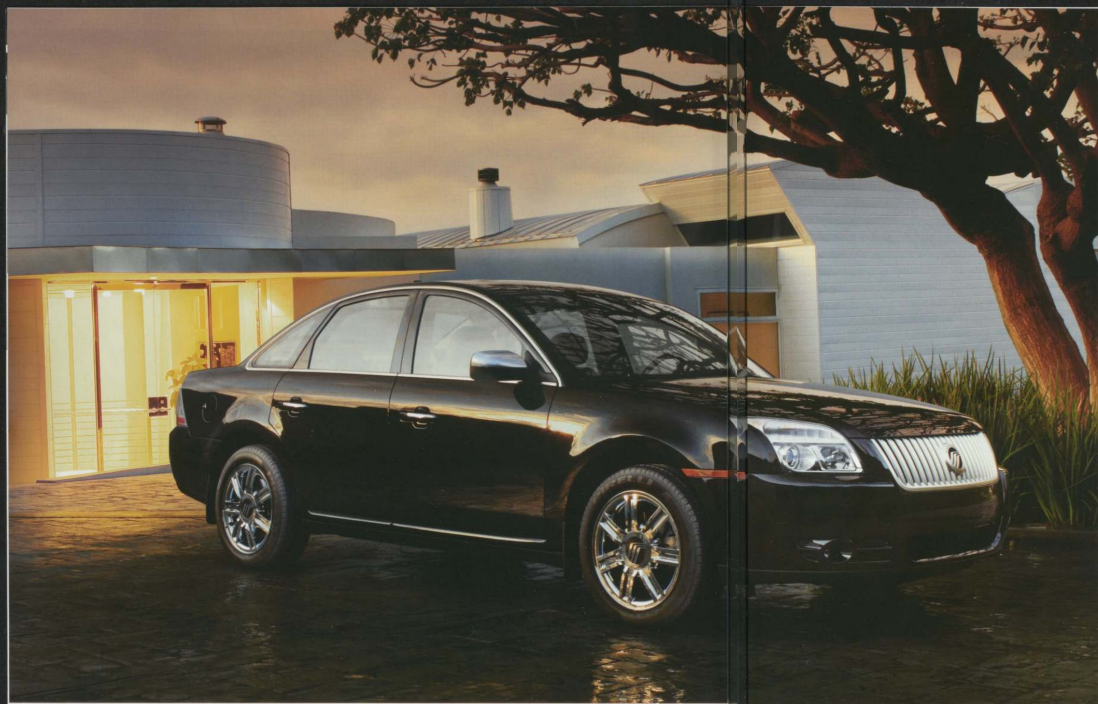
SABLE PREMIER IN TUXEDO BLACK METALLIC WITH AVAILABLE EQUIPMENT.