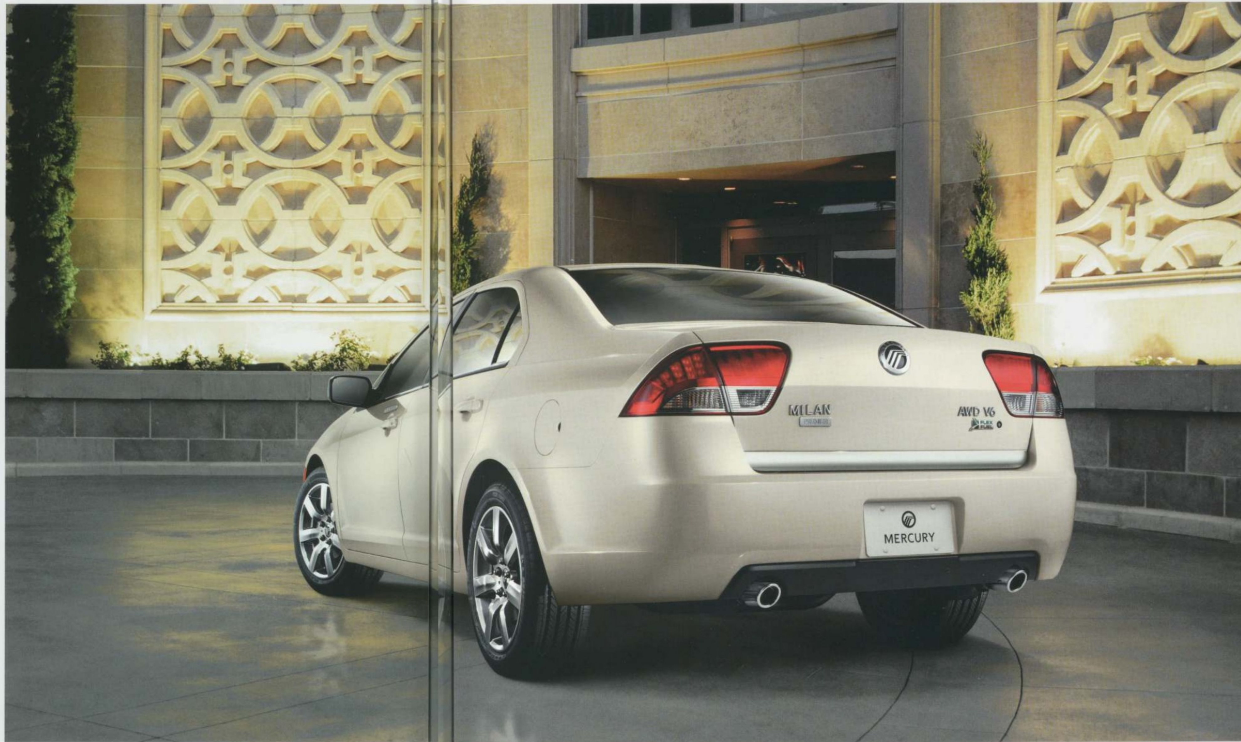
MILAN PREMIER V-6 IN WHITE PLATINUM TRI-COAT METALLIC WITH AVAILABLE EQUIPMENT.