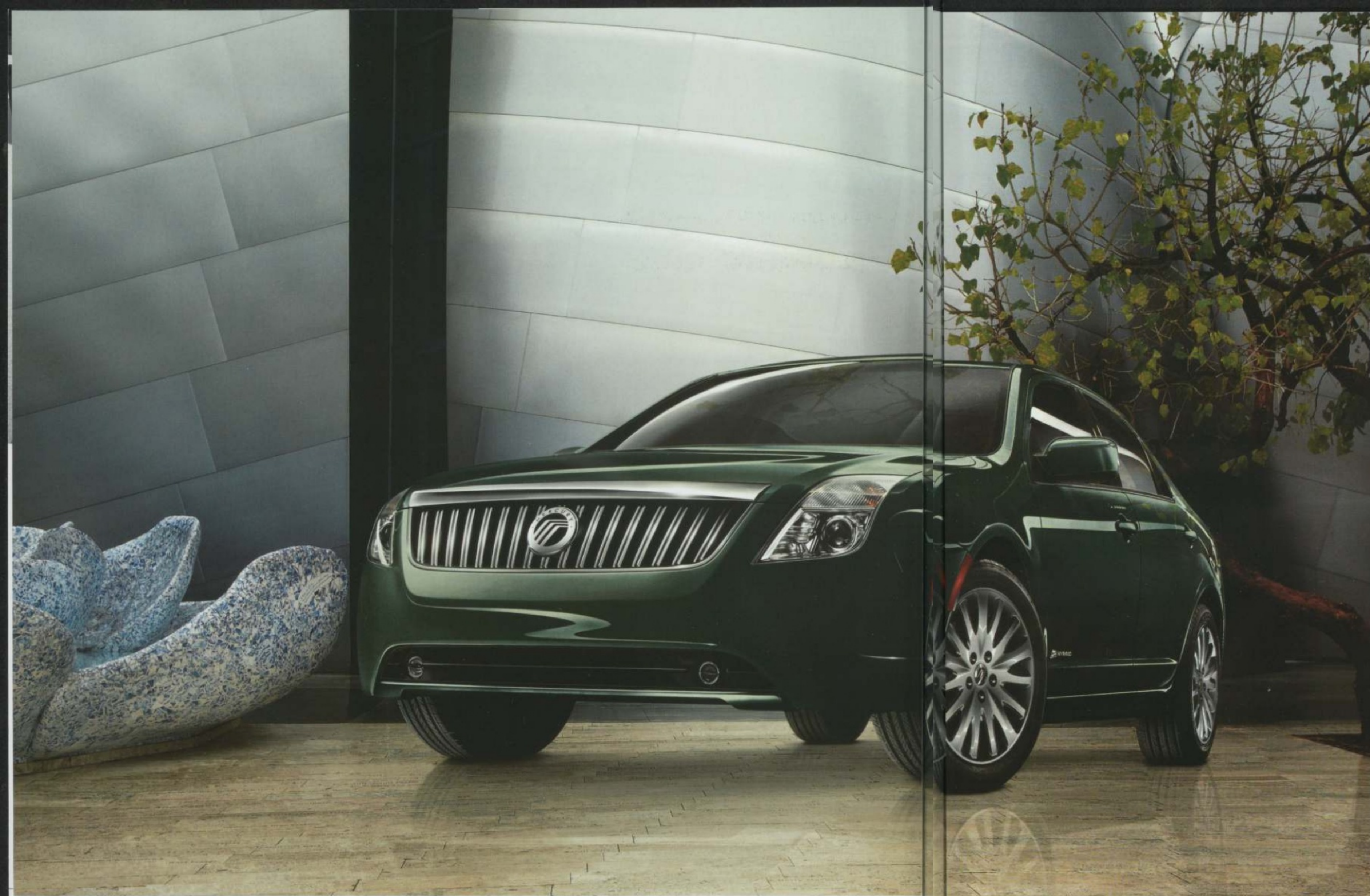
MILAN HYBRID IN ATLANTIS GREEN METALLIC WITH AVAILABLE EQUIPMENT.