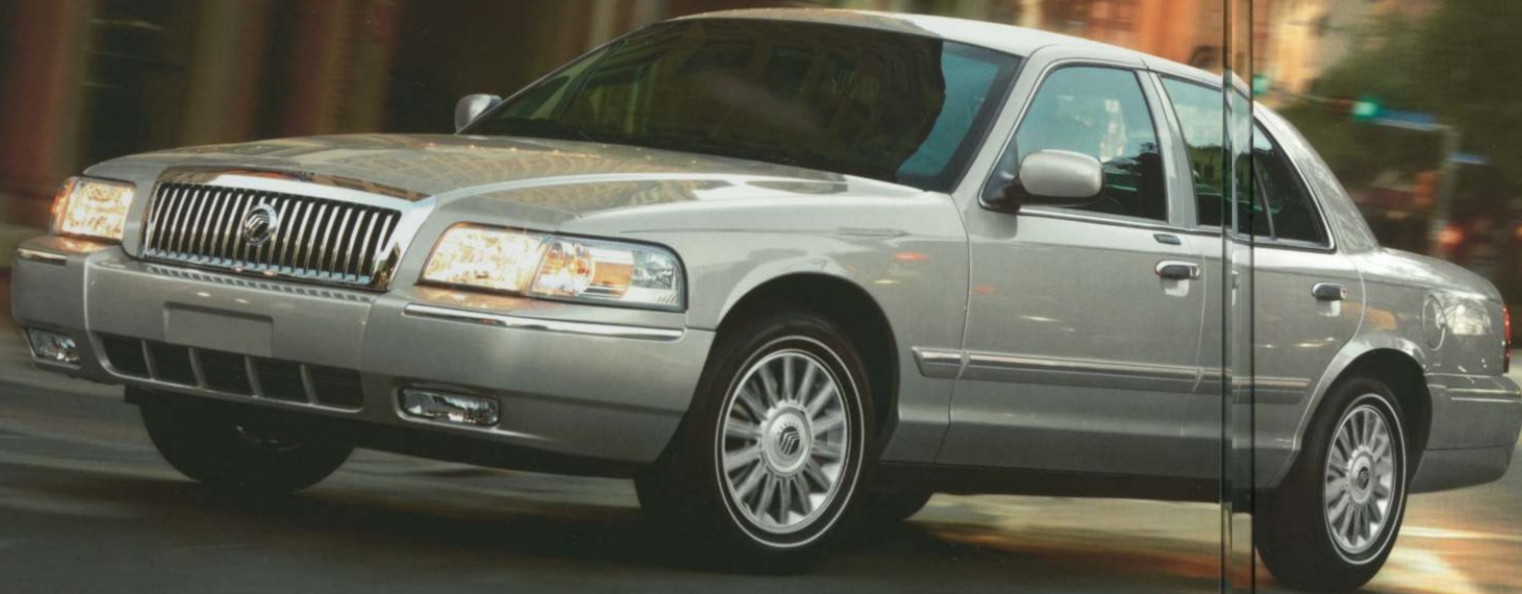
GRAND MARQUIS LS IN SILVER BIRCH METALLIC.