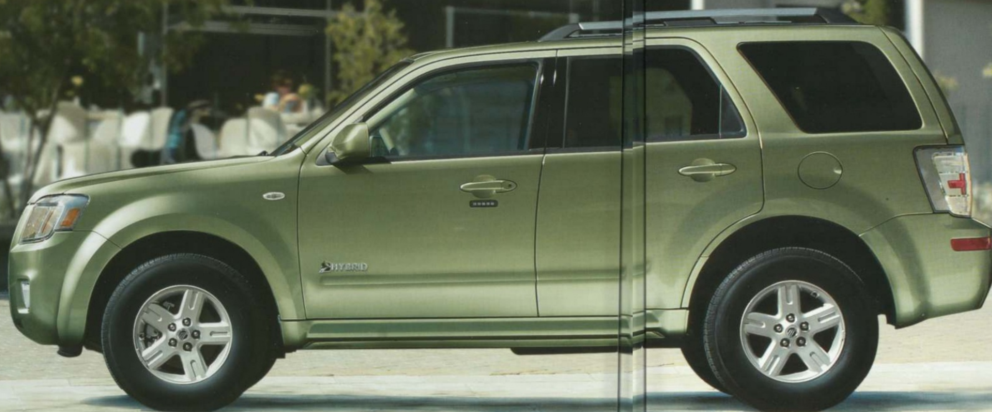
MARINER HYBRID IN KIWII GREEN METALLIC WITH AVAILABLE EQUIPMENT.