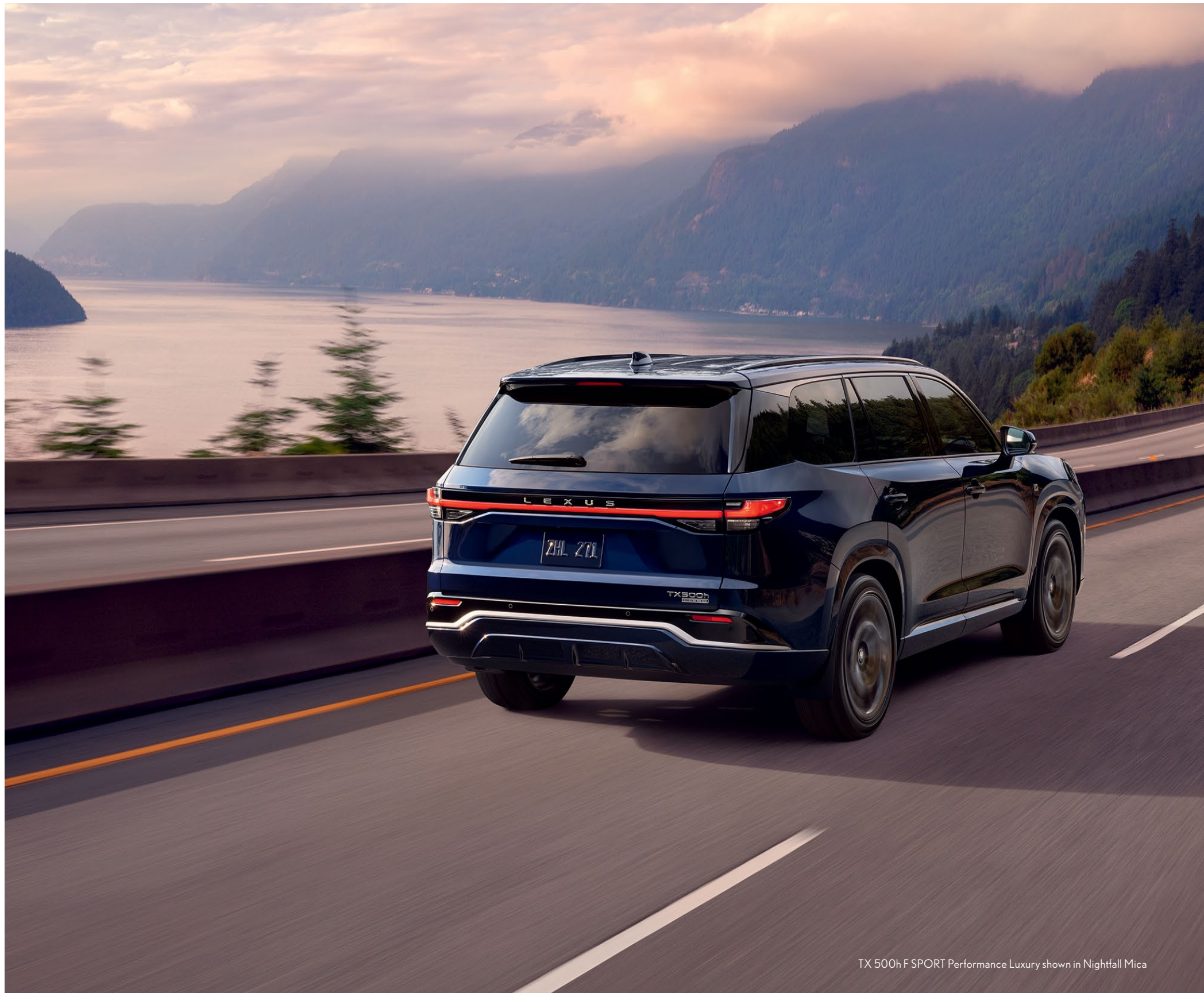
TX 500h F SPORT Performance Luxury shown in Nightfall Mica