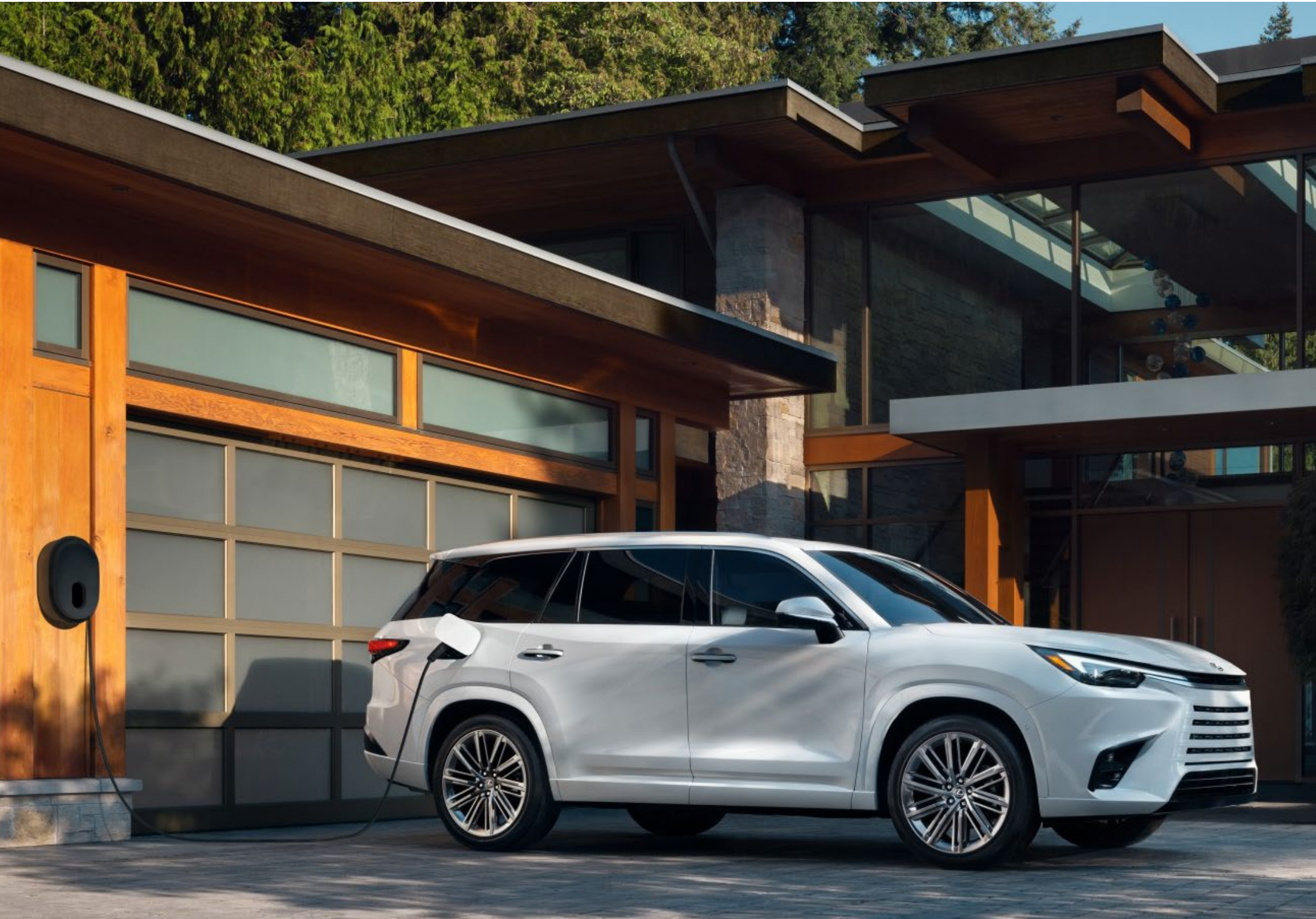
TX 550h+ Luxury Plug-in Hybrid shown in Wind Chill Pearl