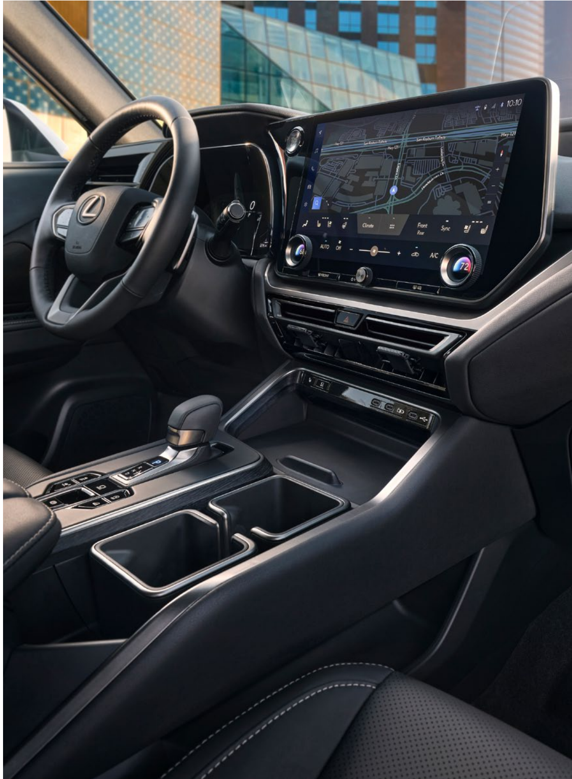
TX 350 Premium AWD shown with Black NuLuxe® and Black Grained interior trim