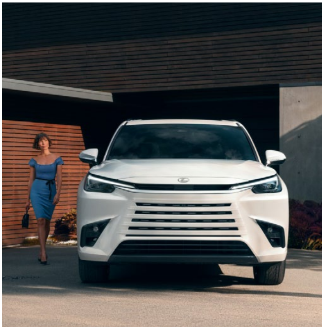
TX 500h F SPORT Performance Luxury shown in Caviar

Captivating from every angle, the TX is a luxury three-row SUV as only Lexus could imagine.