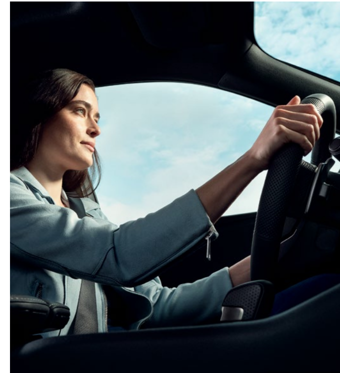
TX 500h F SPORT Performance Luxury shown in Incognito

Offering three distinct powertrains, available all-wheel drive and a towing capacity of 5,000 pounds, the TX is ready to help you take command of every road trip.