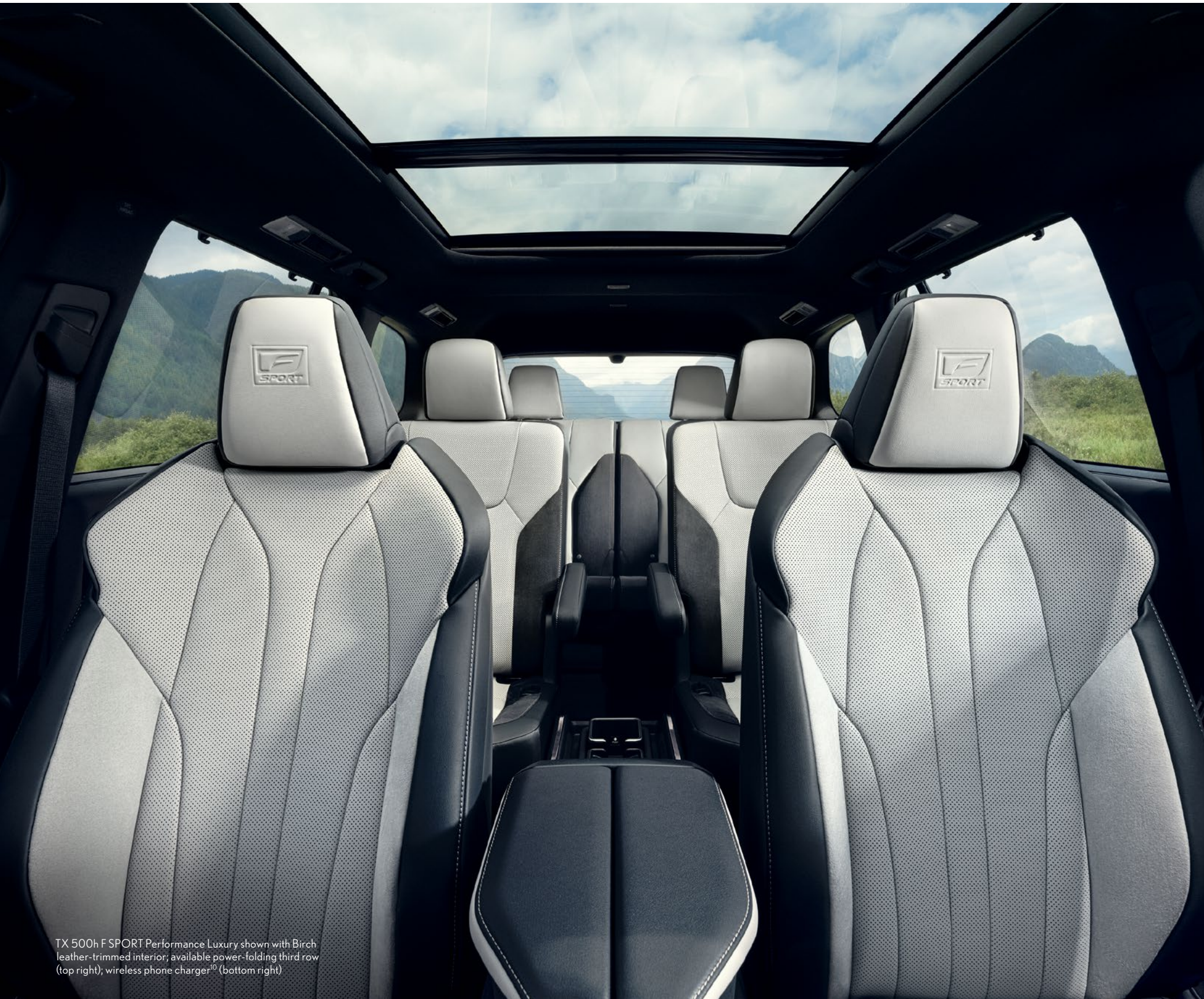
TX 500h F SPORT Performance Luxury shown with Birch leather-trimmed interior; available power-folding third row (top right); wireless phone charger 10 (bottom right)