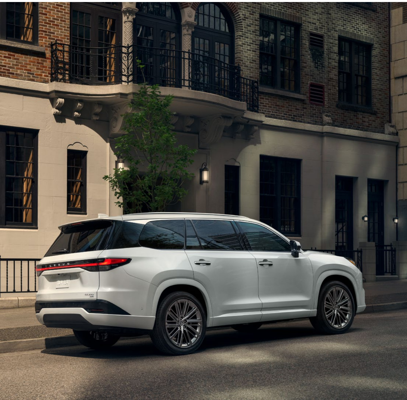
TX 350 Luxury AWD shown with options in Wind Chill Pearl