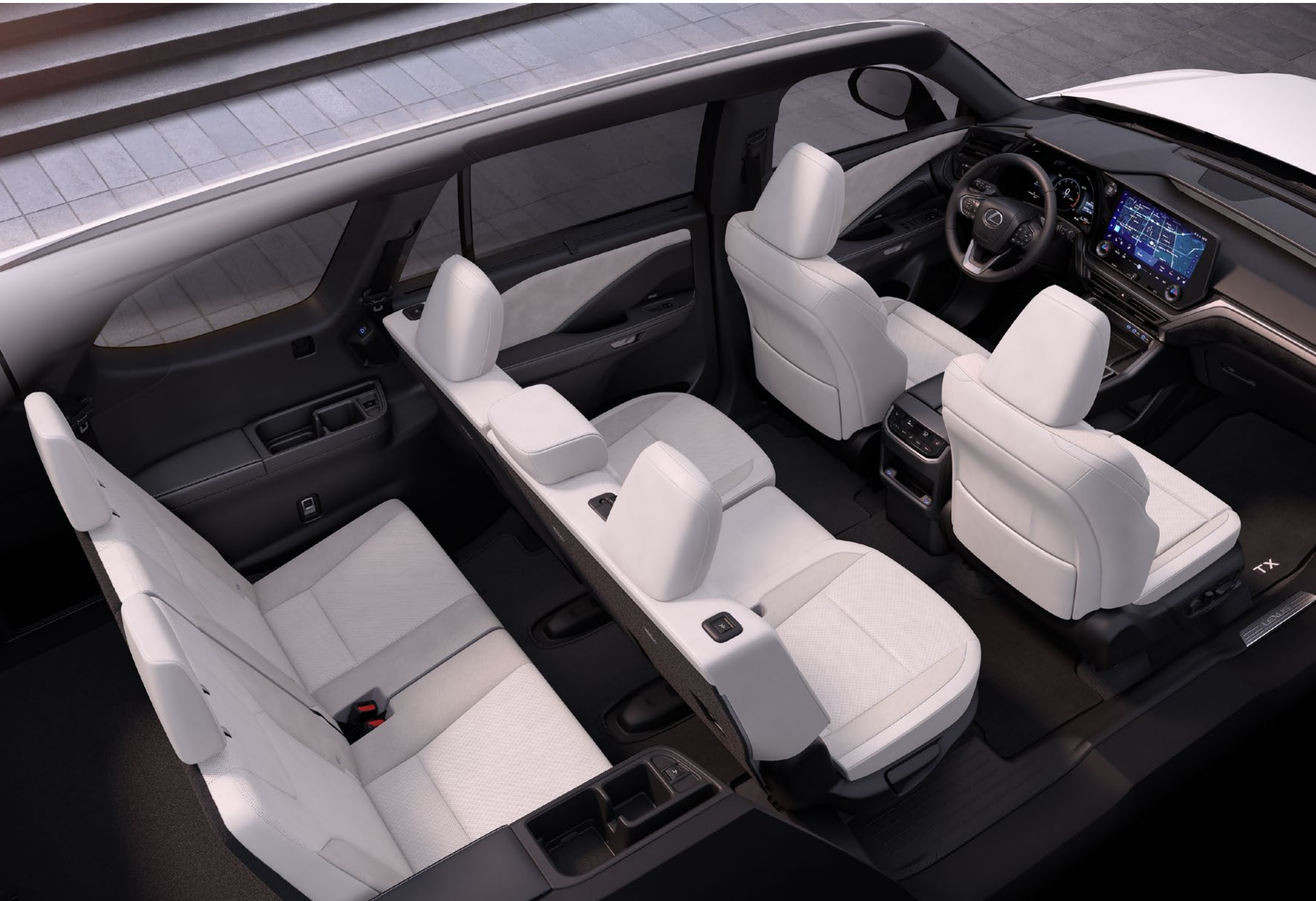
TX 350 Luxury shown with Birch semi-aniline leather and Black Grained interior trim