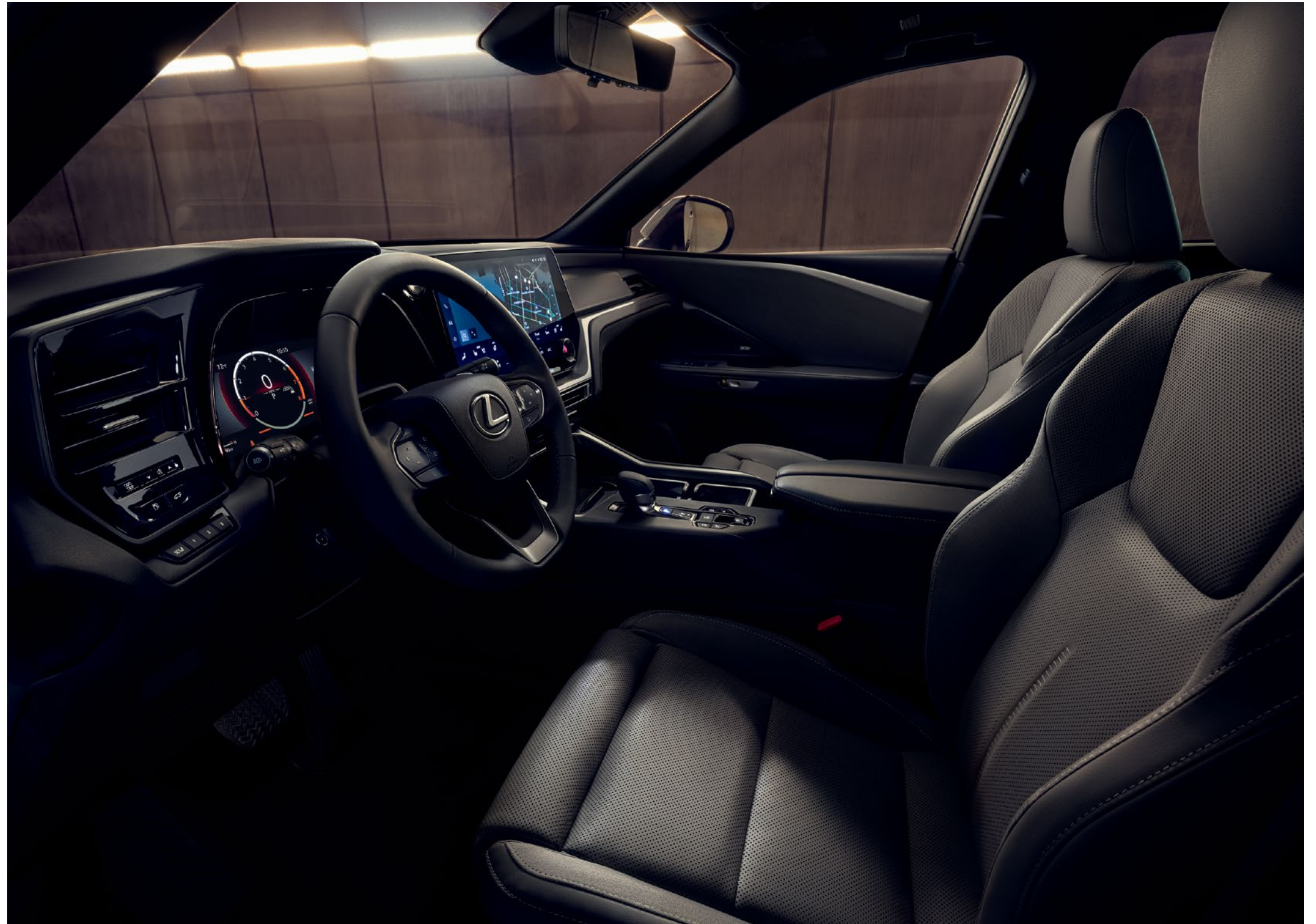
TX 350 Luxury AWD shown with Black semi-aniline leather and Black Grained interior trim

Crafted with a meticulous obsession to detail, the cockpit of the TX is a reminder that the inspiration behind every Lexus starts with the driver. With sculpted power-adjustable heated front seats with available ventilation, three-zone climate control and available selectable ambient lighting, the TX feels as if it was tailored just for you. An easy-access center console and standard wireless charging 10 offer added convenience. Rich materials including Black Grained trim and available semi-aniline leather-trimmed seating bring added elegance to every road trip. And as the cabin was designed to reduce unwanted noise, the TX is more than just a three-row SUV—it's your three-row sanctuary.