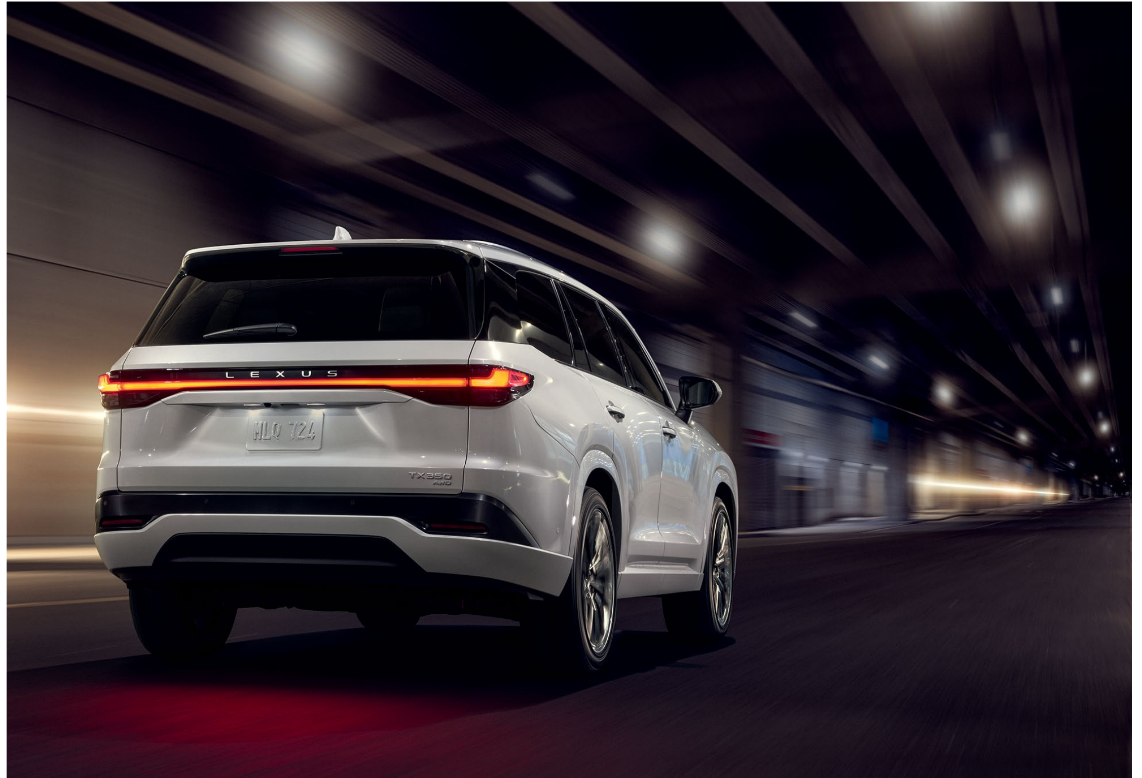
TX 350 Luxury AWD shown in Wind Chill Pearl

This is where impeccable engineering meets intuitive response. Powering the TX 350 is a 2.4-liter turbocharged in-line 4-cylinder rated at 275 horsepower. 1 Its flat torque curve helps you more easily access its 317 lb-ft of torque to give you the passing power you need, when you need it. For added confidence in almost any weather, available electronically controlled full-time all-wheel drive doesn't just handle the road—it reacts to it. Monitoring surface conditions in real time, this system can automatically shift engine power between the front and rear axles of the TX, and can send as much as 50% of available drive force to the rear wheels when needed.