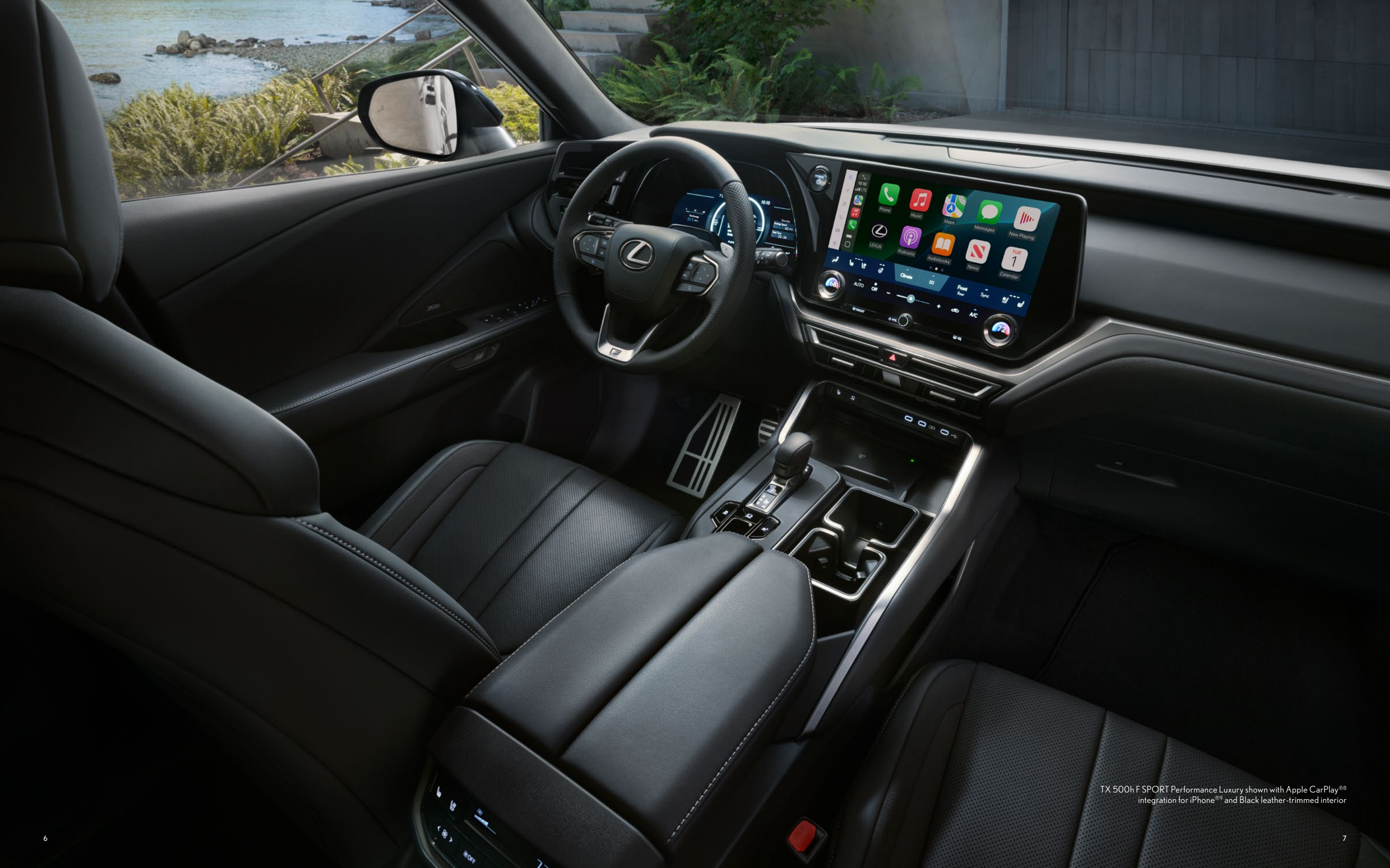
TX 500h F SPORT Performance Luxury shown with Apple CarPlay ® integration for iPhone ® and Black leather-trimmed interior