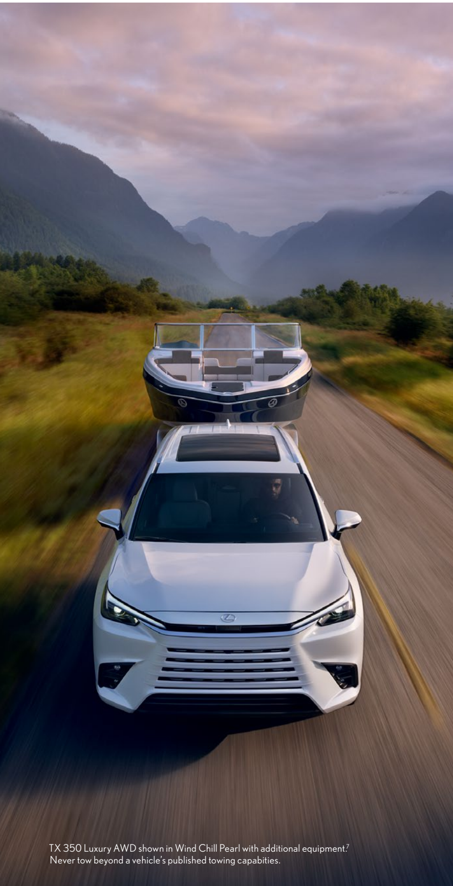
TX 350 Luxury AWD shown in Wind Chill Pearl with additional equipment. 7 Never tow beyond a vehicle's published towing capabilities.