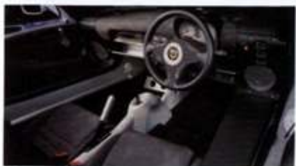
Sports Tourer pack