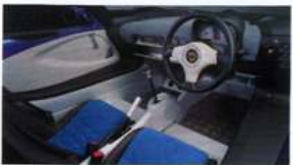
Race Tech pack