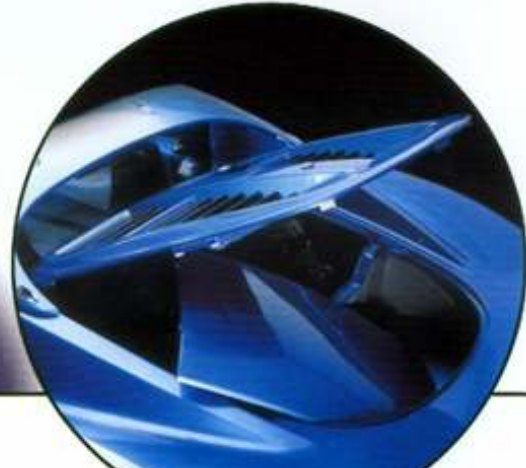
The larger 115 litre boot gives ample storage and can house both removable roof panels