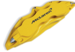
Yellow with black McLaren logo