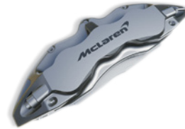
Silver with black McLaren logo