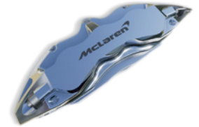
Polished with black McLaren logo