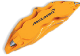
McLaren Orange with black McLaren logo