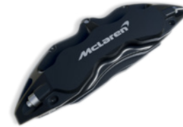
Liquid Black with silver McLaren logo