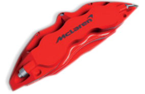
Red with black McLaren logo