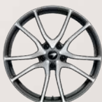
Diamond cut finish