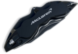
Black with silver McLaren logo