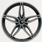
Diamond cut finish

Lightweight 10-Spoke forged alloy wheels