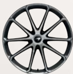
Diamond cut finish

Super-Lightweight 10-Spoke forged alloy wheels