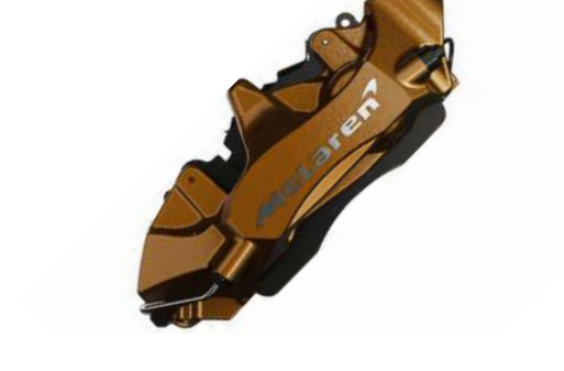
Bronze with Machined McLaren logo