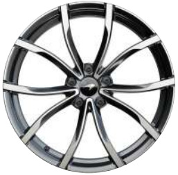
Stealth Diamond Cut