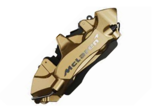
Speedline Gold with Machined McLaren logo