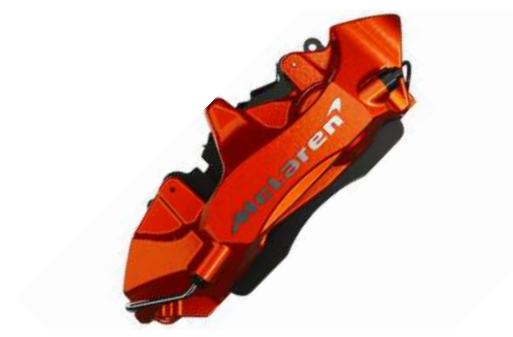
Azores with Machined McLaren logo