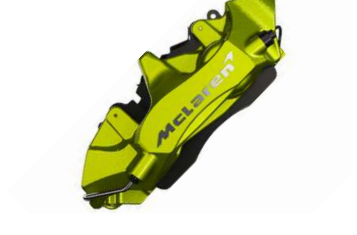
Flux Green with Machined McLaren logo