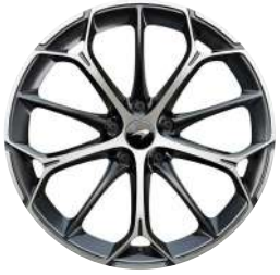
Stealth Diamond Cut