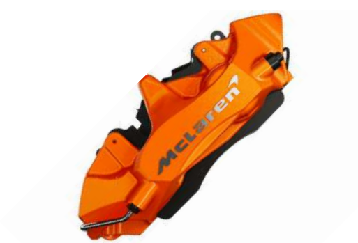
McLaren Orange with Machined McLaren logo