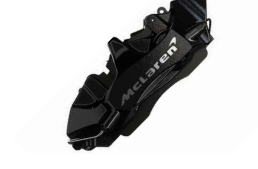
Black with Machined McLaren logo