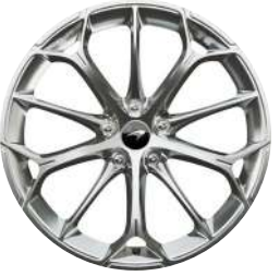
Titanium Liquid Metal