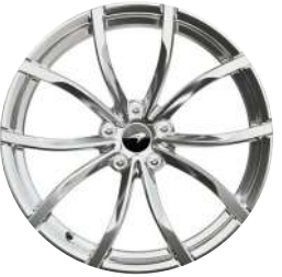
Titanium Liquid Metal