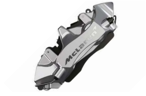
Polished with Machined McLaren logo