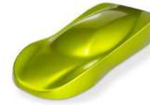
Flux Green II