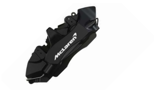
Black Anodised with White Printed McLaren Logo