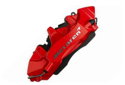
Red with Machined McLaren logo