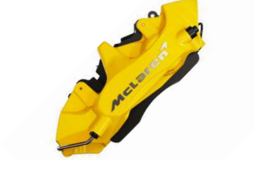
Yellow with Machined McLaren logo