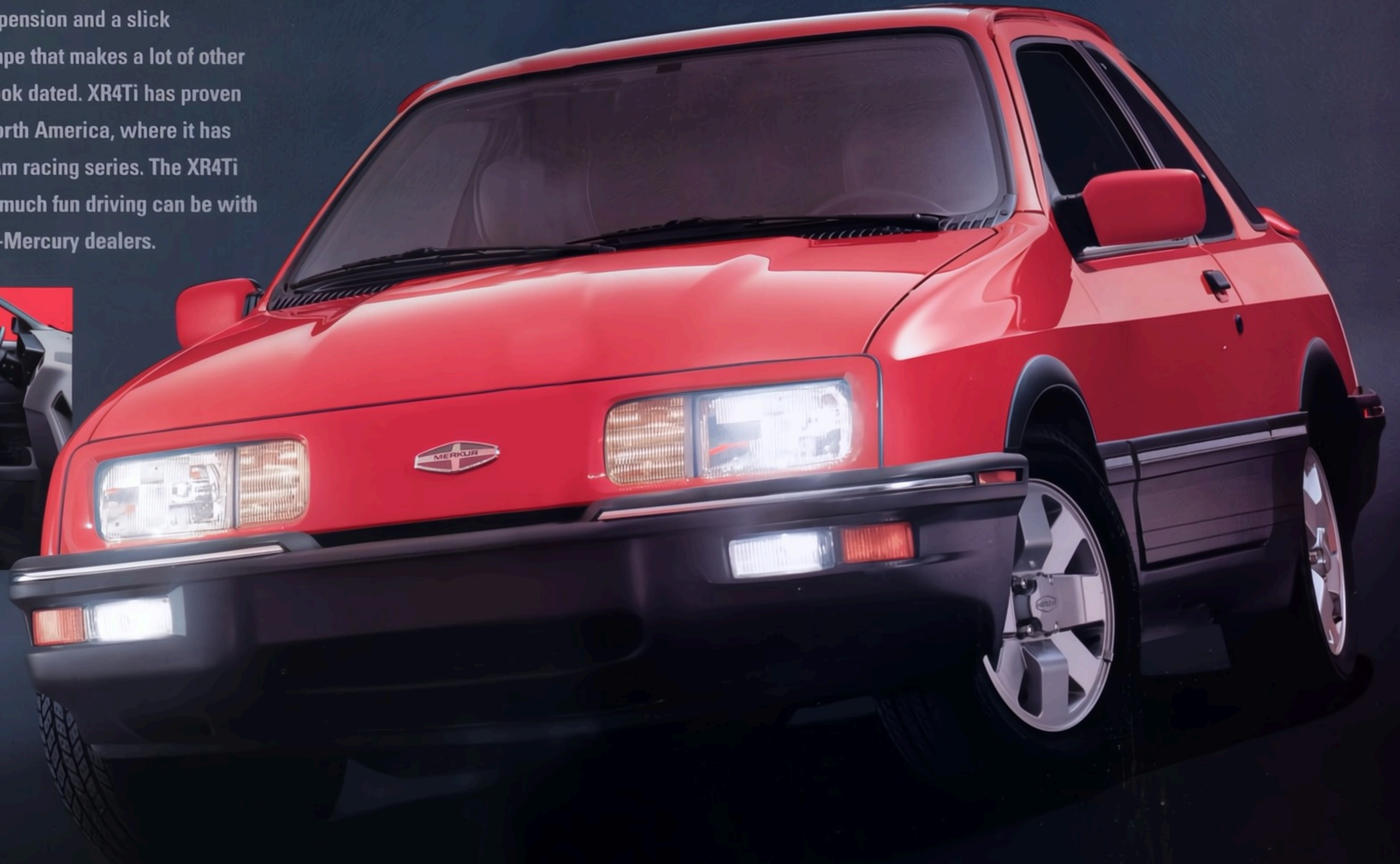
XR4Ti in Rosso Red.