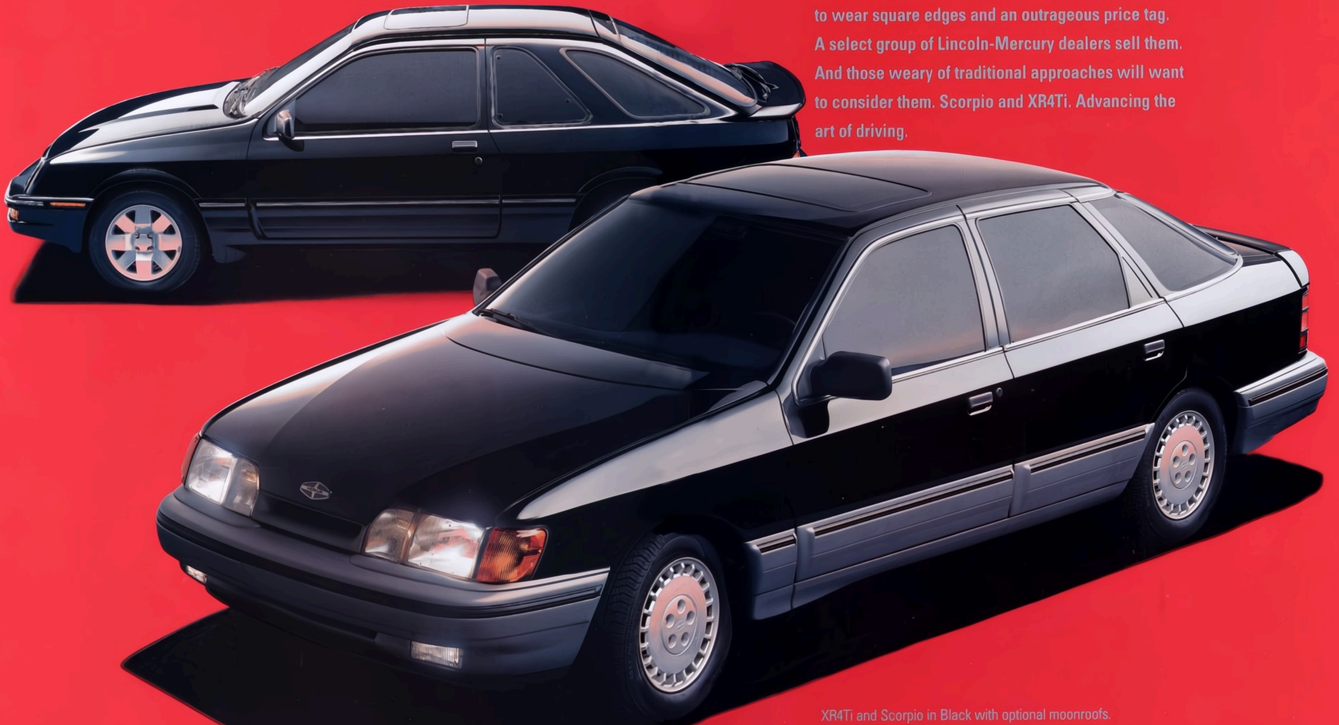
XR4Ti and Scorpio in Black with optional moonroofs.

NO ONE EVER MOVED AHEAD BY FOLLOWING BEHIND. And no one ever built a better automobile by copying an existing one. That's why XR4Ti and Scorpio don't look like other cars. They don't conform to traditional standards. They challenge them. Scorpio proves that a German touring sedan can contain a highly functional interior without becoming cramped or spartan. XR4Ti is bold evidence that the European performance car doesn't have to wear square edges and an outrageous price tag. A select group of Lincoln-Mercury dealers sell them. And those weary of traditional approaches will want to consider them. Scorpio and XR4Ti. Advancing the art of driving.