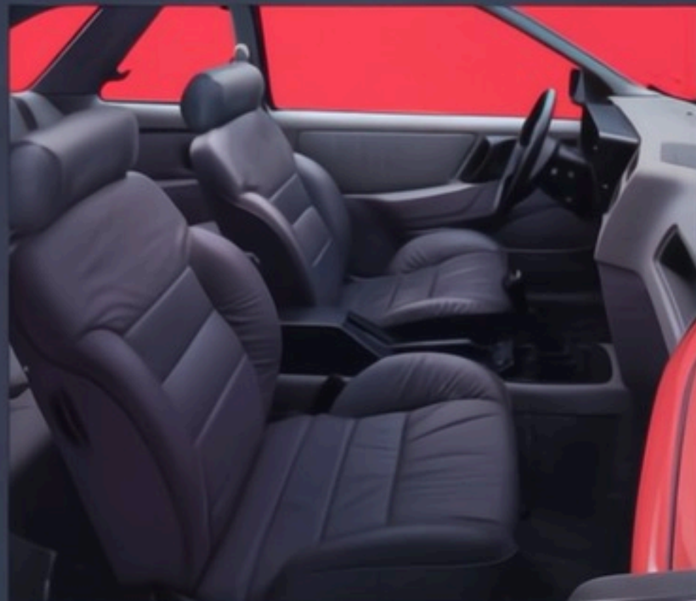
Optional Shadow Gray leather interior.

If you subscribe to that simple truth, then a rewarding encounter with an XR4Ti is suggested. XR4Ti is a turbocharged 175-horsepower coupe with a balanced independent suspension and a slick aerodynamic shape that makes a lot of other European cars look dated. XR4Ti has proven itself on the racetracks of North America, where it has dominated the SCCA Trans-Am racing series. The XR4Ti from Germany. Find out how much fun driving can be with a test drive at select Lincoln-Mercury dealers.