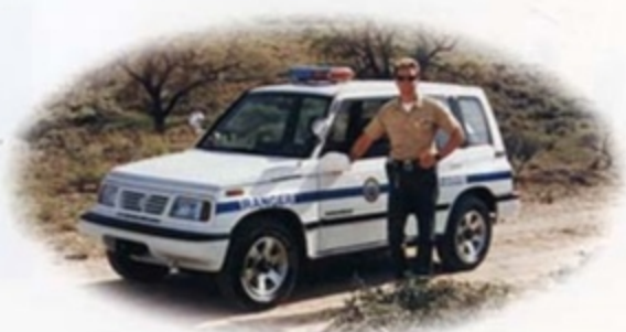
* Operates in 2WD mode only.