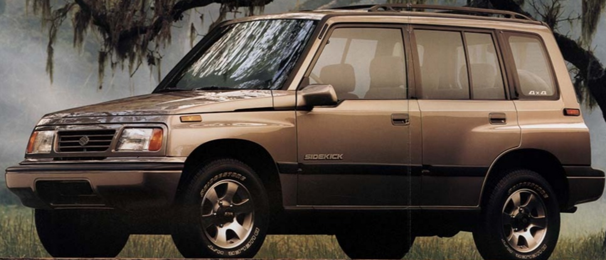
Shown with optional equipment.