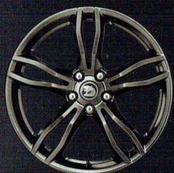
20" SV RAPIEL FORGED ALLOY WHEEL IN DARK STAINLESS (OPTIONAL)