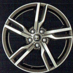
20" ALLOY WHEEL WITH MACHINED FACE AND MAGNETIC GREY ACCENTS