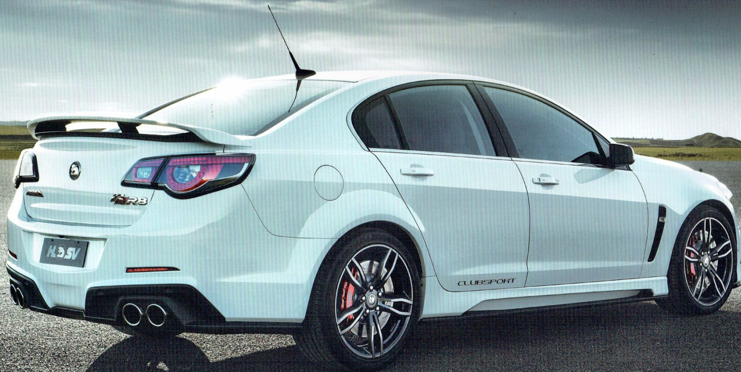
ClubSport R8 LSA shown with optional 20" SV Rapier forged alloy wheels in Dark Stainless and Hyperflow Performance Rear Spoiler.

»» TELL THE WORLD EXACTLY WHERE YOU STAND.