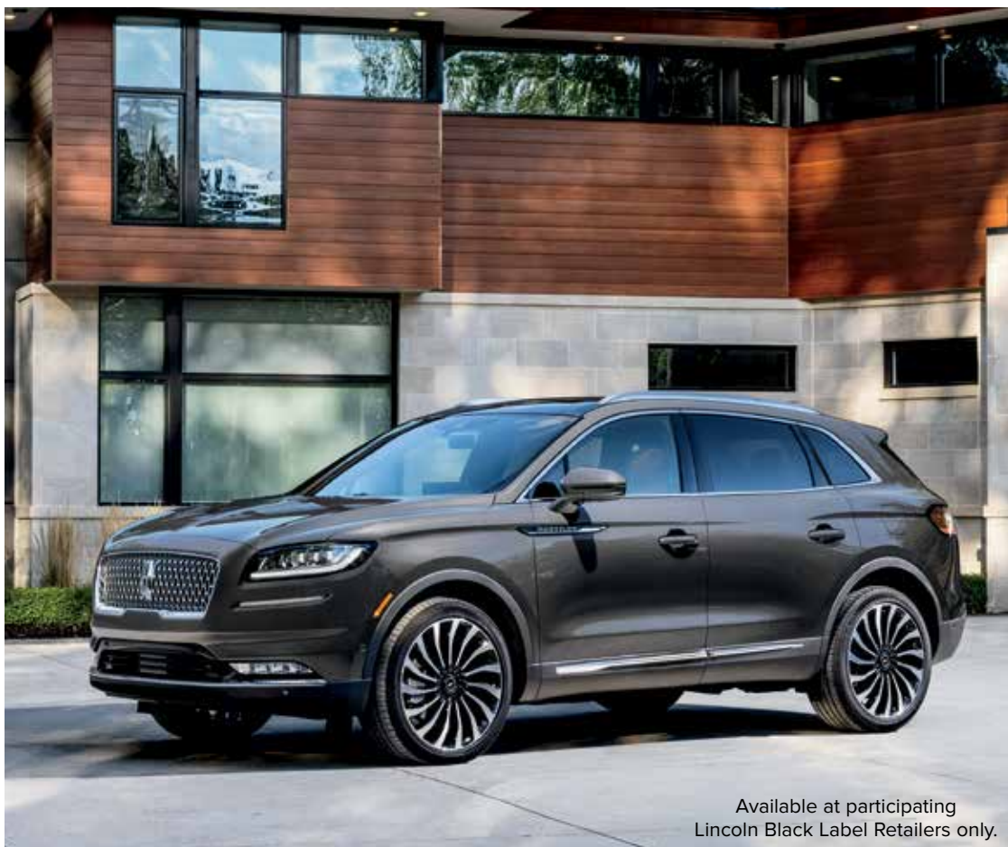
Available at participating Lincoln Black Label Retailers only.

Nautilus Black Label with available features in Chroma Caviar Dark Gray Metallic Clearcoat*