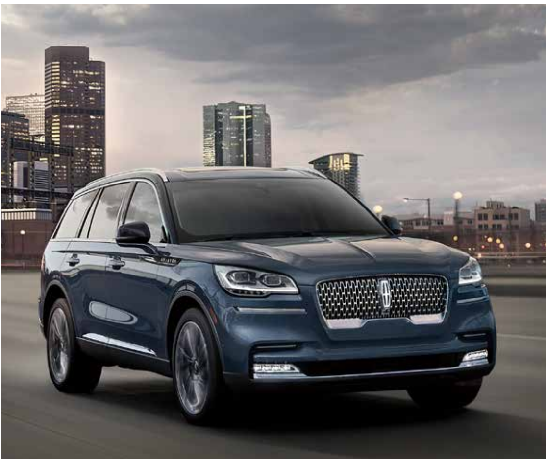
Aviator Reserve with available features in Flight Blue Metallic Clearcoat*