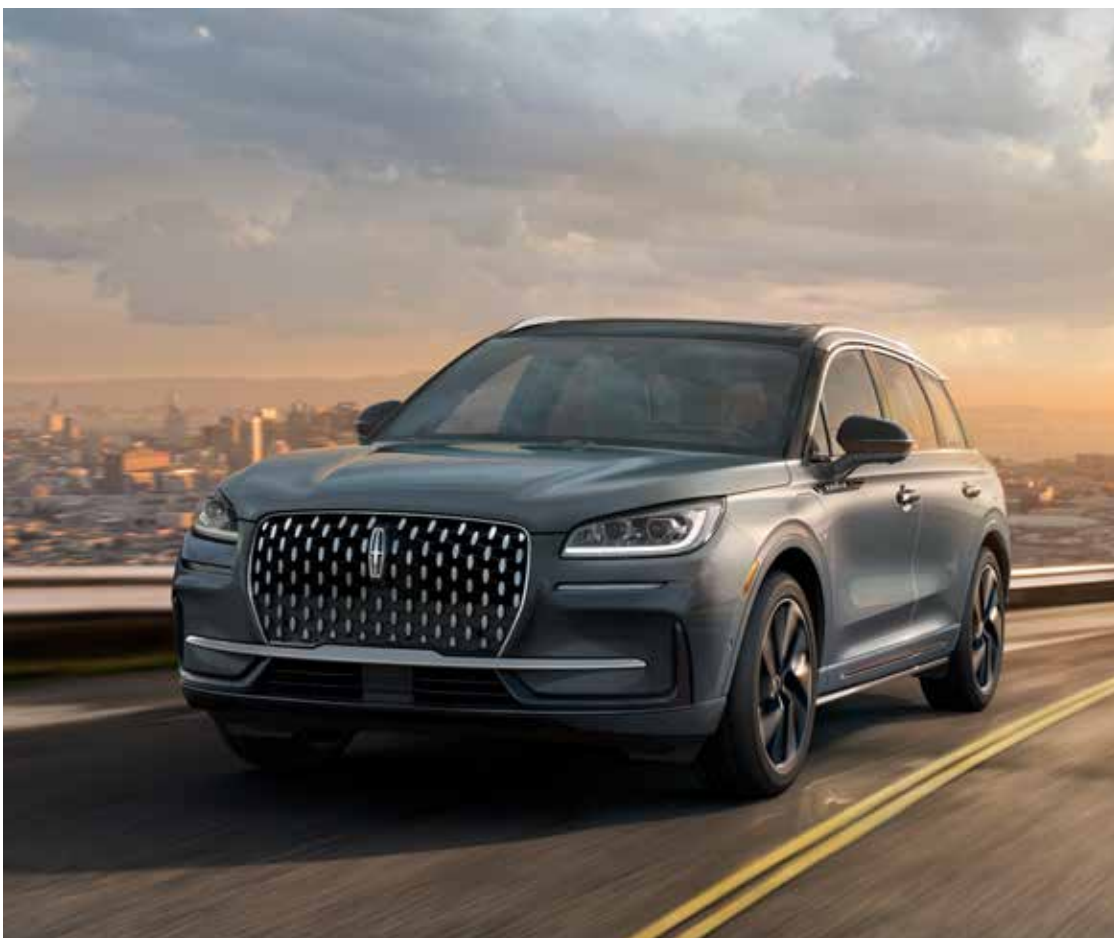
Corsair Grand Touring with available features in Whisper Blue Metallic Clearcoat*