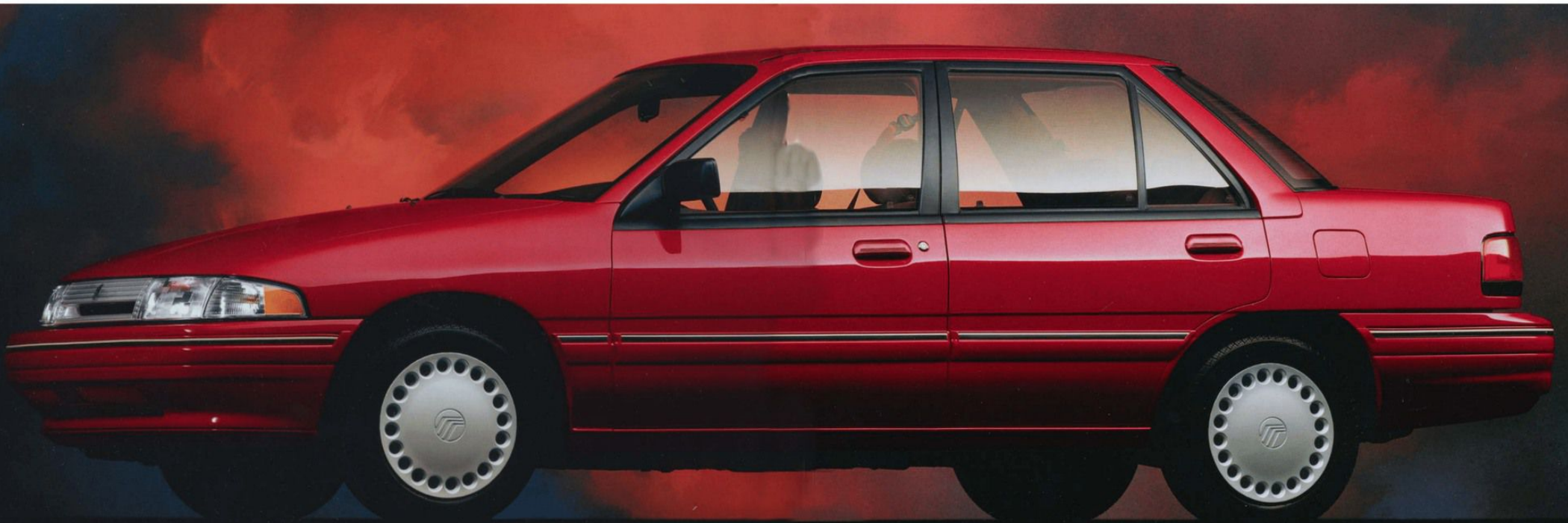
Tracer is pictured here in Electric Red Clearcoat Metallic. Some features shown may be optional.