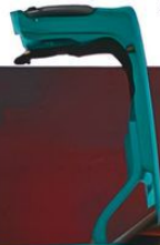
height with a high-lift lid to create a 12.1 cubic feet of cargo capacity inside. Calypso Green Clearcoat Metallic.

Every new Tracer includes the security of a standard driver-side air bag Supplemental Restraint System. In the unfortunate event of certain moderate to severe frontal collisions, it inflates in about 1/20 of a second, or less time than it takes to blink an eye, to greatly reduce the risk of head and chest injuries to the driver. Of course, it can't do its job properly unless you do yours first. Always wear your safety belt.