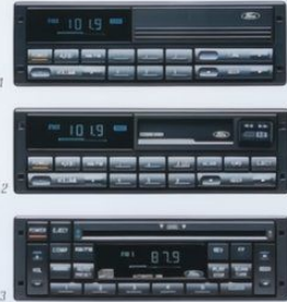
Tracer Sedan and Wagon feature an electronic AM/FM stereo radio (1), while the LTS system also includes a cassette deck. All Tracers offer an optional Premium Sound system with an 80-watt AM/FM stereo cassette radio and four upgraded speakers (2). Newly available is the musical clarity of an optional CD radio which includes Premium Sound (3).

Every new Mercury includes the assurance of an emergency Roadside Assistance Program provided by Ford Auto Club, Inc. during the 3-year/36,000-mile bumper-to-bumper warranty period. Help is a toll-free phone call away 24 hours a day, anywhere in the continental United States should you need any towing assistance, fuel delivery, tire change, a jump start or even help when you've locked yourself out of your car. Ask your Lincoln-Mercury dealer for complete details on the Ford Roadside Assistance Program and a copy of the limited warranty.