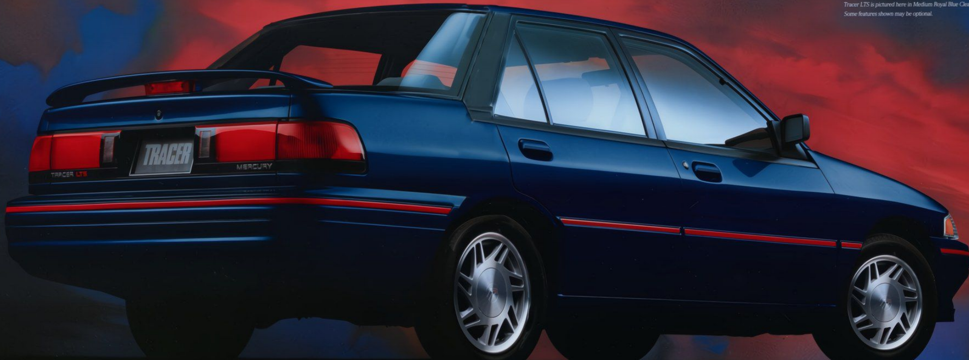
Tracer LTS is pictured here in Medium Royal Blue Clearcoat Metallic. Some features shown may be optional.