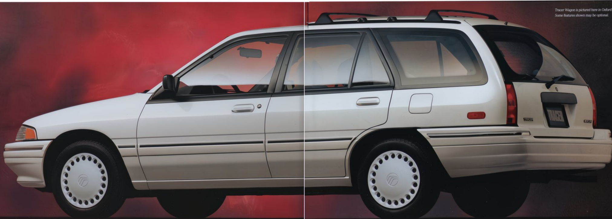
Tracer Wagon is pictured here in Oxford White. Some features shown may be optional.