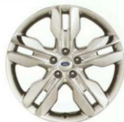
20" Chrome-Clad Aluminum Optional

Charcoal Black leather trim. SYNC® with MyFord Touch. Available equipment.