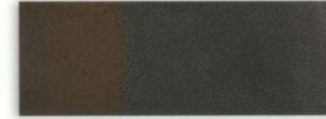
8 Charcoal Black Leather with Sienna Seating Surfaces