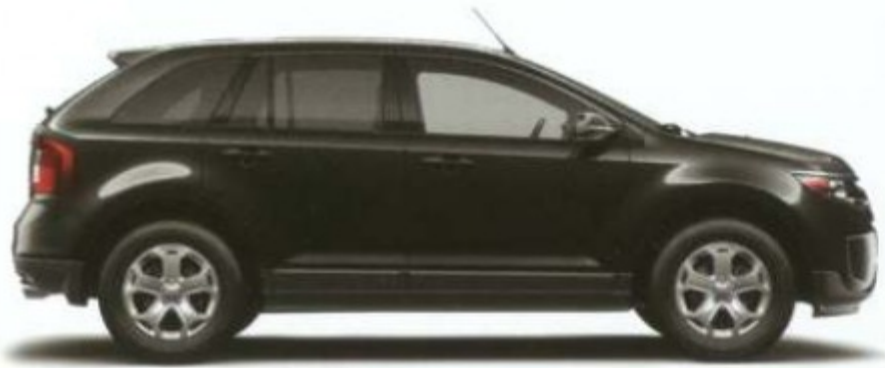
Tuxedo Black Metallic