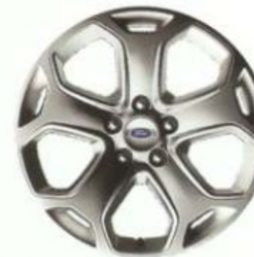
18" Painted Aluminum Standard: SEL Included: SE EcoBoost