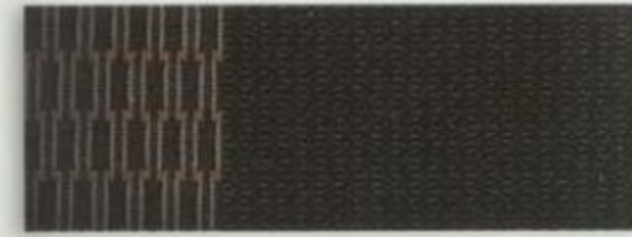
4 Unique Charcoal Black Cloth