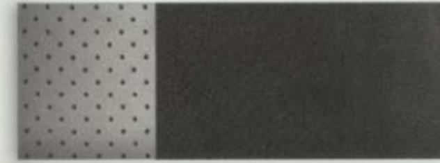
7 Charcoal Black Leather with Grey Alcantara® Perforated Inserts