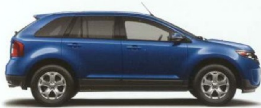
Deep Impact Blue Metallic