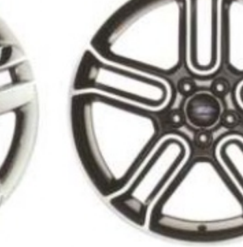
20" Painted-Black Aluminum with Machined Face Included: SEL Appearance Package