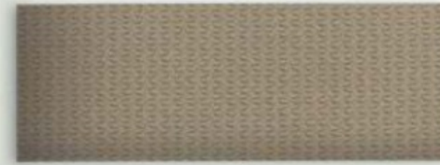
1 Medium Light Stone Cloth