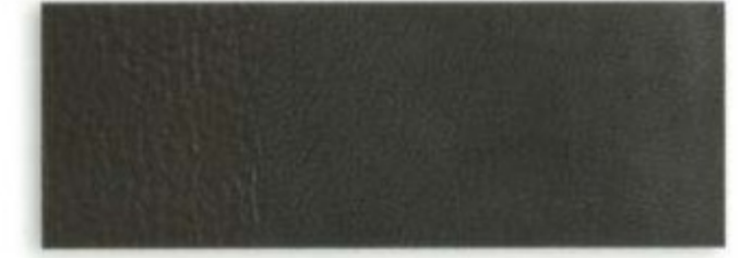
6 Charcoal Black Leather