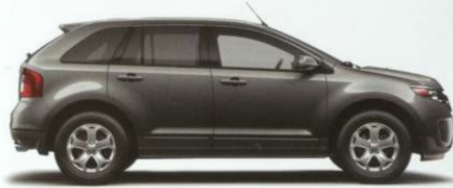
Mineral Grey Metallic