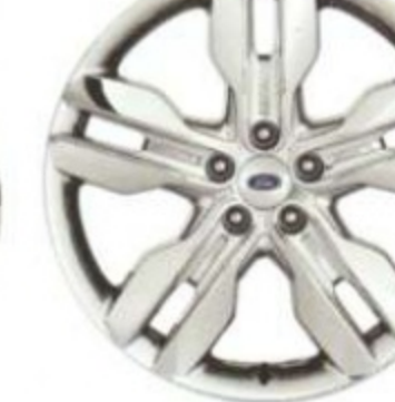
20" Chrome-Clad Aluminum Available: SEL