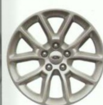
17" Painted Aluminum Standard: SE 3.5L V6

2.0L EcoBoost 4-cyl. engine 2 with 6-speed automatic transmission, Active Grille Shutters and engine block heater 18" chrome-clad aluminum wheels 20" chrome-clad aluminum wheels (requires 201A or 202A) All-weather floor mats Dual head restraint DVD by INVISION ™3 (dealer-installed) Engine block heater Illuminated front door-sill plates Panoramic Vista Roof (200A only) Roof-rack side rails (n/a with Vista Roof) Voice-activated Navigation System with SD card for map and POI data (requires 201A or 202A)