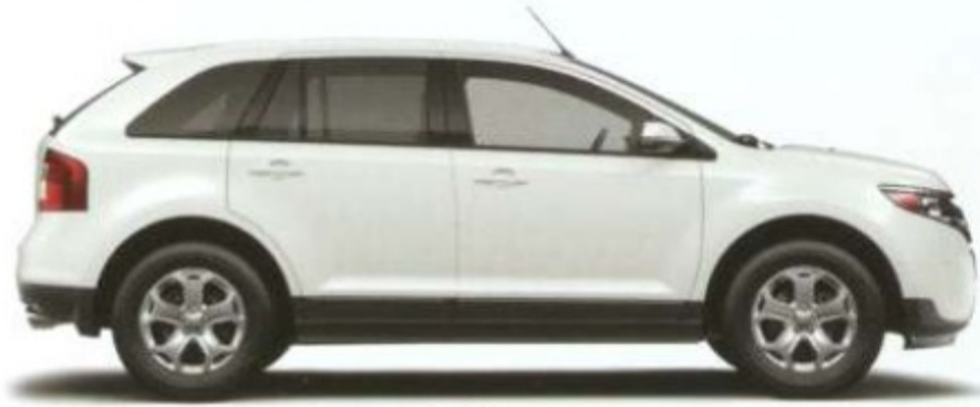
White Platinum Metallic Tri-coat