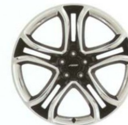
22" Polished Aluminum with Tuxedo Black Metallic Spoke Accents Standard

All-weather floor mats Dual head restraint DVD by INVISION ™ (dealer-installed) Engine block heater Illuminated front door-sill plates Voice-activated Navigation System with SD card for map and POI data