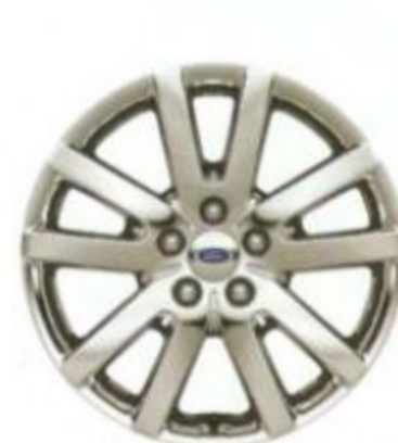
18" Chrome-Clad Aluminum Standard