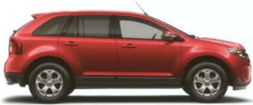
Ruby Red Metallic Tinted Clearcoat