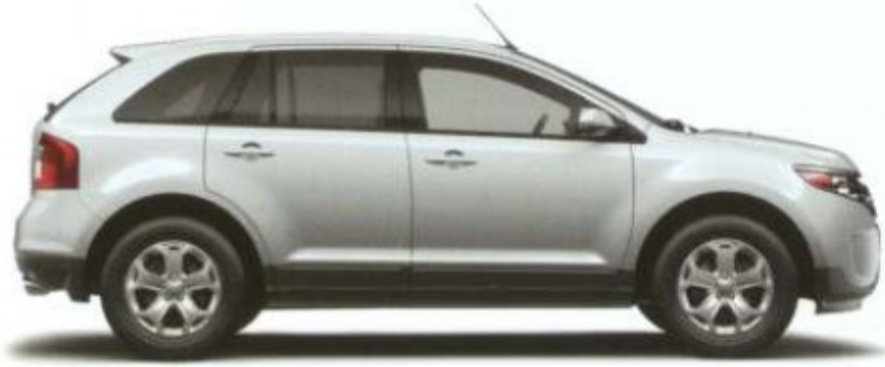
Ingot Silver Metallic