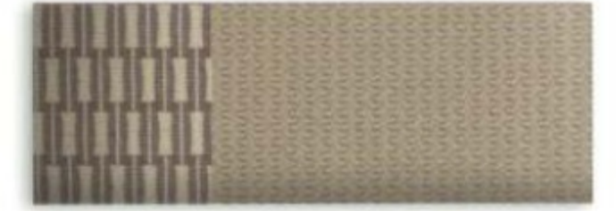
3 Unique Medium Light Stone Cloth