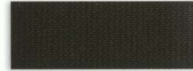
2 Charcoal Black Cloth