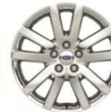
18" Chrome-Clad Aluminum Optional: SEL