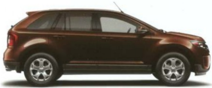
Kodiak Brown Metallic