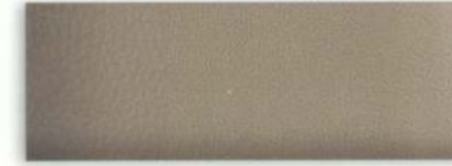
5 Medium Light Stone Leather