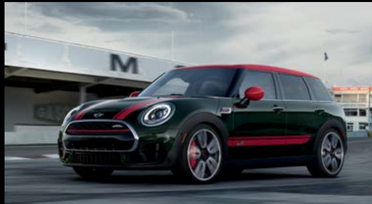
THE MINI JOHN COOPER WORKS CLUBMAN ALL4. For those as comfortable with tailor-made suits as racing suits.