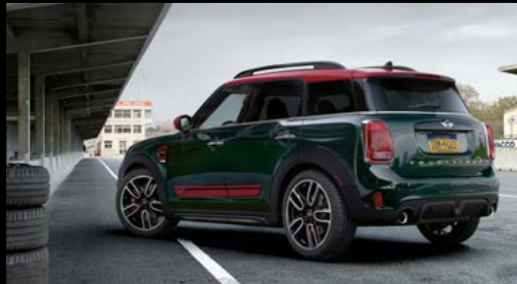
THE MINI JOHN COOPER WORKS COUNTRYMAN ALL4. The roomy choice for adrenaline-fueled excursions far and near.