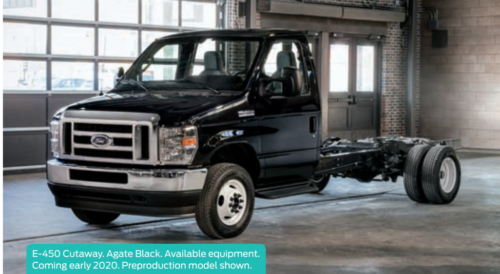
E-450 Cutaway. Agate Black. Available equipment. Coming early 2020. Preproduction model shown.