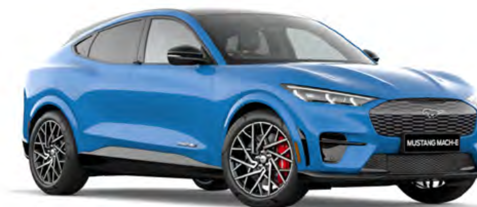
Grabber Blue Metallic*