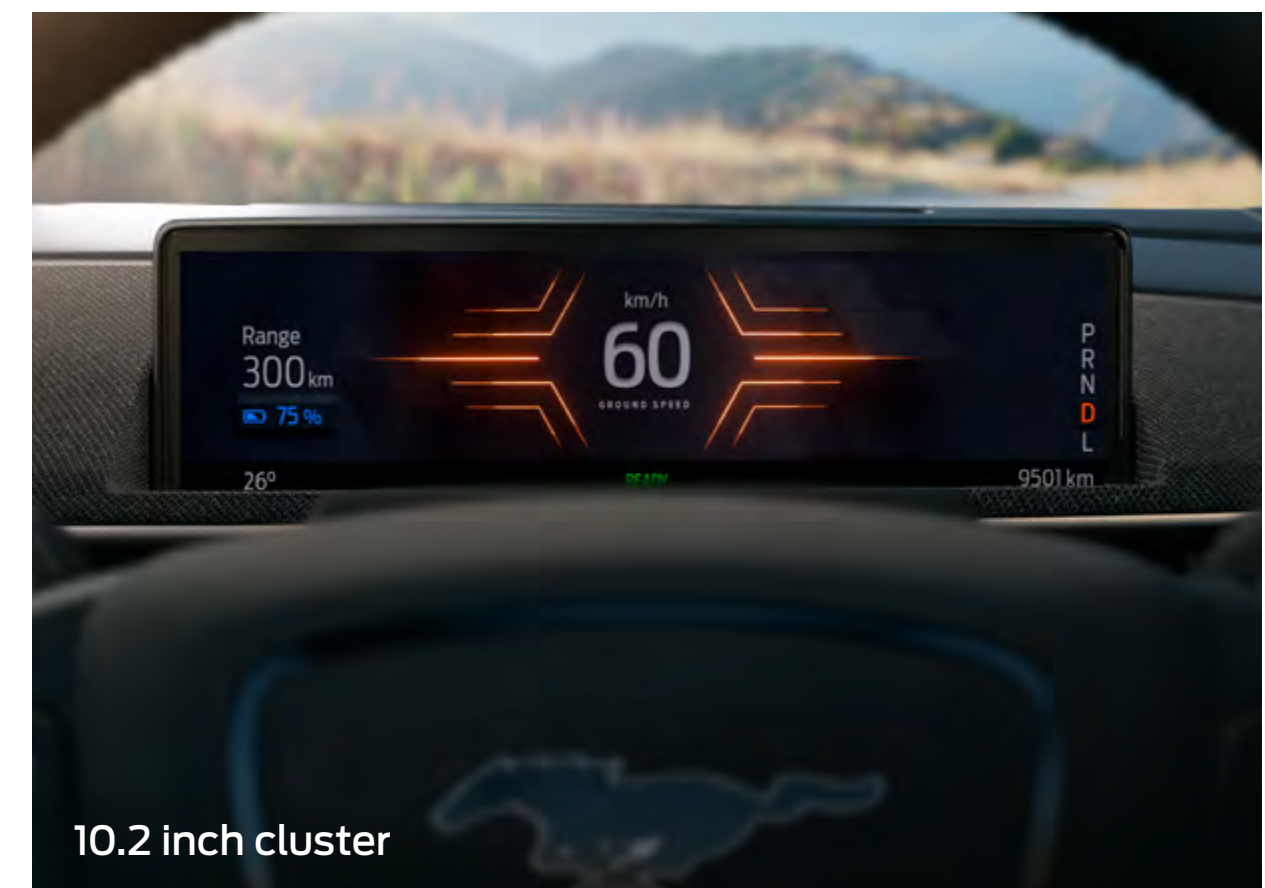
10.2 inch cluster