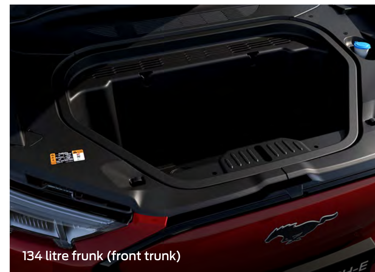
134 litre frunk (front trunk)