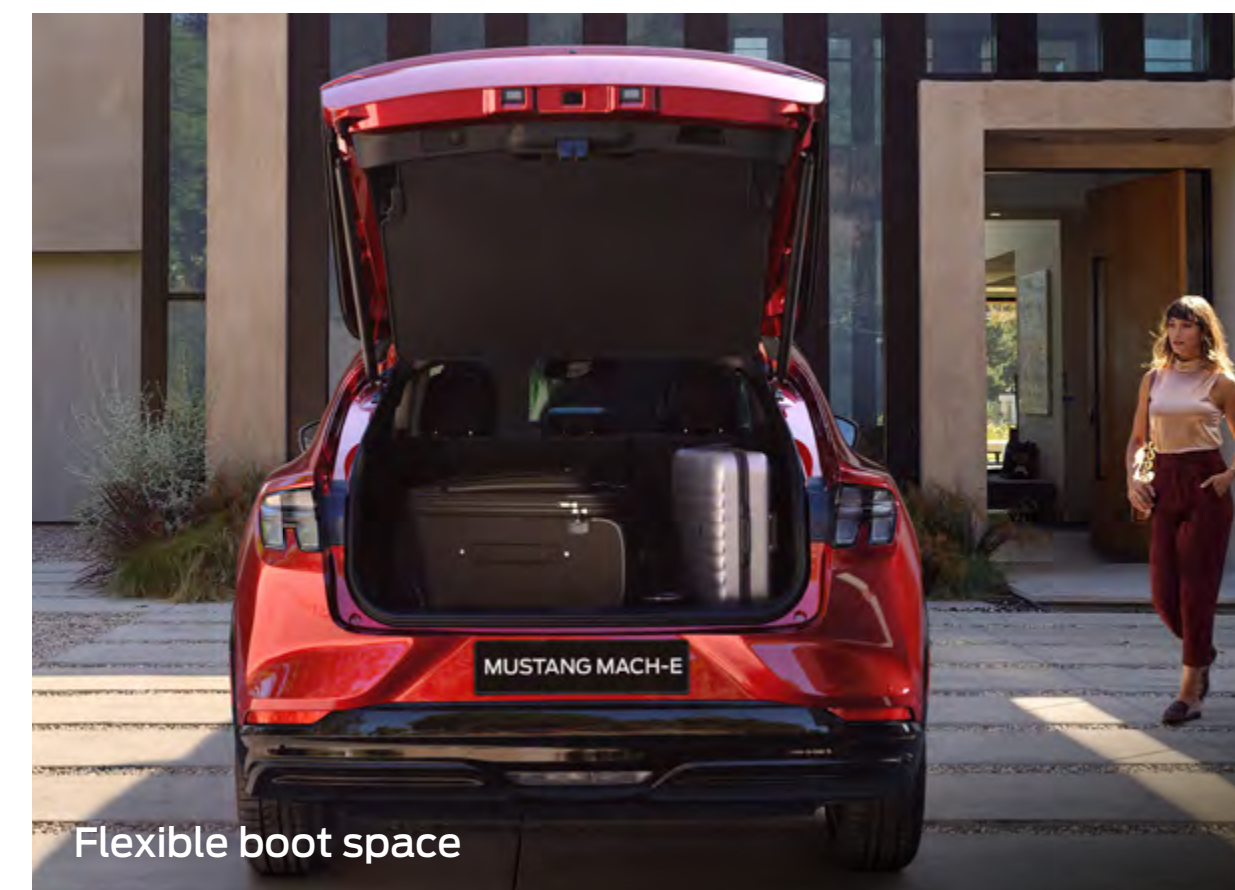
Flexible boot space