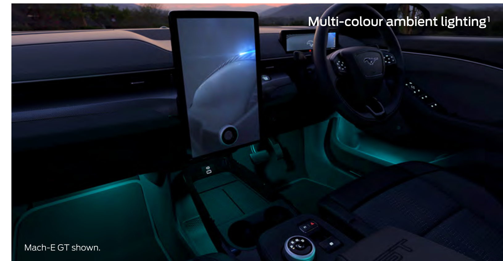
Mach-E GT shown.

Outside, Mustang's famous puddle lamps will project the pony emblem at your feet. While inside, Premium and GT have multi-colour ambient lighting 1 , so you can match the lighting to your mood.