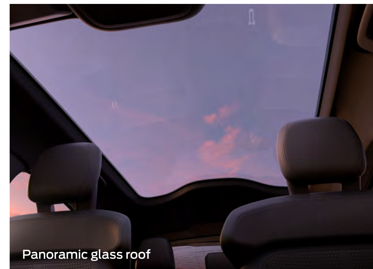
Panoramic glass roof