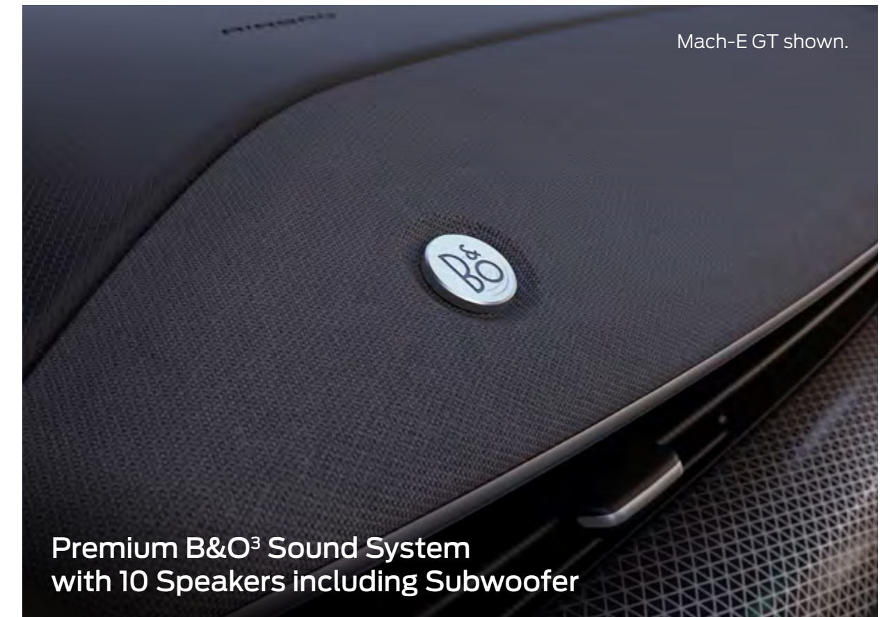
Premium B&O 3 Sound System with 10 Speakers including Subwoofer