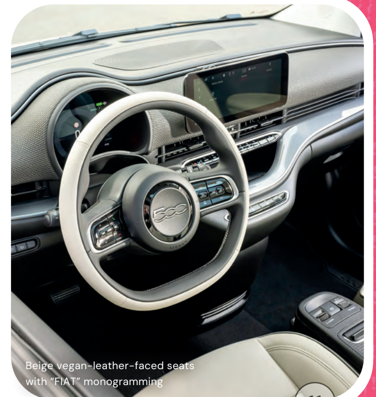
Beige vegan-leather-faced seats with "FIAT" monogramming