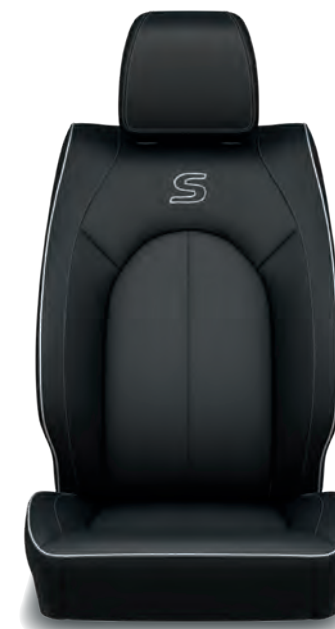
Black Nappa leather-faced seats with perforated inserts/ Light Diesel Grey accent piping and stitching/embroidered S logo Standard