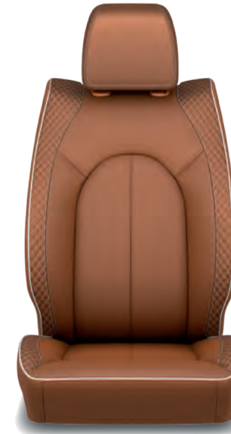
Sepia premium quilted Nappa leather-faced seats/Axis II perforated inserts/Light Diesel stitching and Sydney Grey piping Standard