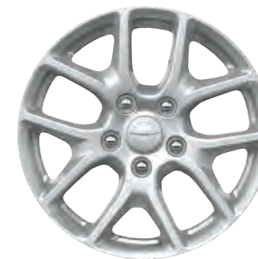
17-inch fully painted Tech Silver cast aluminum wheels Standard on FWD [WFN]