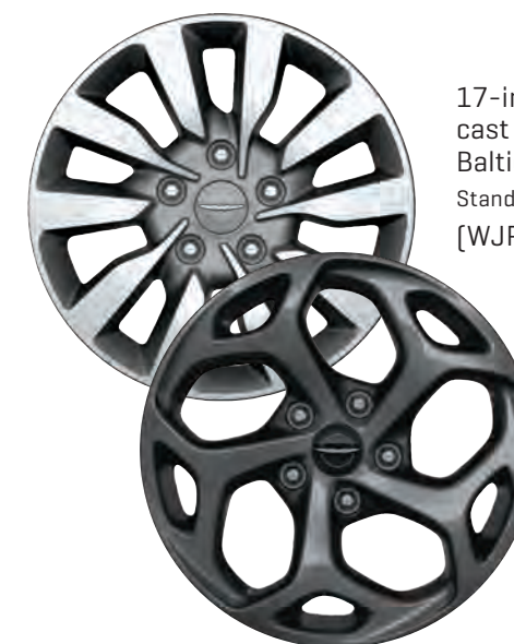
17-inch Diamond-Cut cast aluminum wheels with Baltic Grey pockets Standard [WJR]