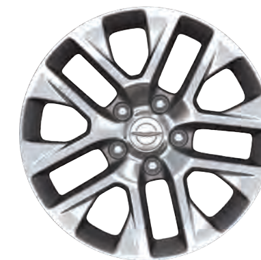
18-inch polished cast aluminum wheels with Baltic Grey pockets Standard [WDP]