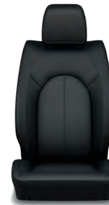
Black Caprice leatherette seats/Light Diesel stitching/Liquid Titanium accent bezels Standard