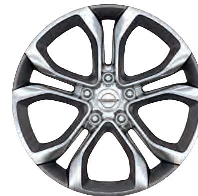
20-inch polished cast aluminum wheels with Baltic Grey pockets Standard [WH5]