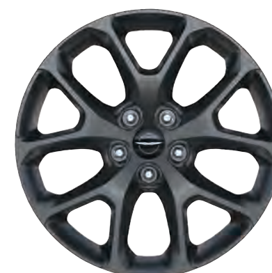
20-inch cast aluminum wheels with Foreshadow finish Standard [WPF]