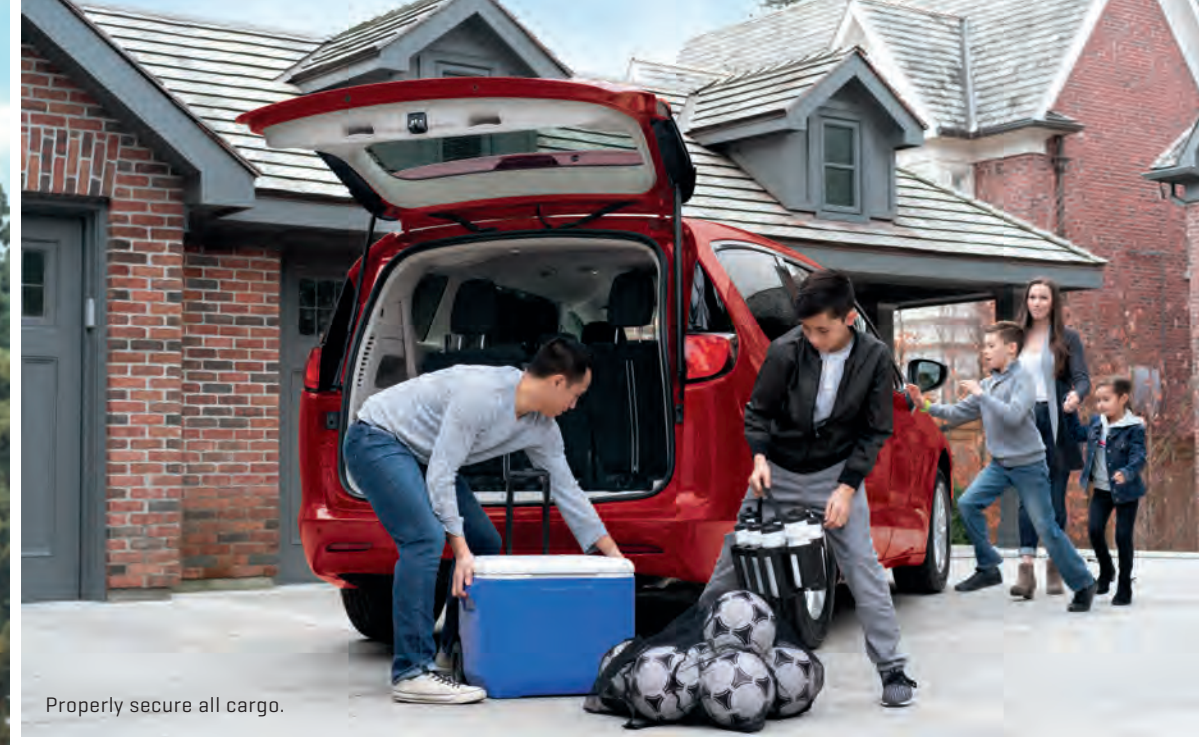
Properly secure all cargo.