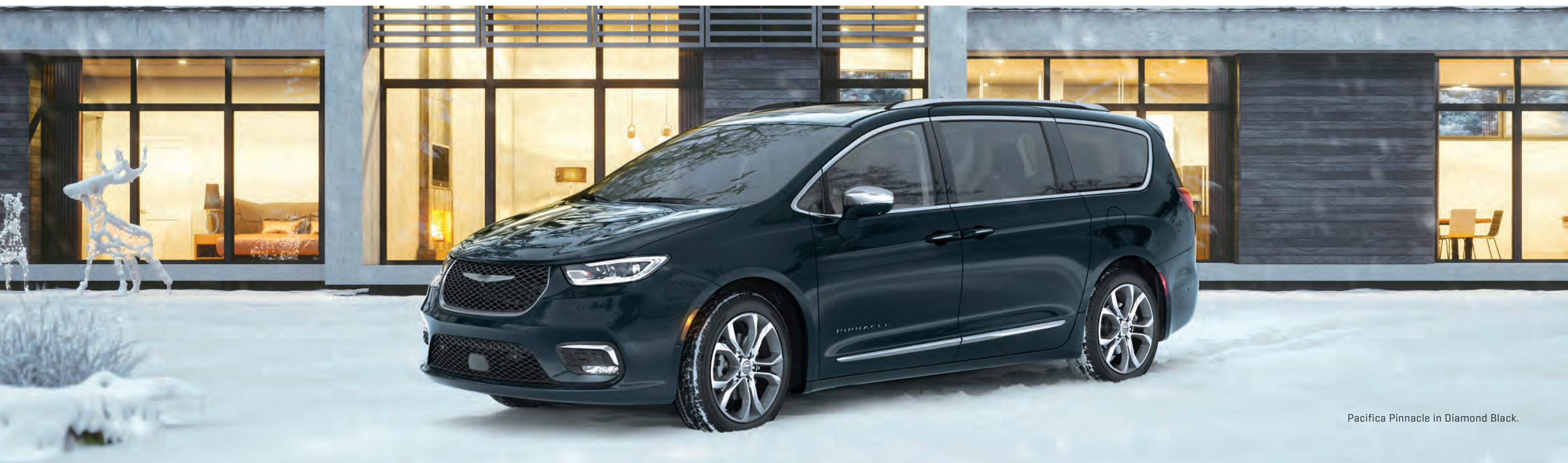
Pacifica Pinnacle in Diamond Black.

The Pacifica Pinnacle® projects its upscale pedigree with unequivocal expressions of luxury. The sculpted body is highlighted by distinctive accents and badging with Chrome exterior finishes, along with 20-inch polished aluminum wheels on the All-Wheel Drive [AWD] gas model and standard 18-inch polished aluminum wheels on the Plug-in Hybrid Electric Vehicle [PHEV] model. Advanced onboard technology, as well as premium interior finishes and storage, take family functionality to a whole new level.