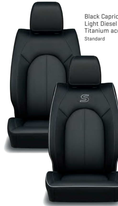
Black Caprice leatherette seats/ Light Diesel stitching/Liquid Titanium accent bezels Standard