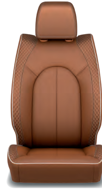
Sepia premium quilted Nappa leather-faced seats/Axis II perforated inserts/Light Diesel stitching and Sydney Grey piping Standard