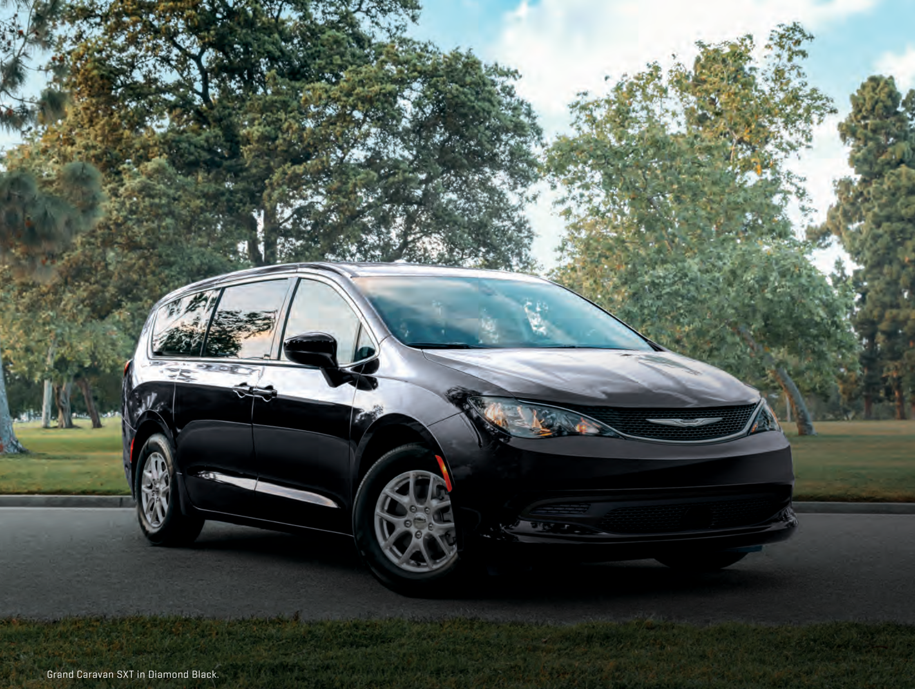
Grand Caravan SXT in Diamond Black.