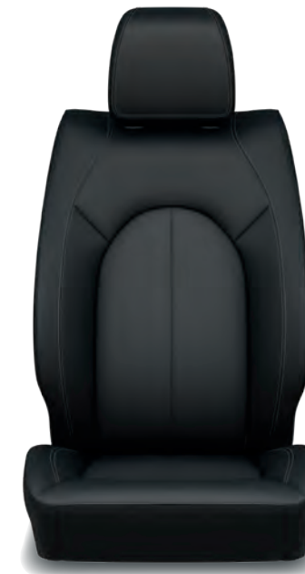
Black Caprice leatherette seats/ Light Diesel stitching/Liquid Titanium accent bezels Standard