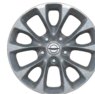
18-inch fully polished High-Gloss aluminum wheels Standard on AWD [WBS]