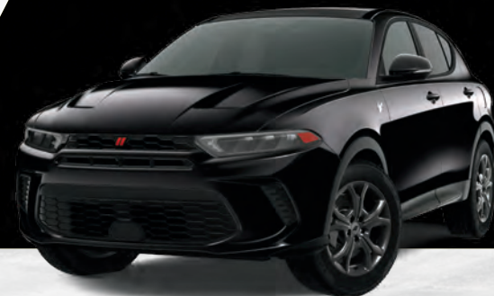
8 BALL (PXN)