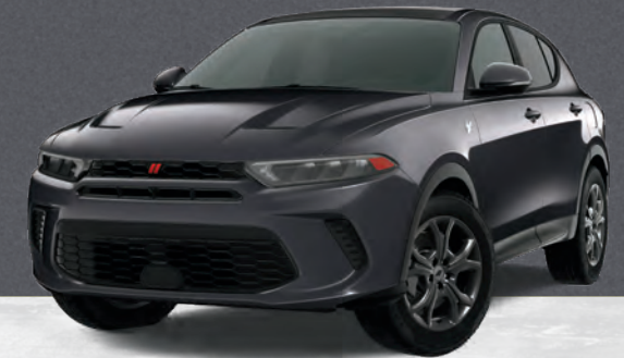
GREY CRAY (PA5)