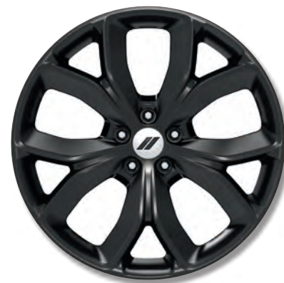
20-inch Abyss Finish // WHN (Included with Track Pack)