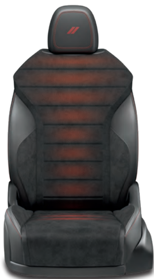
Perforated Alcantara® with Red Backing and Black Scuba Shark Bolsters with Red Accent Stitching (Included with Track Pack in Black)