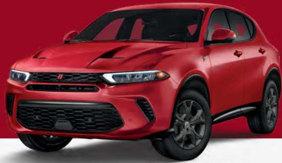
HOT TAMALE (PRR)