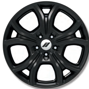
18-inch Abyss Finish // WHG (Included with Blacktop Package)