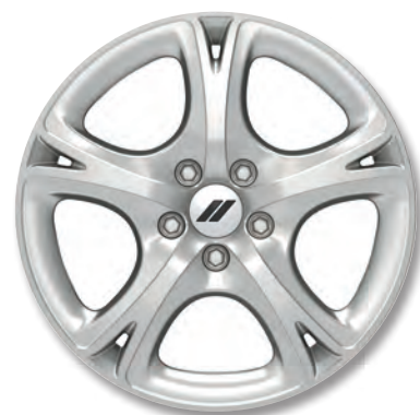
17-inch Silver // WEF (Standard)