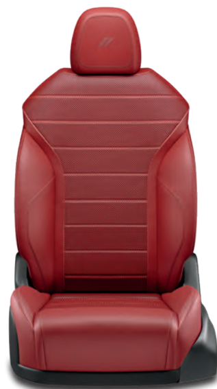
Perforated Leather Trim with Embroidered Dodge Logo and Red Stitching (Available in Red)