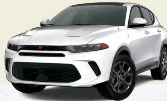
Q BALL (PW1)