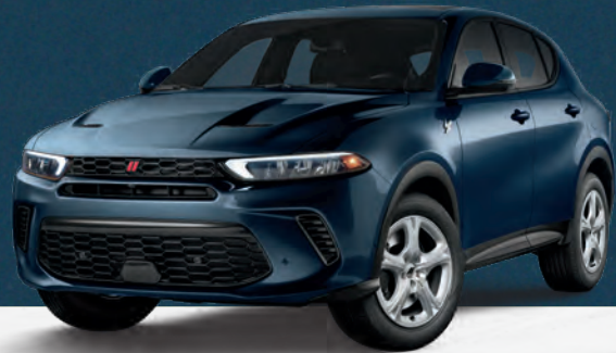
BLUE STEELE (PH6)