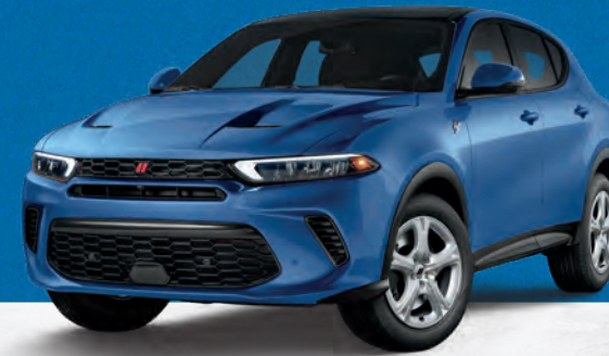
BLU BAYOU (PBX)