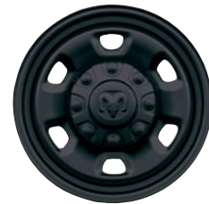
17-inch Black-Painted Steel Standard (2500 only) (WAA)