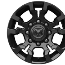
17-inch Black-Painted Aluminum Standard (WF2)