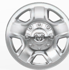
18-inch Chrome-Clad Steel Included with Chrome Appearance Group or Tradesman Level 2 Equipment Group (WBH)