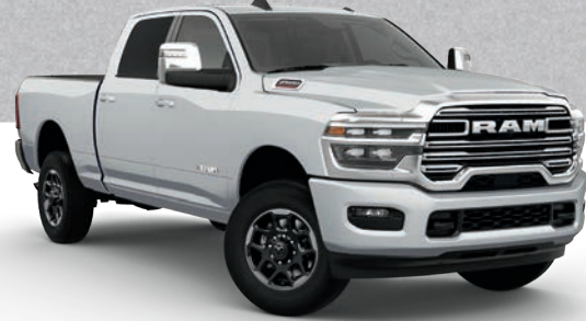
SILVER ZYNITH (PSE) Late Availability