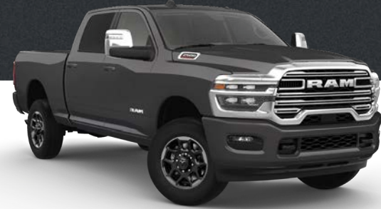
GRANITE CRYSTAL METALLIC (PAU)