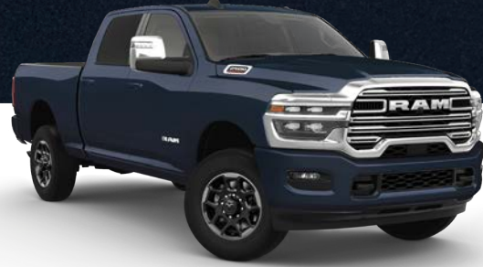
FORGED BLUE METALLIC (PCG)