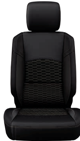
Cloth— Black Available