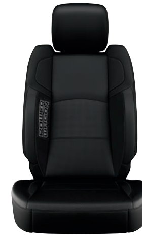
Leather-Trimmed Buckets—Black Included with Power Wagon Level 1 Equipment Group