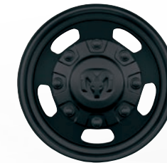
17-inch Black-Painted Steel Standard (WFG)