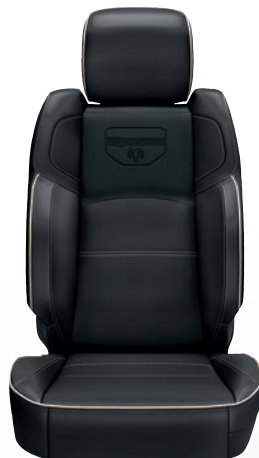
Premium Leather-Trimmed Buckets—Black Included with Rebel Level 2 Equipment Group