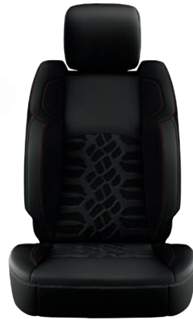
Vinyl/Cloth Bench—Black Standard