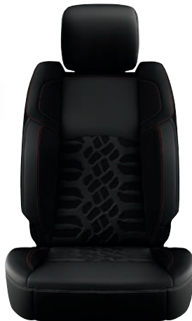
Vinyl/Cloth Bench—Black Standard