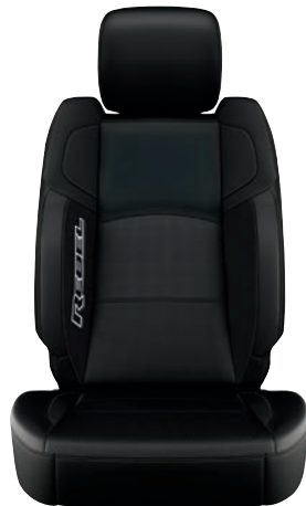
Leather-Trimmed Buckets—Black Included with Rebel Level 1 Equipment Group