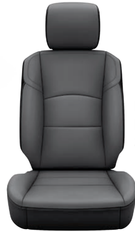
Heavy-Duty Vinyl— Diesel Gray/Black Standard