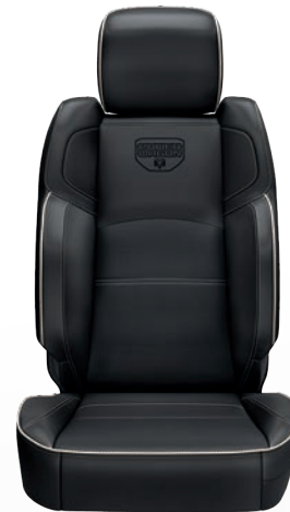
Premium Leather-Trimmed Buckets—Black Included with Power Wagon Level 2 Equipment Group