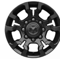
17-inch Black-Painted Aluminum Included with Power Wagon® Package (2500 only) (WF2)