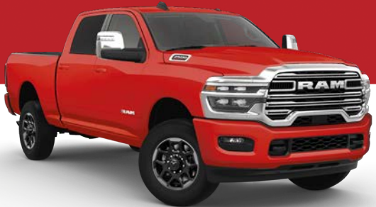
FLAME RED (PR4)