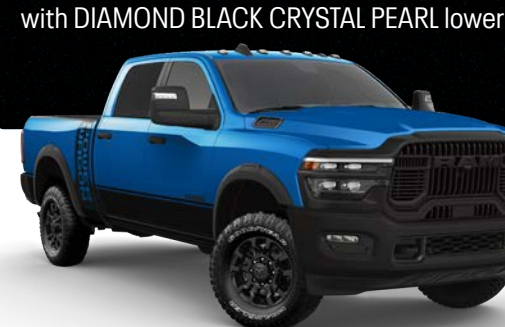
HYDRO BLUE PEARL (PBJ) Limited Availability