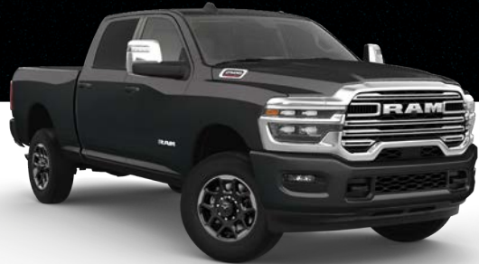
DIAMOND BLACK CRYSTAL PEARL (PXJ)