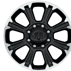
20-inch Black-Painted Diamond-Cut Aluminum Standard (WRD)