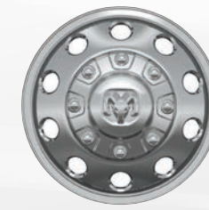
17-inch Polished Aluminum Included with Chrome Appearance Group (WF7)