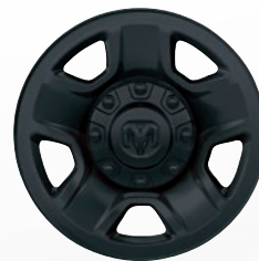
18-inch Black-Painted Steel Standard on 3500 (WBF)