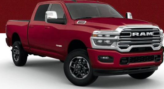
RED HOT PEARL (PR6)