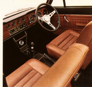
The luxurious Cortina GT 'L' interior.

The GT interior has been designed with the professional in mind. Complete GT instrumentation (speedometer, engine temperature, oil pressure, generator charging, fuel level, rev counter). Leather covered, deep dish sports steering wheel. Centre console with stubby remote-control racing gearshift. Hip-hugging contoured buckets. Thick carpeting underfoot. Heater/demister. AeroFlow ventilation.