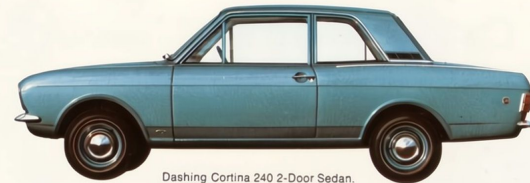
Dashing Cortina 240 2-Door Sedan.

Shown left — The Cortina 240 'L' 2-Door Sedan, most luxurious 'low priced' car in Australia.