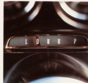
3-speed Automatic transmission is optional.