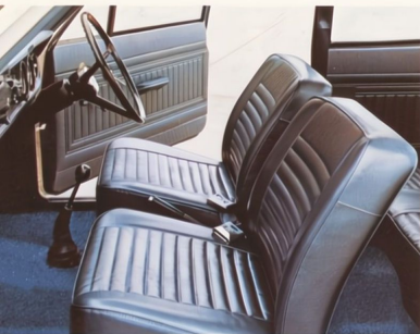
Left: Cortina 240 Interior Right: Cortina 240 'L' Interior Both feature easy-to-care-for, all-vinyl trim; deep-pile carpeting; heater/demister; plus all the Cortina Lifeguard Design Safety Features listed on page 15.

'L' stands for luxury — lively loads of it! In addition to all the comfort features already mentioned, you get a glowing, genuine walnut dashboard . . . arm-chair contoured bucket seats with 'Woven Grain' inserts for extra comfort and 'breathing' . . . contoured rear seats . . . carpet kick pads on doors . . . extra sound-deadening and insulating materials all round the passenger compartment . . . a centre sports-type console. Outside, distinctive 'L' badges on the rear deck, front grille and rear fender sides; special wheel covers and chromed rocker panel mouldings quietly indicate that you're driving the ultimate in light car luxury.