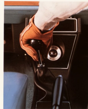
All-synchromesh 4-speed floor shift is standard.