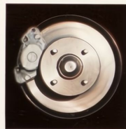
Disc brakes standard.