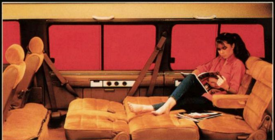
Sit up. Lie down. Sit back. Spectron XLT relaxes with you.

In the rear, there's further seating for three passengers with a full-width bench seat which can be folded forward to more than double baggage space. Or fully reclined with the other two rows of seats to make a large comfortable bed.