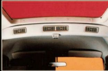
Rear overhead air conditioning console and vents are completely separate from the front unit. They are part of the optional air conditioning system available on Spectron XLT.

filler lid and left hand-side exterior rear view mirror. For entertainment, there's an AM/FM radio and stereo cassette unit. Ventilation and heating are taken care of by a four-stage fan and well positioned vents. A rear window demister and rear washer/wiper are standard.