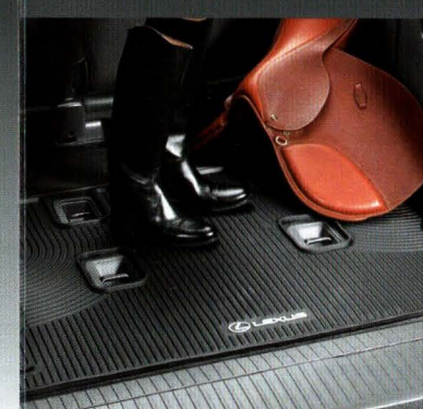
ALL-WEATHER CARGO MAT